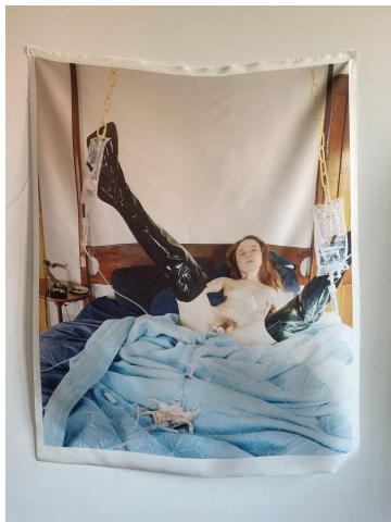
SKIN HUNGER, 2021-23 Archival pigment print on silk 42 x 53 in