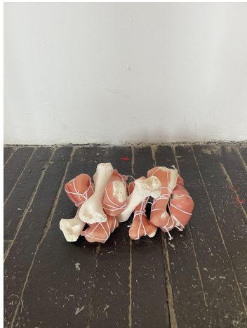
TWO SKINS AS SINGLE USE II , 2023 Plaster, silicone, string 10x6x4 in