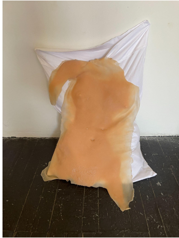
TWO SKINS AS SINGLE USE I , 2023 Silicone, 50 lbs of sand, cotton pillowcase 24x18x12 in