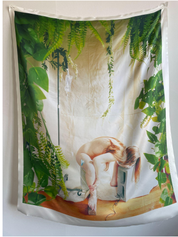
I AM THE EMBODIMENT OF FLUID I, 2021-23 Archival pigment print on silk 42 x 53 in