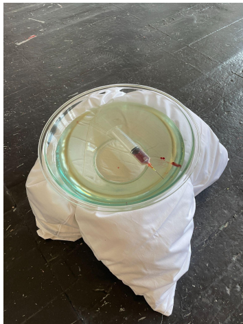
TASTE FOR THE SAKE OF TASTING, 2023

Pyrex bowl, syringe, cotton pillow case, resin, string, remnant of sterile water, dye