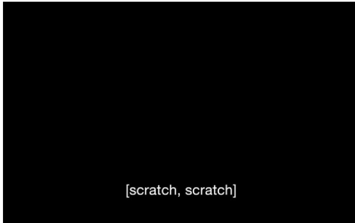
Carolyn Lazard Leans, Reverses (still), 2022.

A pitch black background. Centered in the bottom third of the image are white captions that read, "[scratch, scratch]".