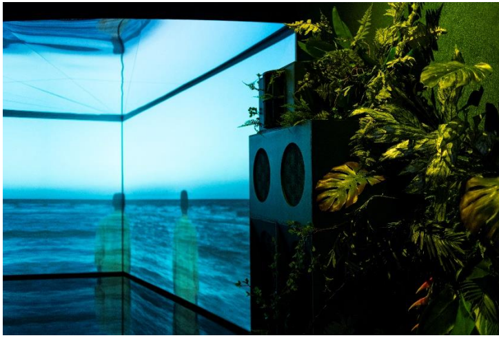
Terence Nance, Swimming In Your Skin Again , 2015.

Video, two channel projection, water, mirror, plants, sound system.