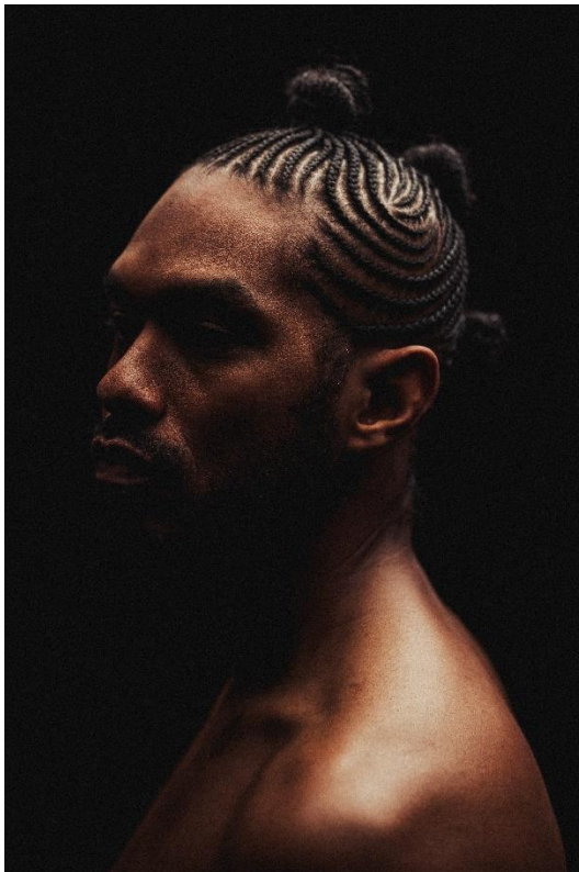
Terence Nance, 2023.

Installation view, Institute of Contemporary Art, University of Pennsylvania.