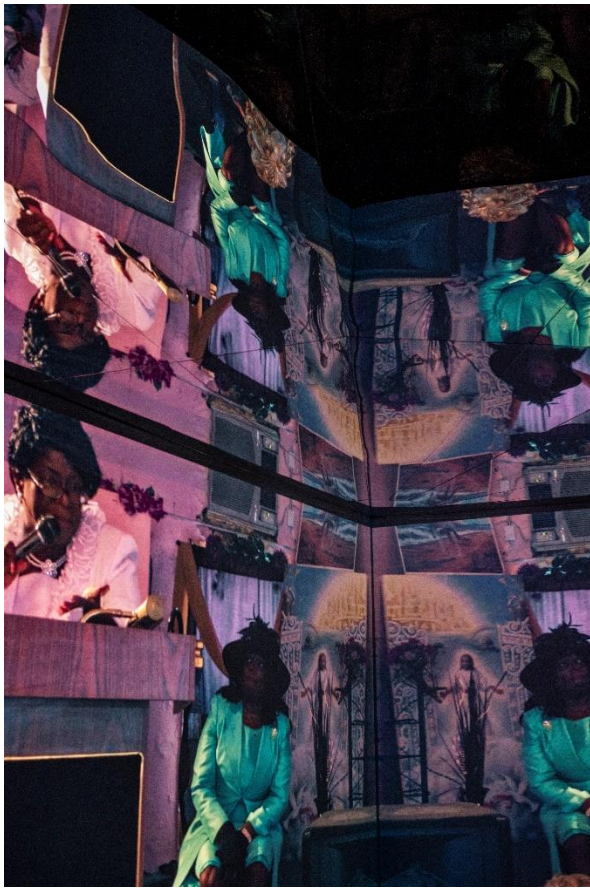
Terence Nance, Swimming In Your Skin Again , 2015.

Video, two channel projection, water, mirror, plants, sound system.