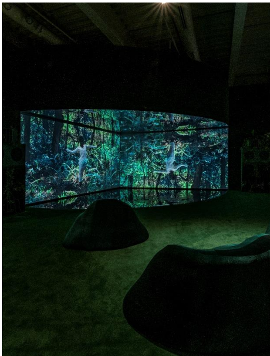
Terence Nance, Swimming in Your Skin Again , 2015.

Video, two channel projection, water, mirror, plants, sound system.