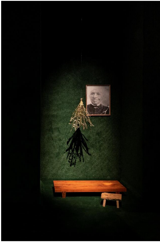
Terence Nance, Swimming In Your Skin Again , 2015.