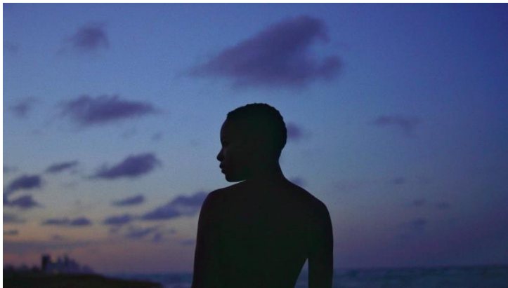
Terence Nance, Swimming in Your Skin Again – Still, 2015