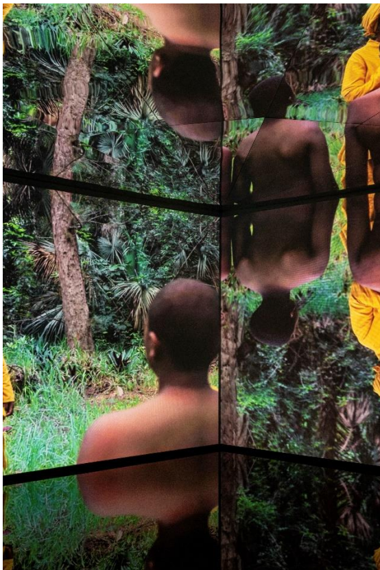
Terence Nance, Swimming In Your Skin Again , 2015.

Installation view, Institute of Contemporary Art, University of Pennsylvania.