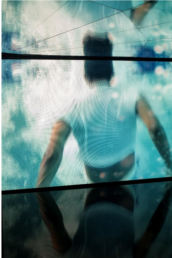
Terence Nance, Swimming In Your Skin Again , 2015.

Installation view, Institute of Contemporary Art, University of Pennsylvania.