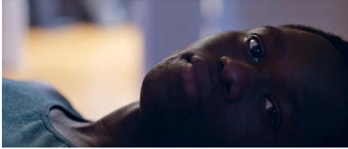
Terence Nance, Univitellin – Still, 2016.