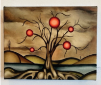
Robert Zehnder Red Orb Tree , 2023 Oil on canvas over panel 11 x 14 x 1 1/2 in.