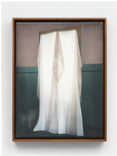
Alexandra Barth A Covered Window , 2022 Acrylic on Canvas 15 3/4 x 11 3/4 in.