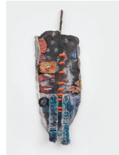
Nickola Pottinger Walk good , 2022 Pigments, Rope, Foraged Gravel, and Handmade Paper Pulp 70 x 24 x 1 in.