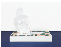
Carolyn Salas Seated Figure , 2021 Water Jet Cut and Powder-Coated Aluminum 43 x 51 x 22 in.