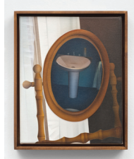
Alexandra Barth Sink in a Mirror , 2022 Acrylic on Canvas 11 3/4 x 9 7/8 in.