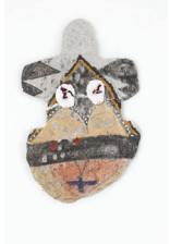
Nickola Pottinger yuh too big , 2022 Paper Pulp, Sorrel, Oil Pastel, and Watercolor 29 x 20 x 1 in.