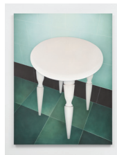
Alexandra Barth Little Round Table , 2022 Acrylic on Canvas 47 1/4 x 35 3/8 in.