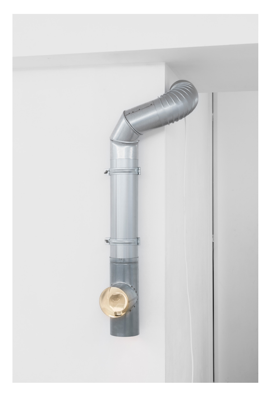
Sarah Fripon, Esoteric Pipe 3 , 2023 Zinc pipes, glass sphere, cable, 110 x 15 x 30 cm

Inside them are lights and crystal spheres of different sizes which function as illuminated and mirrored spots, symbols that, "according to cultural wisdom, predict the future and refer to the esoteric and to fortune", affirms the artist. Like free concatenations of 'visual associations', these pipes bring some of the surrounding's vibrancy into their modular form, while also resonating with the question of the future of energy supply and the notion of nostalgic homeliness associated with the idea of stove heating.