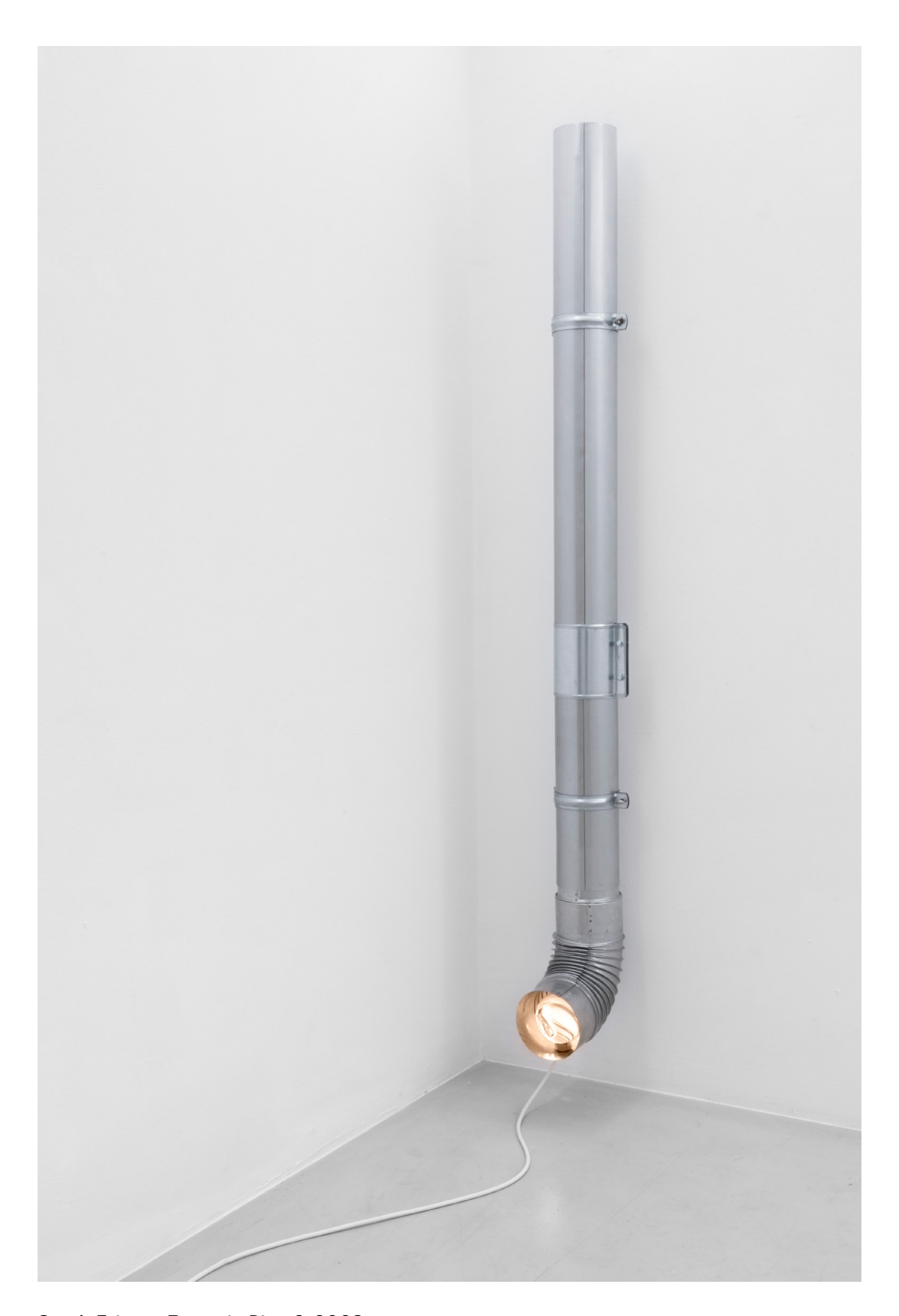
Sarah Fripon, Esoteric Pipe 2 , 2023 Zinc pipes, glass sphere, cable, 175 x 15 x 15 cm Courtesy the artist

Given the relatively small venue on the lower floor of the gallery, the lack of natural light and the rather low ceiling, the artist reacted to the space by imagining these three sculptural elements as tools nourishing a chain of feelings, suggestions and echoes within the space, where a mostly closed door leads to some cellars inaccessible to visitors, but whose presence is however quite palpable. Consisting of modular zinc pipes assembled together, two of these sculptures are installed close to the corners of the room, while a third one lies on the floor.