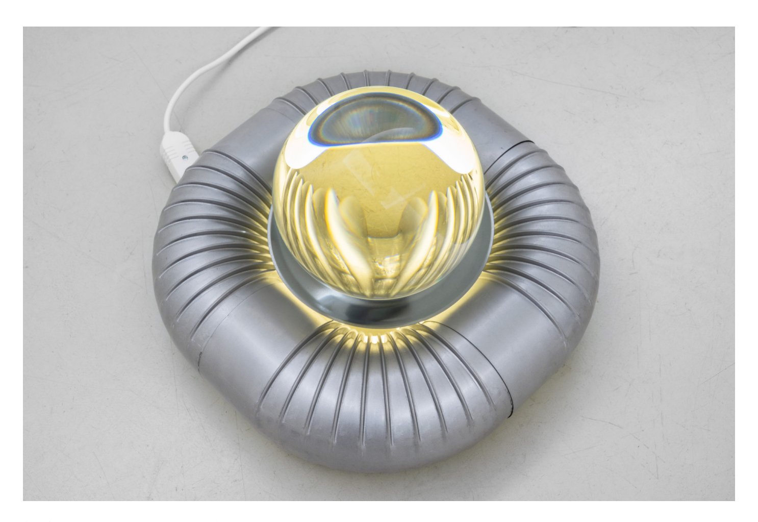
Sarah Fripon, Esoteric Pipe 1, 2023 Zinc pipes, glass sphere, LED spot, 40 x 40 x 35 cm

Although Fripon's practice tends to focus mostly on pictorial research, the artist also works in sculptures and installations, which often enter into dialogue with the canvases. Conceived on coming face to face with the peculiarities of the exhibition venue, these works, together with the paintings, respond to the intention of creating an atmosphere as if in a kind of time capsule that preserves and archives its current state of energy and exchange.