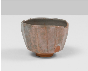
HOSAI MATSUBAYASHI XVI Beni Tea bowl (red deer back pattern herame) , 2020 Glazed ceramic 3.4 x 4.9 x 4.75 in / 8.5 x 12.4 x 11.9 cm