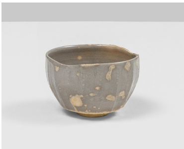
HOSAI MATSUBAYASHI XVI Kase Tea bowl (deer back herame) , 2020 Glazed ceramic 3.1 x 4.9 in / 7.9 x 12.4 cm