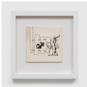
PHILIP RICH Untitled , ca. 1965–67 India ink on paper Paper size: 6 x 6 in / 15.2 x 15.2 cm Framed: 11.25 x 11.25 in / 28.6 x 28.6 cm