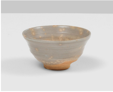
HOSAI MATSUBAYASHI XVI Kase Chawan , 2019 Ceramic, glaze 2.75 x 5.5 x 5.5 in / 7 x 14 x 14 cm