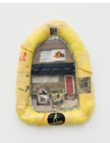
Manal Kara Taxonomies of brutality, whose systematics are in flux, pt 3 , 2020 ceramic, photographic prints on fabric 69 x 53 x 8 cm | 27 x 21 x 3 in