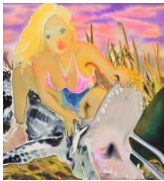
Julia Garcia Peachy, 2023 Acrylic and ink on canvas 101.5 x 91.5 cm | 40 x 36 inch