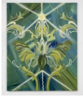
Calli Moore Emerald Star Blossom , 2023 Acrylic and oil on canvas 152.5 x 122 cm | 60 x 48 in