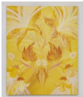
Calli Moore Jessamine Dreams , 2023 Acrylic and oil on canvas 152.5 x 122 cm | 60 x 48 in