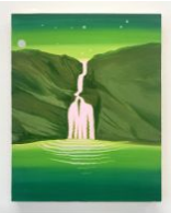
Jen Hitchings A.C., Highland Falls Nature Preserve, Philmont, NY (Capricorn) , 2023 Oil on panel 35.5 x 28 cm | 14 x 11 in