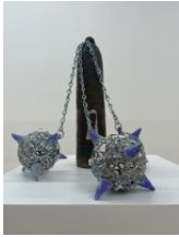
Manal Kara Glossolalia, ululations and other orogenous wailings, 2018 Ceramic, chain 43 x 20 x 20 cm / 17 x 8 x 8 in