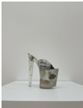
Manal Kara Battlestar Nausicaa Bambaataa, 2018 Sea creatures, photographic prints on fabric, polyester resin 19 x 8 x 18 cm / 7 1/2 x 3 x 7 in