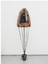
Manal Kara The Image II, 2022 ceramic, photographic prints on fabric, synthetic hair 74 x 56 x 10 cm / 29 x 22 x 4 in with 20 x 20 x 20 cm / 8 x 8 x 5 in object on floor attached to wall piece by hair