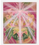
Calli Moore Springtide Renaissance II , 2023 Acrylic and oil on canvas 152.5 x 122 cm | 60 x 48 in