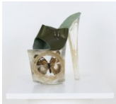
Manal Kara Iphigenia II, 2018 Butterfly, horse hair, leather, body jewelry, polyester resin 20 x 8 x 18 cm / 8 x 3 x 7 in