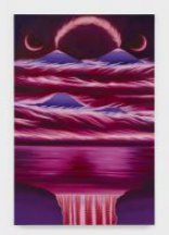
Jen Hitchings Windy Dusk , 2022 Oil on canvas 122 x 81 cm | 48 x 32 in