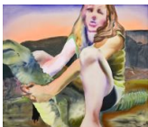
Julia Garcia Ride, 2023 Acrylic and ink on canvas 132 cm x 152.5 | 52 x 60 in