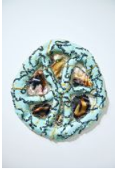
Manal Kara Slug Ring , 2021 ceramic, photographic prints on fabric 79 x 76 x 10 cm / 31 x 30 x 4 in