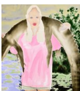
Julia Garcia Moonshine, 2023 Acrylic and ink on canvas 122 x 107 cm | 48 x 42 in