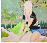
Julia Garcia Palms, 2023 Acrylic and ink on canvas 196 x 213.5 cm | 77 x 84 inch