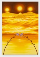
Jen Hitchings Lillies at Dawn , 2022 Oil on canvas 122 x 81 cm | 48 x 32 in