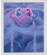
Calli Moore Blue Sapphire Blossom , 2023 Acrylic and oil on canvas 152.5 x 122 cm | 60 x 48 in