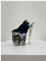
Manal Kara Thirst of water, 2018 Barbed wire, teasel, leather, polyester resin 19 x 8 x 18 cm / 7 1/2 x 3 x 7 in