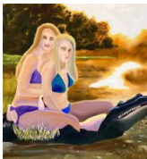
Julia Garcia Sunset, 2023 Acrylic and ink on canvas 234 x 211 cm | 92 x 83 inch