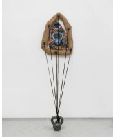
Manal Kara The Image, 2022 ceramic, photographic prints on fabric, kettlebell, synthetic hair 70 x 56 x 10 cm / 27 1/2 x 22 x 4 in with 20 x 20 x 13 cm / 8 x 8 x 5 in object on floor attached to wall piece by hair