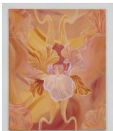
Calli Moore Tangerine Iris Blossom , 2023 Acrylic and oil on canvas 152.5 x 122 cm | 60 x 48 in