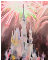
Julia Garcia Night Show, 2023 Acrylic and ink on canvas 152 x 122 cm | 60 x 48 in