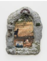
Manal Kara Argania {baruch} spinoza , 2020 ceramic, photographic prints on fabric 74 x 58.5 x 10 cm | 29 x 23 x 4 in