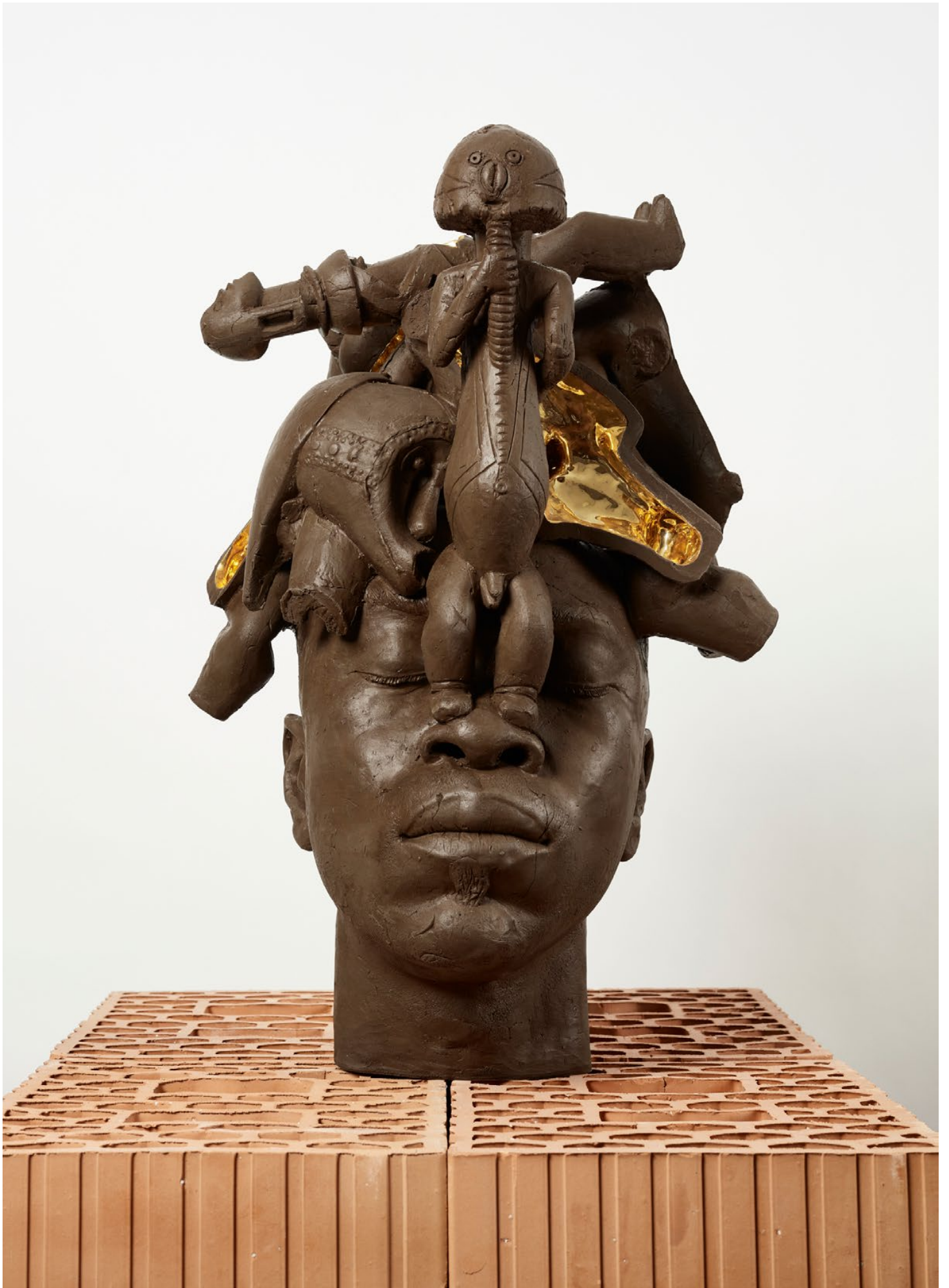
Victor Fotso Nyie, Voyager ensemble , 2021 ceramic and gold, 54 x 35 x 40 cm