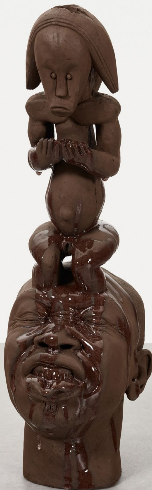
Victor Fotso Nyie, Purificazione , 2022 glazed ceramic, 73 × 23,5 × 33 cm