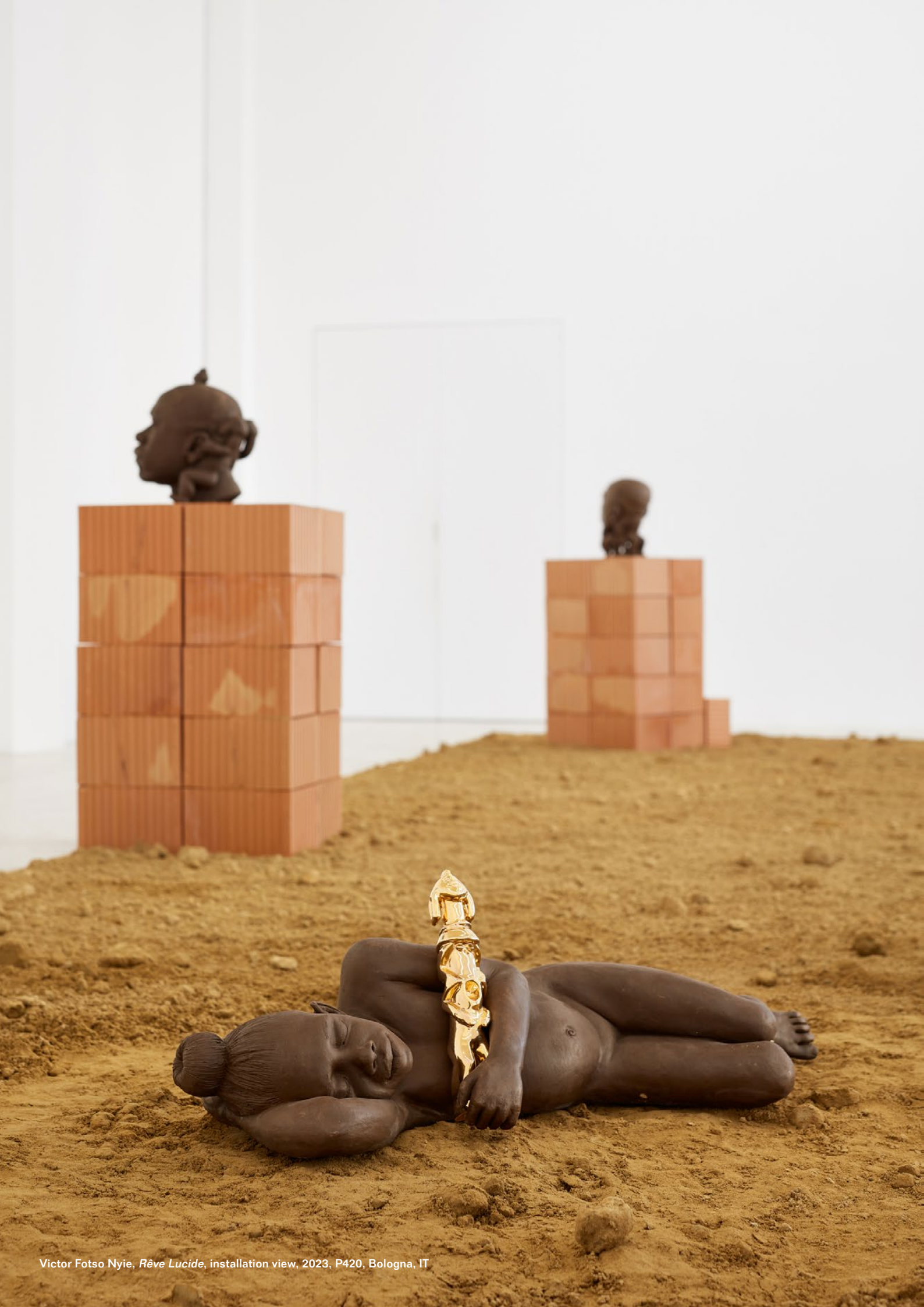
Victor Fotso Nyie, Rêve Lucide , installation view, 2023, P420, Bologna, IT