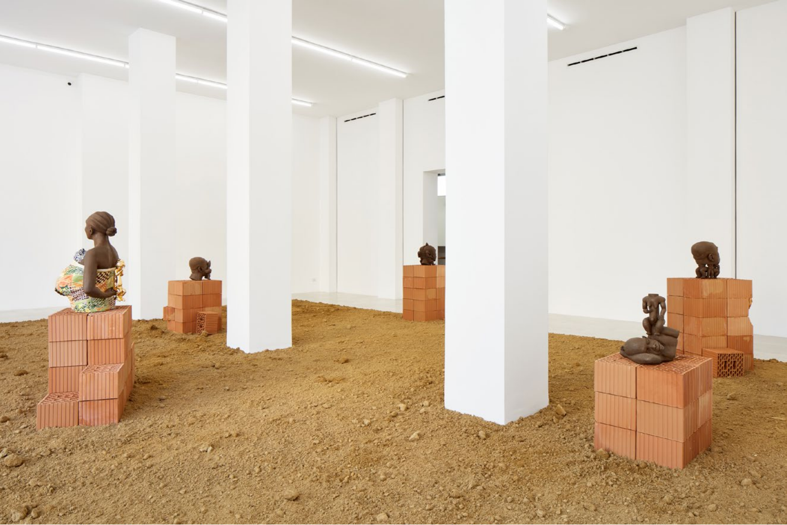
Victor Fotso Nyie, Rêve Lucide , installation view, 2023, P420, Bologna, IT