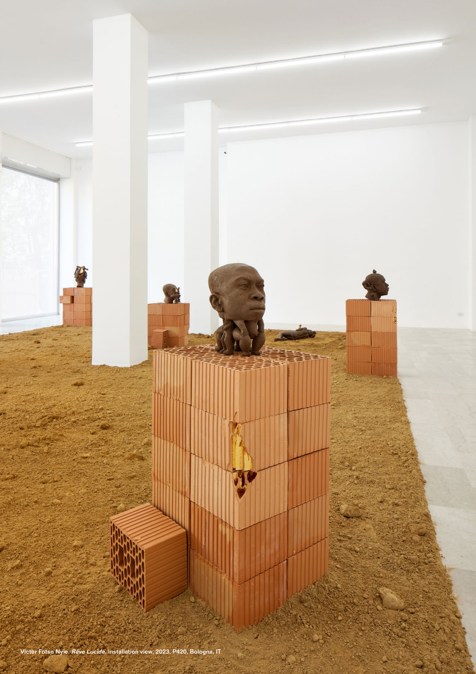
Victor Fotso Nyie, Rêve Lucide , installation view, 2023, P420, Bologna, IT