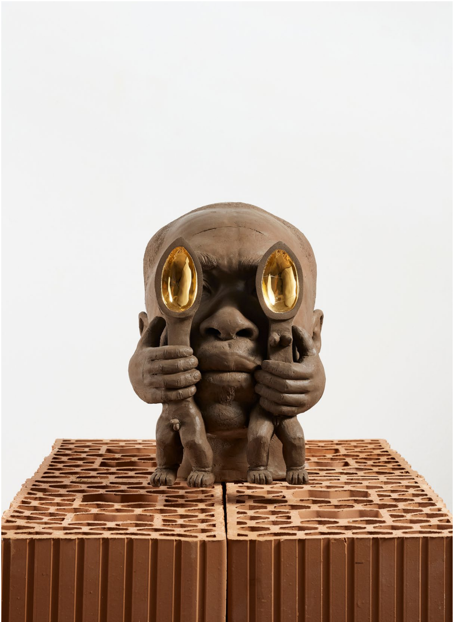
Victor Fotso Nyie, Vue céleste , 2022 ceramic and gold, 35 x 23 x 30 cm