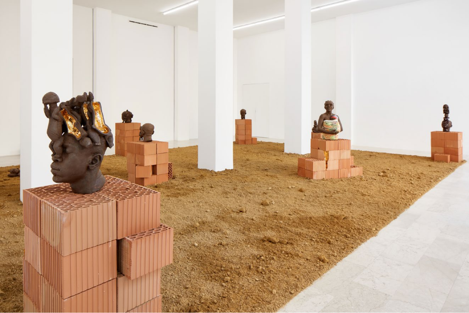
Victor Fotso Nyie, Rêve Lucide , installation view, 2023, P420, Bologna, IT