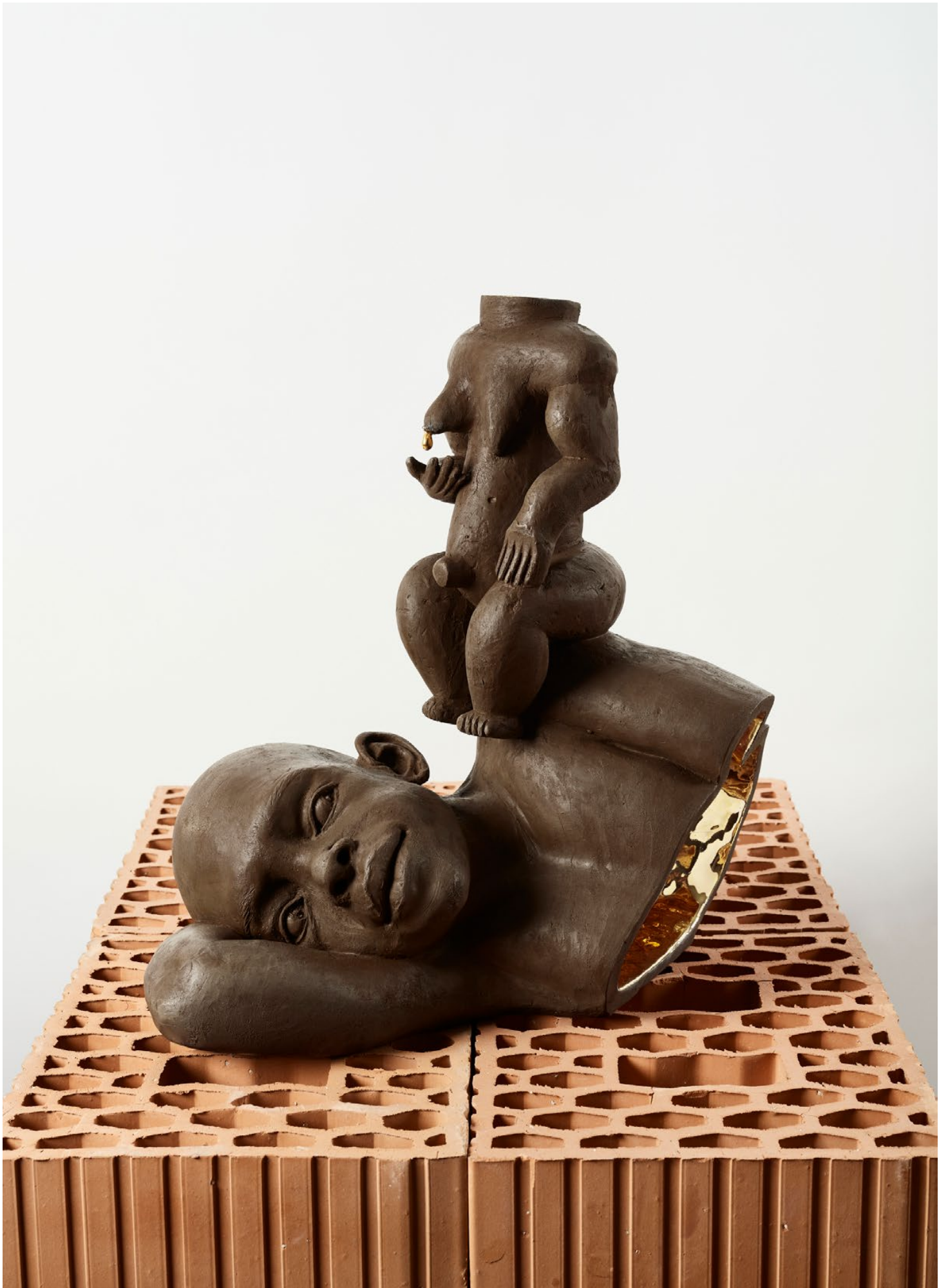
Victor Fotso Nyie, Rêve lucide , 2021 ceramic and gold, 32 x 42 x 35 cm