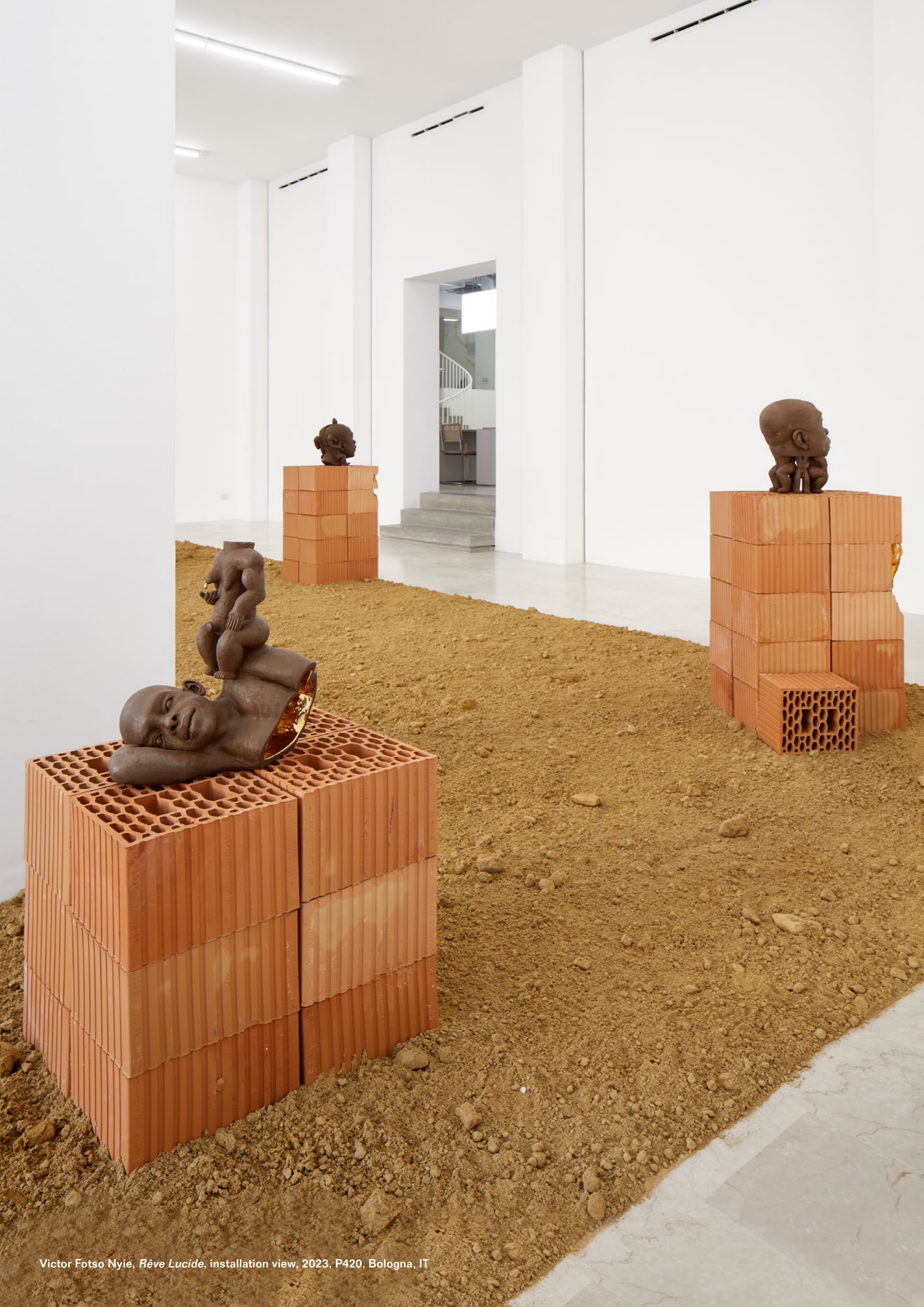
Victor Fotso Nyie, Rêve Lucide , installation view, 2023, P420, Bologna, IT