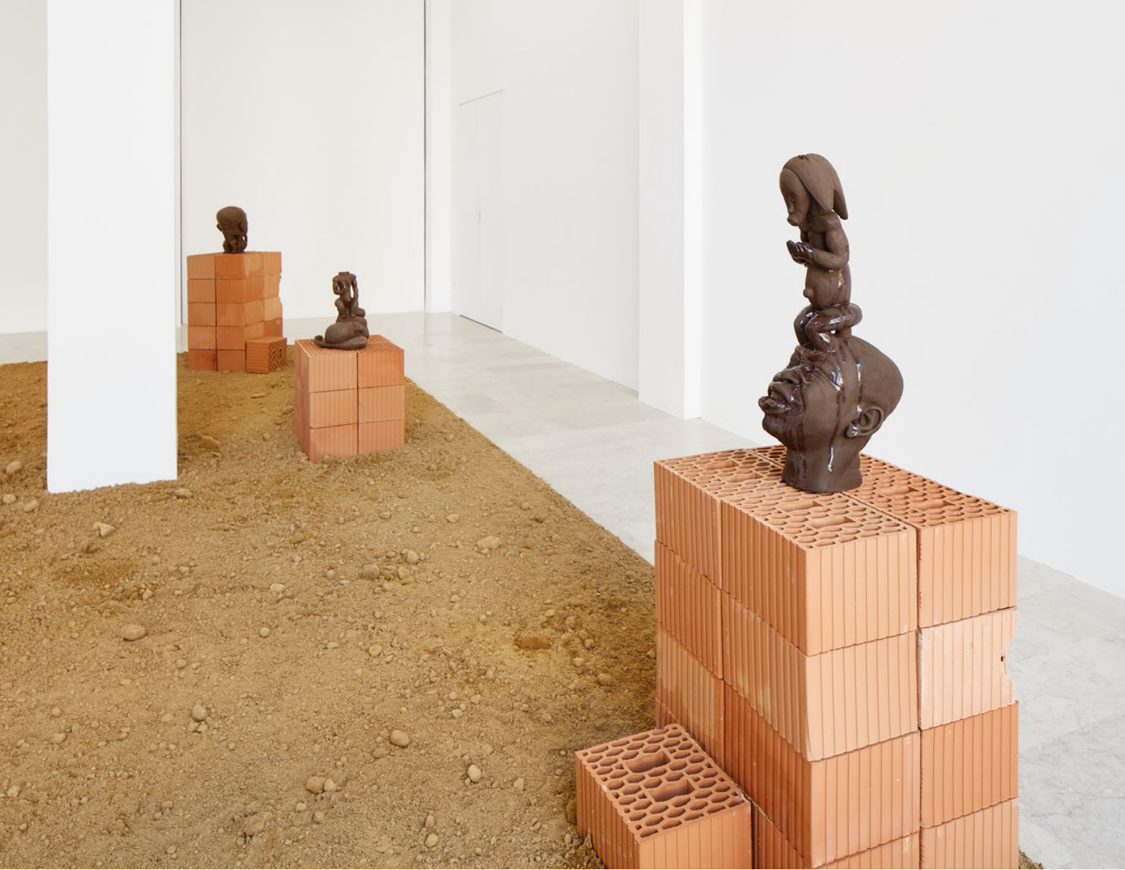
Victor Fotso Nyie, Rêve Lucide , installation view, 2023, P420, Bologna, IT