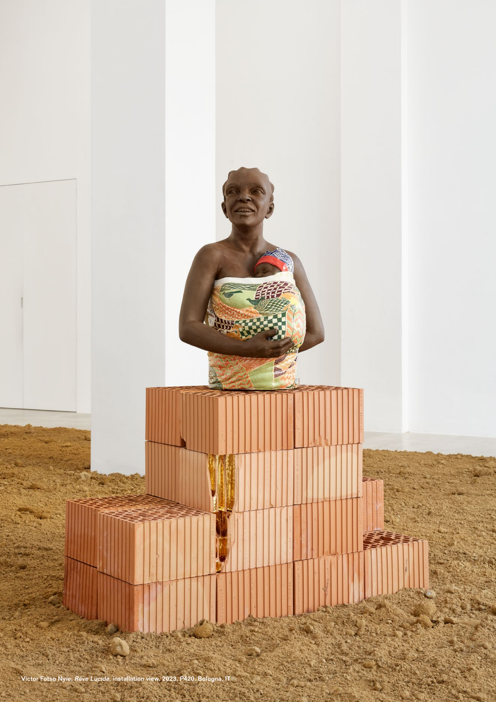
Victor Fotso Nyie. Rêve Lucide , installation view, 2023. P420, Bologna, IT