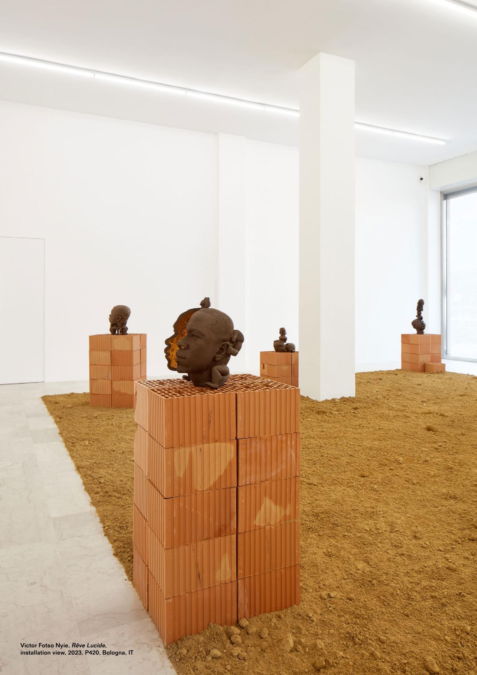
Victor Fotso Nyie, Rêve Lucide , installation view, 2023, P420, Bologna, IT