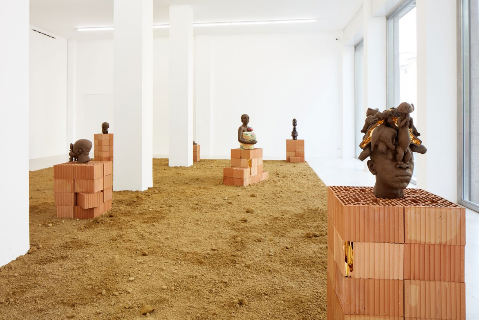
Victor Fotso Nyie, Rêve Lucide , installation view, 2023, P420, Bologna, IT