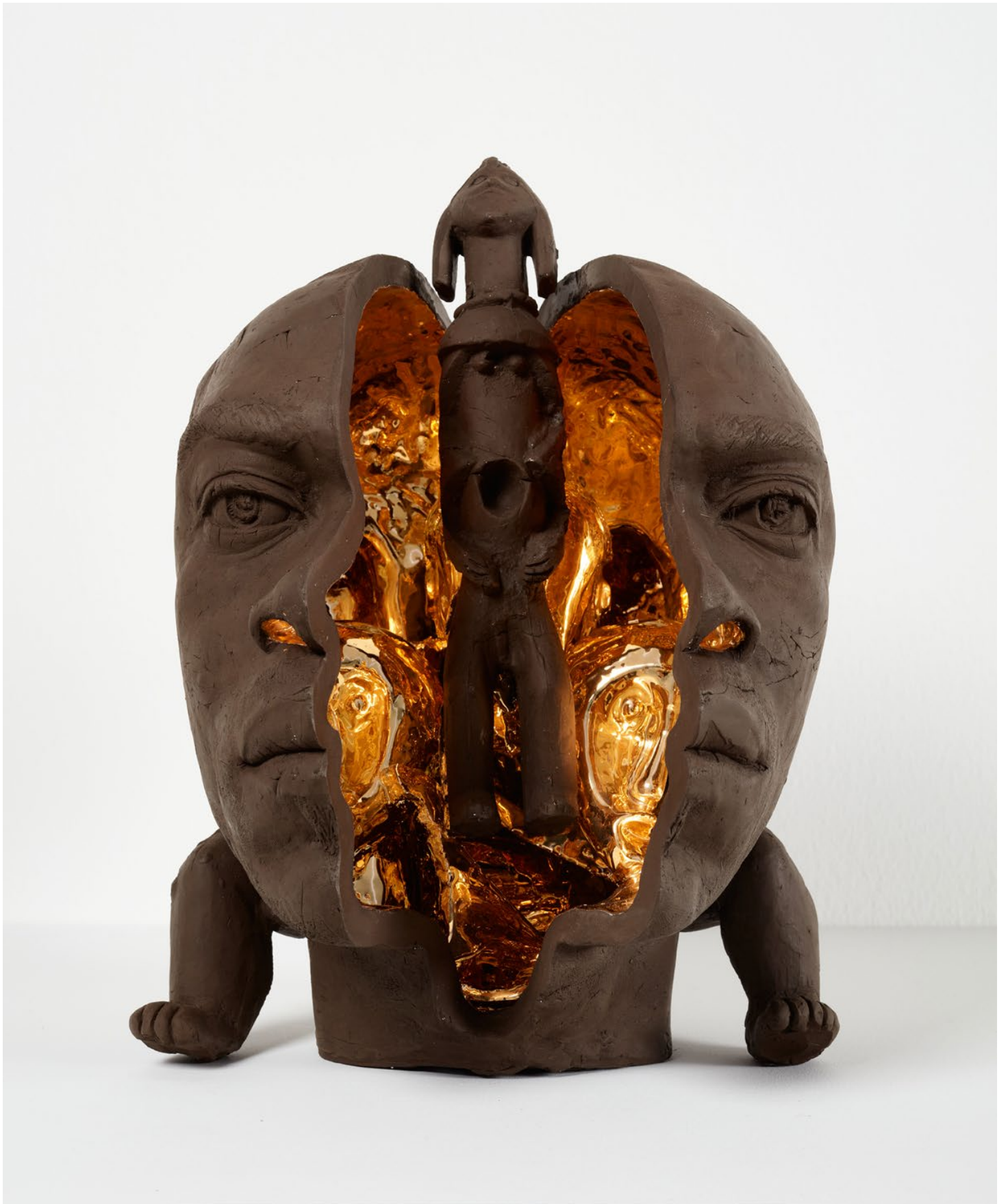
Victor Fotso Nyie, Venus , 2022 ceramic and gold, 40 × 28,5 × 33 cm