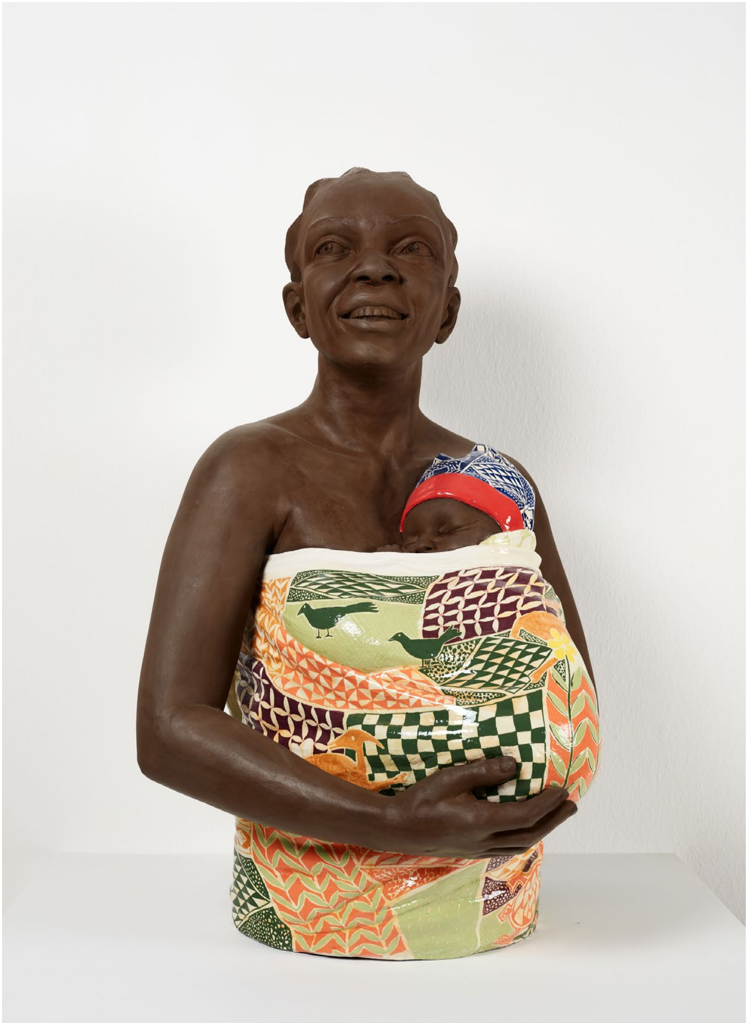
Victor Fotso Nyie, Reine mère , 2022 polychrome ceramic, 80 × 58 × 49 cm