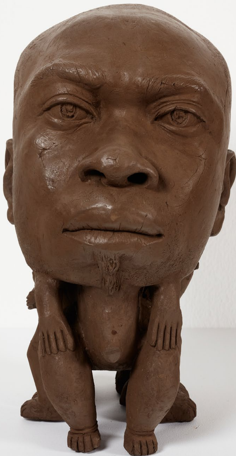
Victor Fotso Nyie, Notable , 2022 ceramic, 40 x 22 x 29 cm