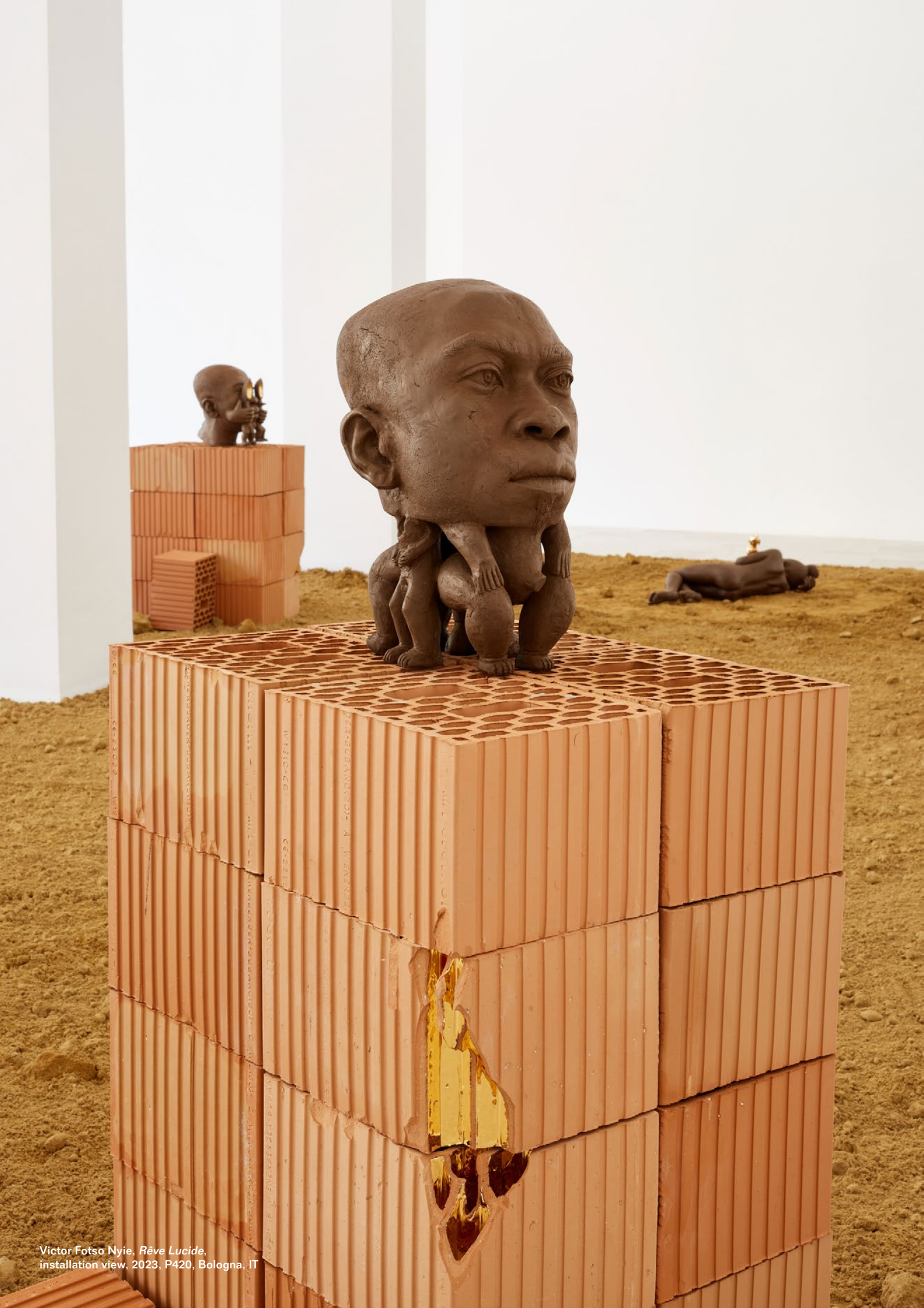
Victor Fotso Nyie, Rêve Lucide , installation view, 2023, P420, Bologna, IT