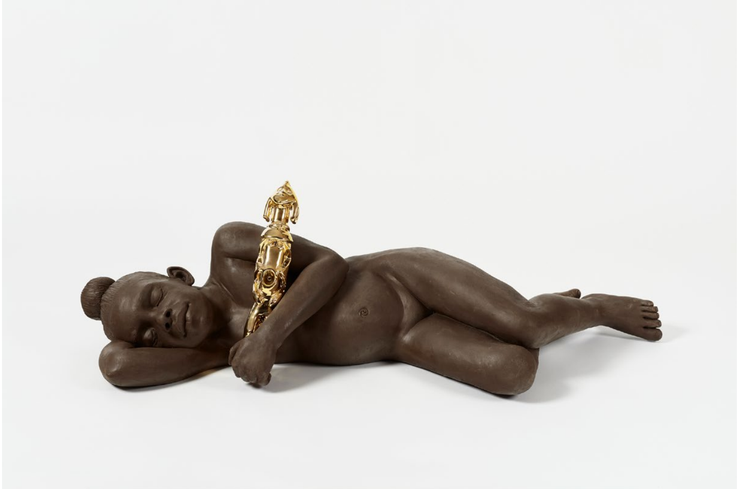
Victor Fotso Nyie, Observer les Étoiles , 2021 ceramic and gold, 23 × 99 × 34 cm