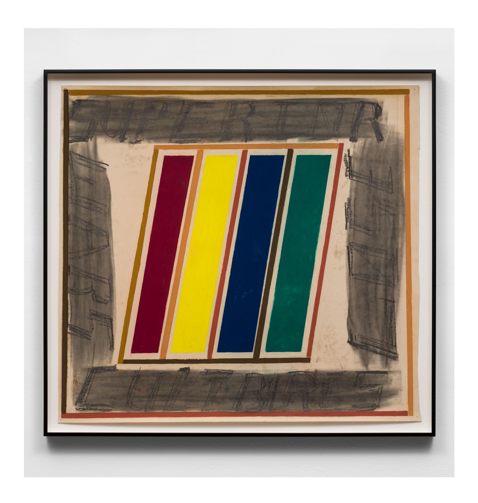
David Shull Superior Cultures Lose Wars, 2019 Graphite and soft pastel on sandpaper 26 3/4 x 28 1/2 in. | 67.9 x 72.4 cm 29 x 31 x 1 1/2 in. framed