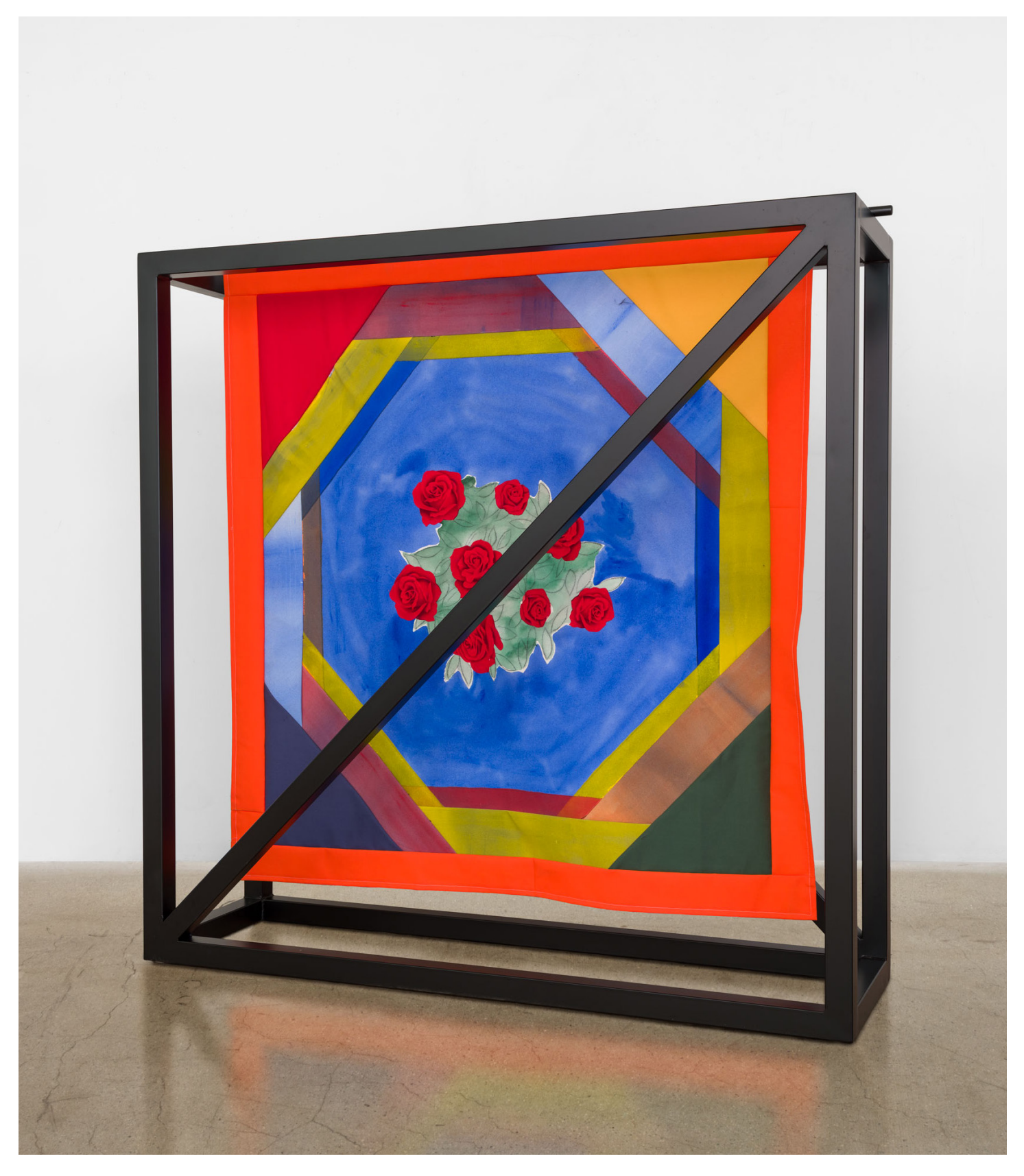
David Shull Our Lady of Flowers, 2022 Acrylic, assemblaged print fabric on canvas, thread, powder-coated steel 60 x 60 x 18 in. | 152.4 x 152.4 x 45.7 cm Painting Dimensions: 55 x 53 in