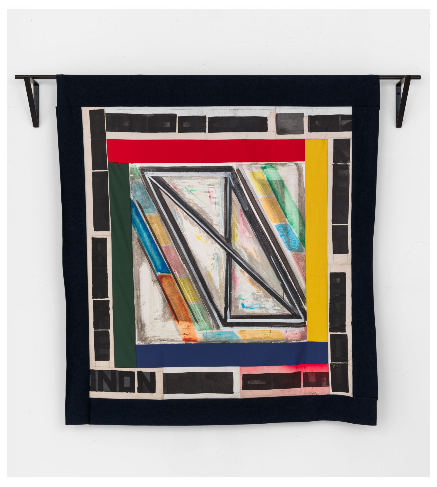
David Shull X-Redacted, 2020 Acrylic and ink on canvas, denim, thread 62 x 57 in. | 157.5 x 144.8 cm 62 x 69 x 8 in. with hardware