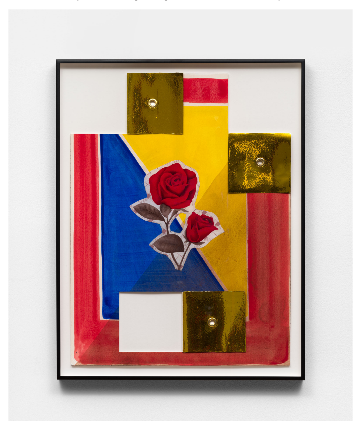
David Shull Our Lady of Flowers 2, 2017 Acrylic, printed fabric, poly gold foil, grommets on paper 18 x 24 in. | 45.7 x 61 cm 26 1/8 x 20 1/4 x 1 1/2 in. framed