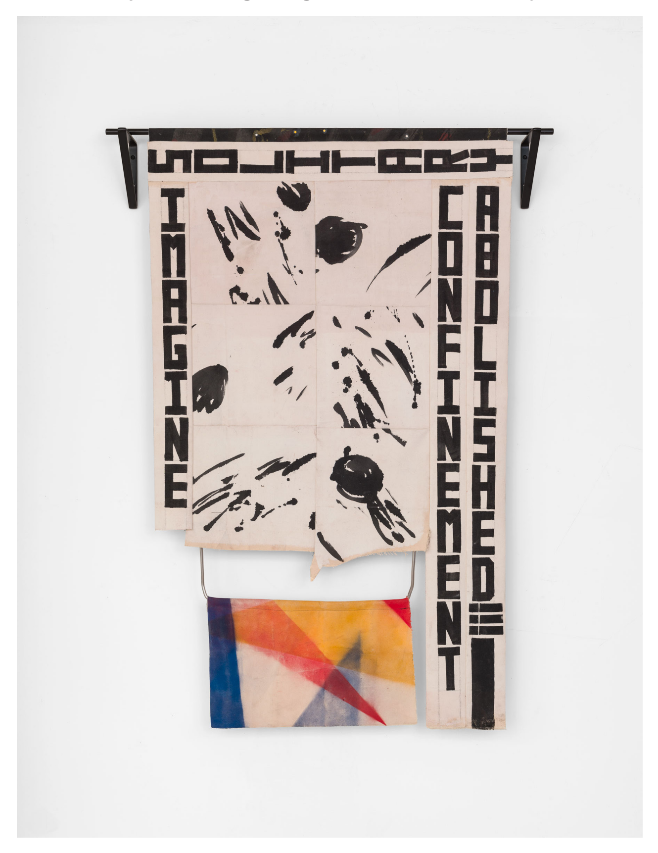
David Shull Imagine Solitary Confinement Abolished, 2016 Acrylic, ink, spray paint, thread, armature wire, canvas 71 x 42 in. | 180.3 x 106.7 cm 71 x 55 x 8 in. with hardware