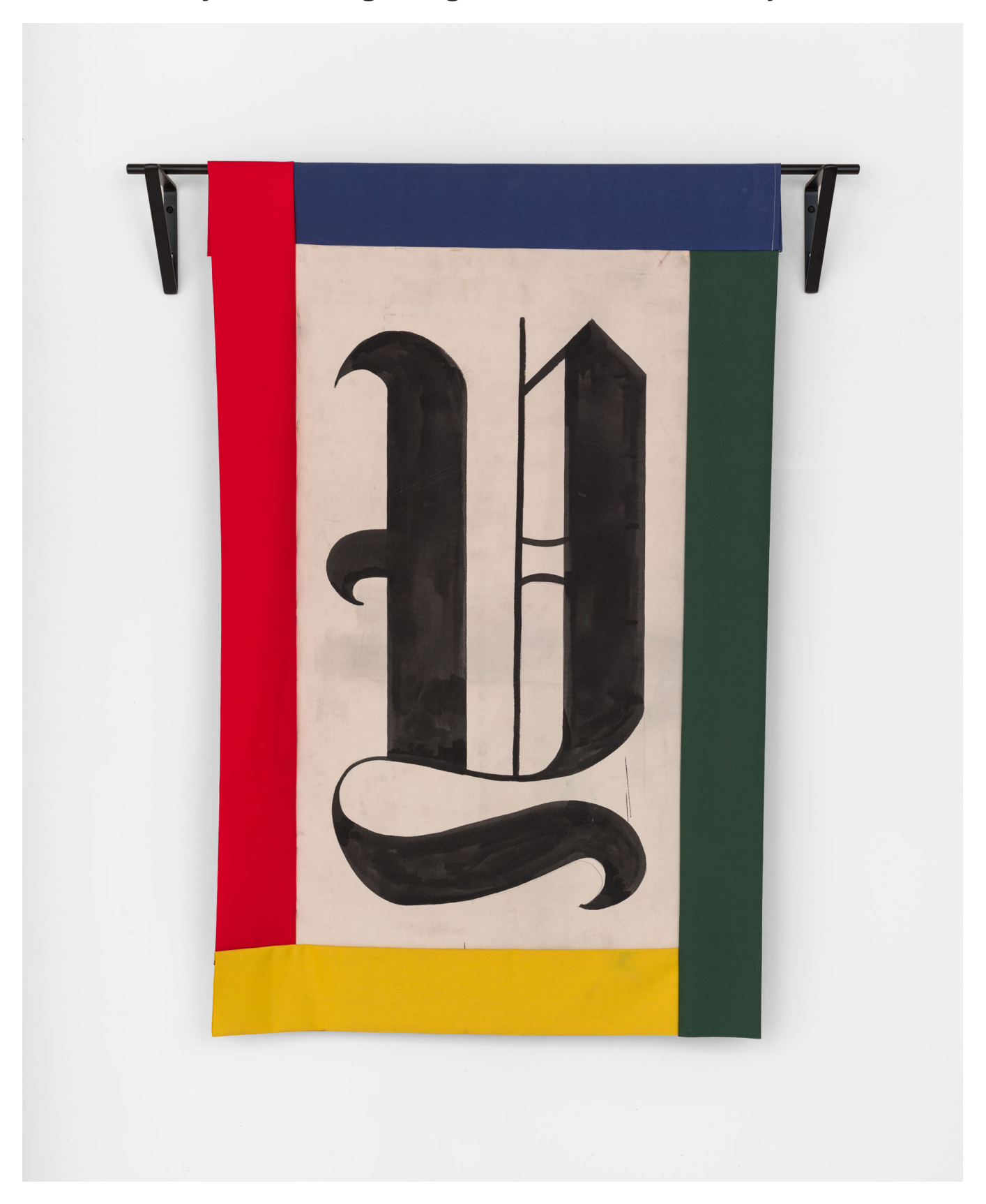
David Shull Y, 2019 Acrylic, ink on canvas, thread 64 x 41 in. | 162.6 x 104.1 cm 64 x 53 1/2 x 8 in. with hardware