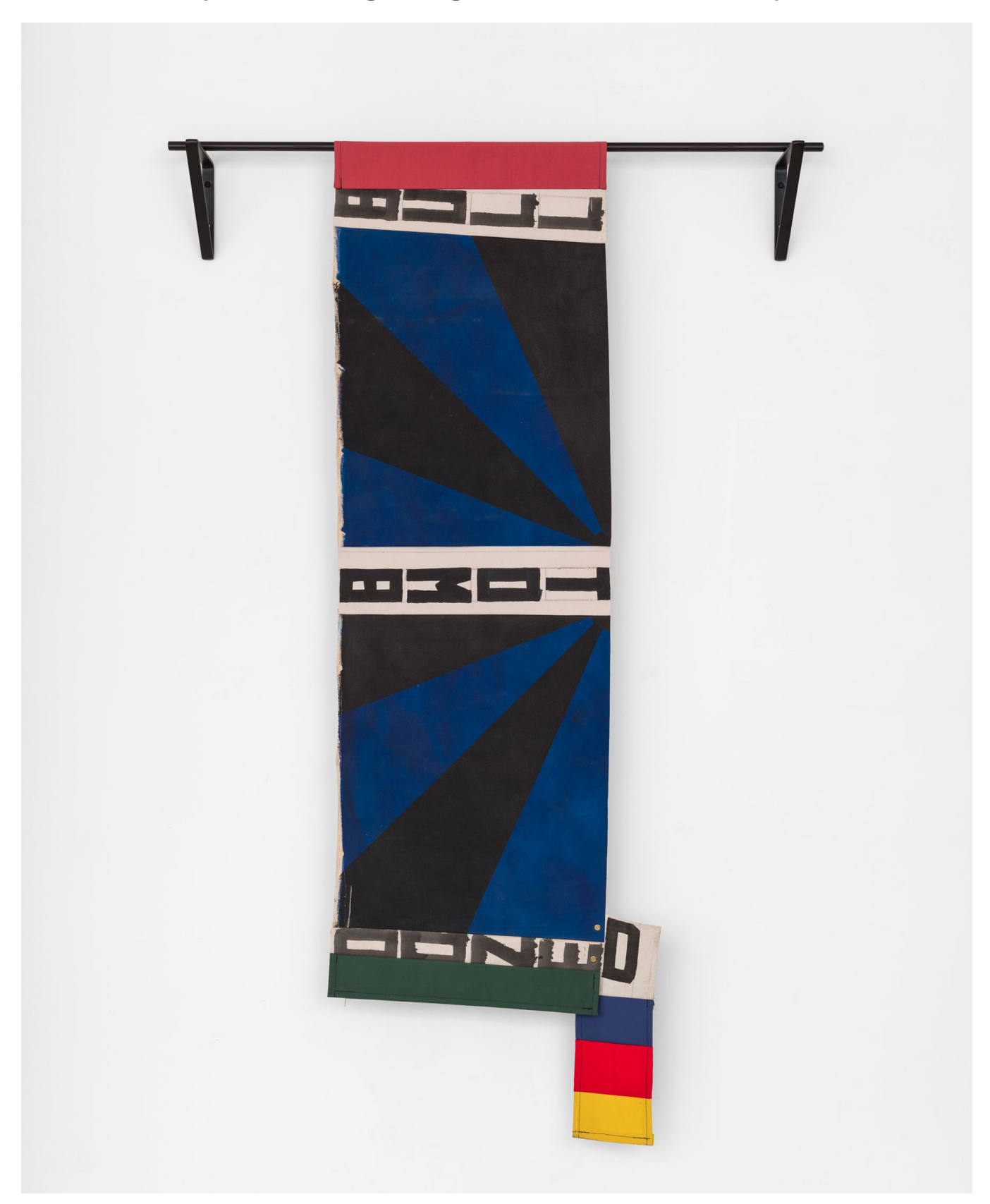
David Shull Bull Dozed Tomb, 2019 Acrylic and ink, on canvas, thread 81 x 28 in. | 205.7 x 71.1 cm 81 x 40 x 8 in. with hardware