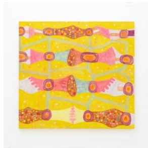
Marc Matchak Untitled (Sugar Man) , 2023 Gouache on canvas, 28 x 30 inches