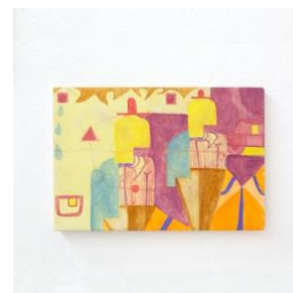
Marc Matchak Thugs , 2023 Gouache on canvas, 11 x 16 inches