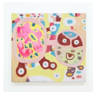
Marc Matchak Untitled (Turtle) , 2023 Gouache on canvas, 28 x 30 inches