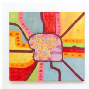
Marc Matchak Untitled (Sun) , 2023 Gouache on canvas, 27.5 x 31.5 inches