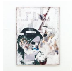
Joe W. Speier Untitled (Self-Portrait/Grinch) , 2023 Acrylic and vinyl on canvas, 24 x 18 inches