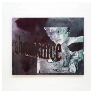
Joe W. Speier Untitled (Self-Portrait/Abundance) , 2023 Acrylic and vinyl on canvas, 16 x 20 inches