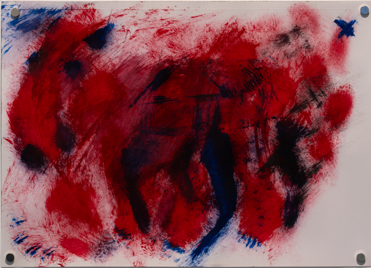
Shai-Lee Horodi House Dog , 2023 acrylic on paper 30 x 42 cm, unique