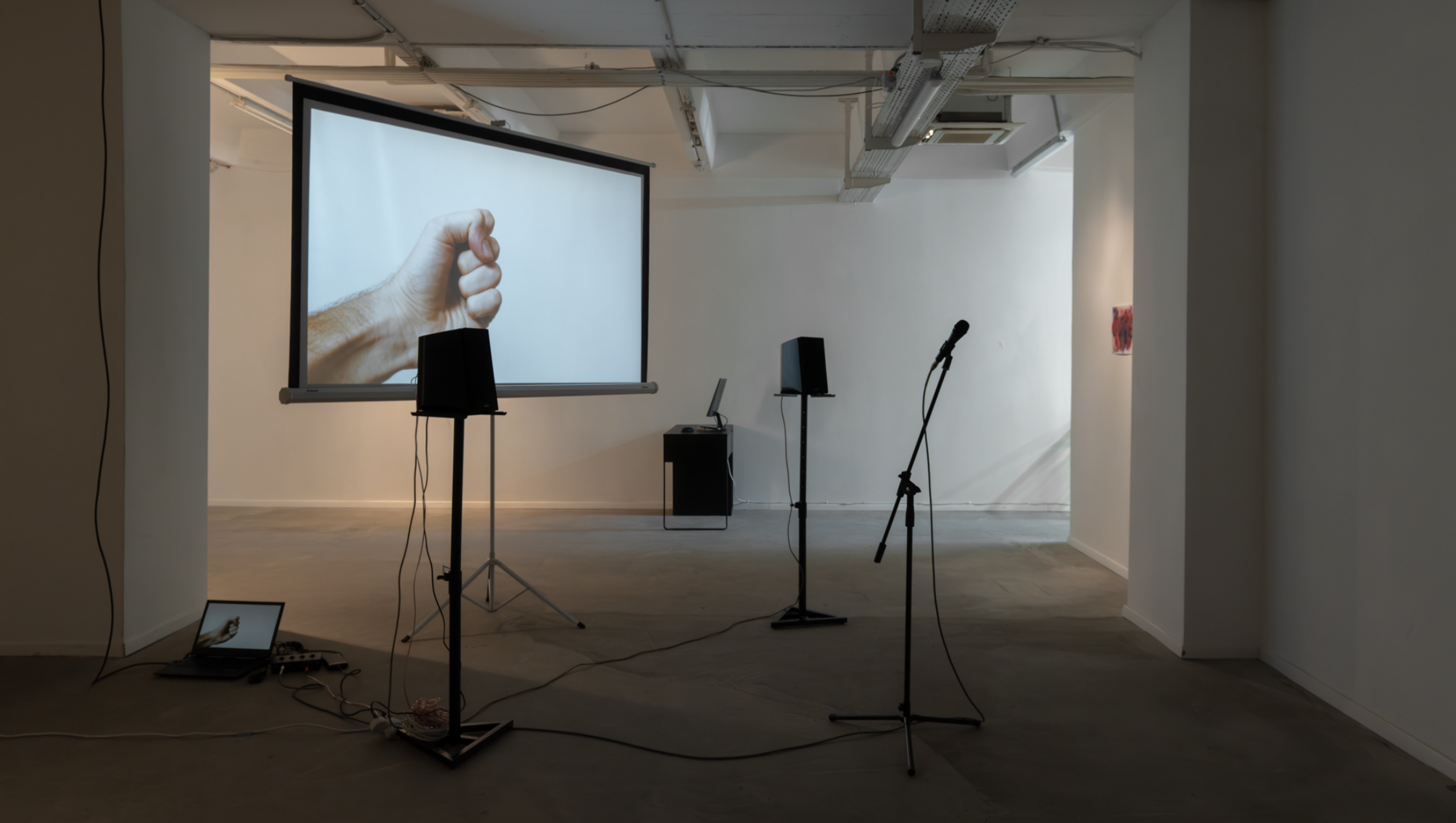
Shai-Lee Horodi Great Hits, 2023 interactive media variable dimensions, 3 + 1 AP