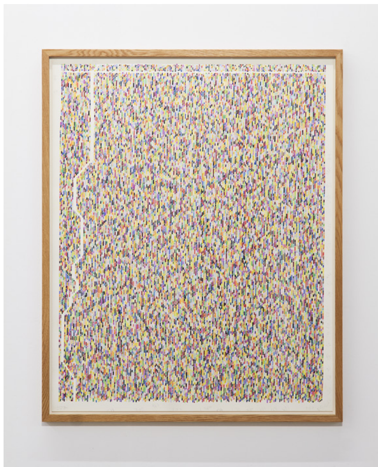
upper right : dots , 2020-2021, screenprint, oil ink, 205 x 157 x 2cm