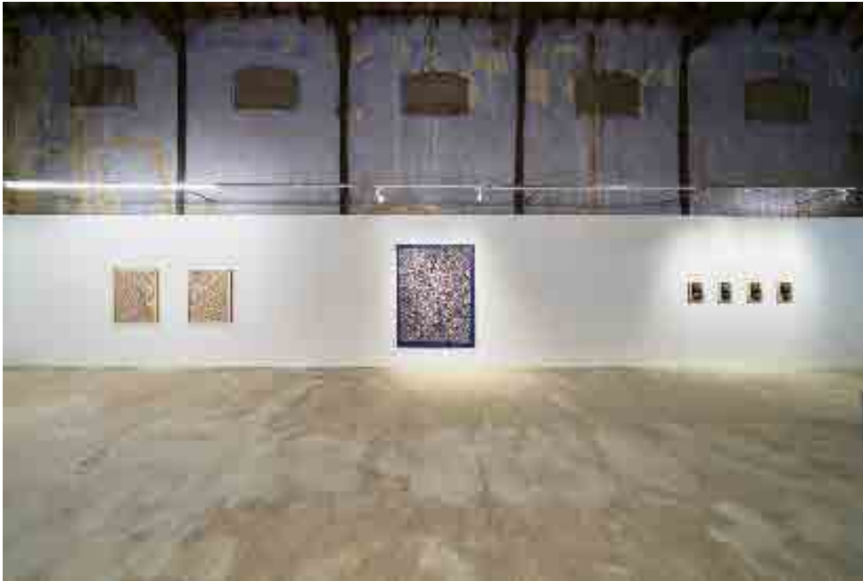
Kochi-Muziris Biennale 2022, installation view