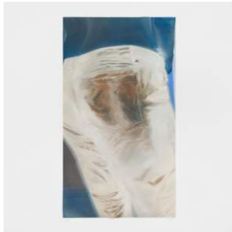
Evelyn Plaschg Pocket (bright), 2023 pigment on paper 35 x 59 inches 88.9 x 149.86 cm EP0001