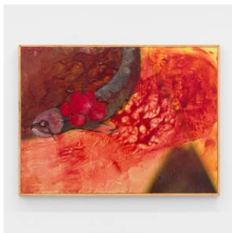
Claudia Lemke The outside can't get inside, 2023 oil on canvas on wood 14.25 x 19 inches 36.2 x 48.26 cm CL0003