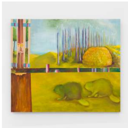
Claudia Lemke Wood for Woods, 2023 oil on canvas on panel 28 x 33 inches 71.12 x 83.82 cm CL0002