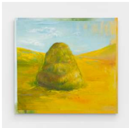
Claudia Lemke Old Haystack, 2023 oil on canvas on wood 27 x 29 inches 68.58 x 73.66 cm CLE0001