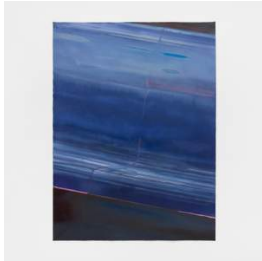
Evelyn Plaschg Seat, 2023 oil on canvas 54 x 40 inches 137.16 x 101.6 cm EP0003