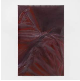
Evelyn Plaschg Zipper, 2023 oil on canvas 59.5 x 39 inches 151.13 x 99.06 cm EP0002