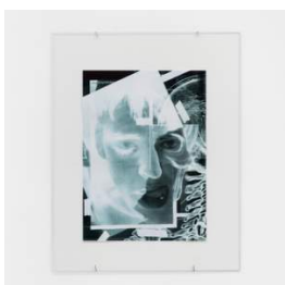
John Neff Untitled, 2004 digital print, glass 10 x 7.25 inches 25.4 x 18.41 cm 14 x 11 inches 35.56 x 27.94 cm JN0003.1