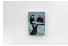
Nika Kutateladze Untitled , 2023 oil on grounded wood 21 x 14.2 cm 8 1/4 x 5 5/8 in (MA-KUTAN-00004)