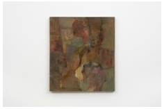
Barbara Wesołowska It will Tarnish , 2023 oil on linen 91 x 80.5 cm 35 3/8 x 31 1/2 in (MA-WESOB-00002)