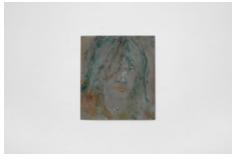
Willa Wasserman Sylvia , 2023 oil on zinc 23 x 20.5 cm 9 x 8 1/8 in (MA-WASSW-00001)