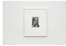
Kazuna Taguchi The Eyes of Eurydice #4 , 2019 gelatin silver print 42.2 x 35 cm 16 5/8 x 13 3/4 in edition of 3 (MA-TAGUK-00001)