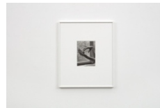
Kazuna Taguchi The Eyes of Eurydice #42 , 2022 gelatin silver print 44.1 x 37 cm 16 5/8 x 13 3/4 in edition of 3 (MA-TAGUK-00003)