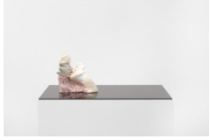
Soshiro Matsubara A Kiss , 2023 glaze on ceramic, mirror 26 x 35 x 77 cm 10 1/4 x 13 3/4 x 30 1/4 in (MA-MATSS-00001)