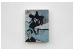
Nika Kutateladze Untitled , 2023 oil on grounded wood 29 x 21 cm 11 3/8 x 8 1/4 in (MA-KUTAN-00002)