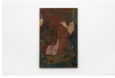
Barbara Wesołowska Vanishing , 2023 oil on linen 110 x 70 cm 43 1/4 x 27 1/2 in (MA-WESOB-00003)