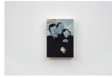
Nika Kutateladze Untitled , 2023 oil on grounded wood 21 x 14.5 cm 8 1/4 x 5 3/4 in (MA-KUTAN-00003)