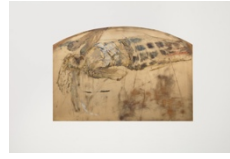
Willa Wasserman VS , 2023 oil on silvered bronze 90.7 x 134.7 cm 35 3/4 x 53 in (MA-WASSW-00002)