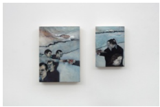
Nika Kutateladze Untitled , 2023 oil on grounded wood Panel 1: 29 x 21 cm, 11 3/8 x 8 1/4 in Panel 2: 21 x 15 cm, 8 1/4 x 5 7/8 in (MA-KUTAN-00001)