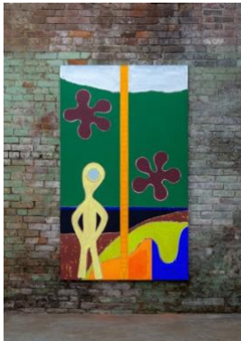
Joshua Abelow Worm Painting (with Alien) , 2023 Oil on linen, 80 x 48 inches