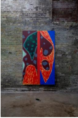
Joshua Abelow Worm Painting , 2022 Oil on linen, 80 x 48 inches