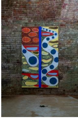
Joshua Abelow Worm Painting , 2022 Oil on linen, 80 x 48 inches