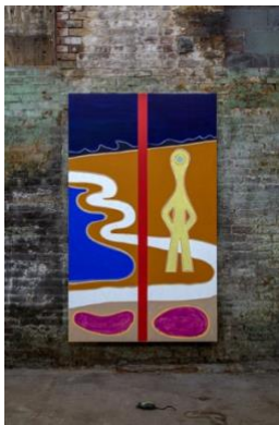
Joshua Abelow Worm Painting (with Alien) , 2023 Oil on linen, 80 x 48 inches