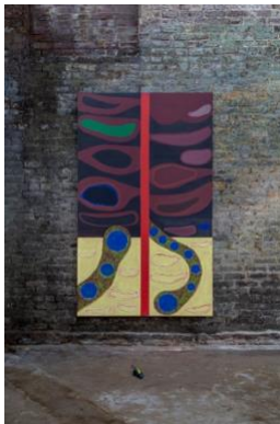
Joshua Abelow Worm Painting , 2022 Oil on linen, 80 x 48 inches