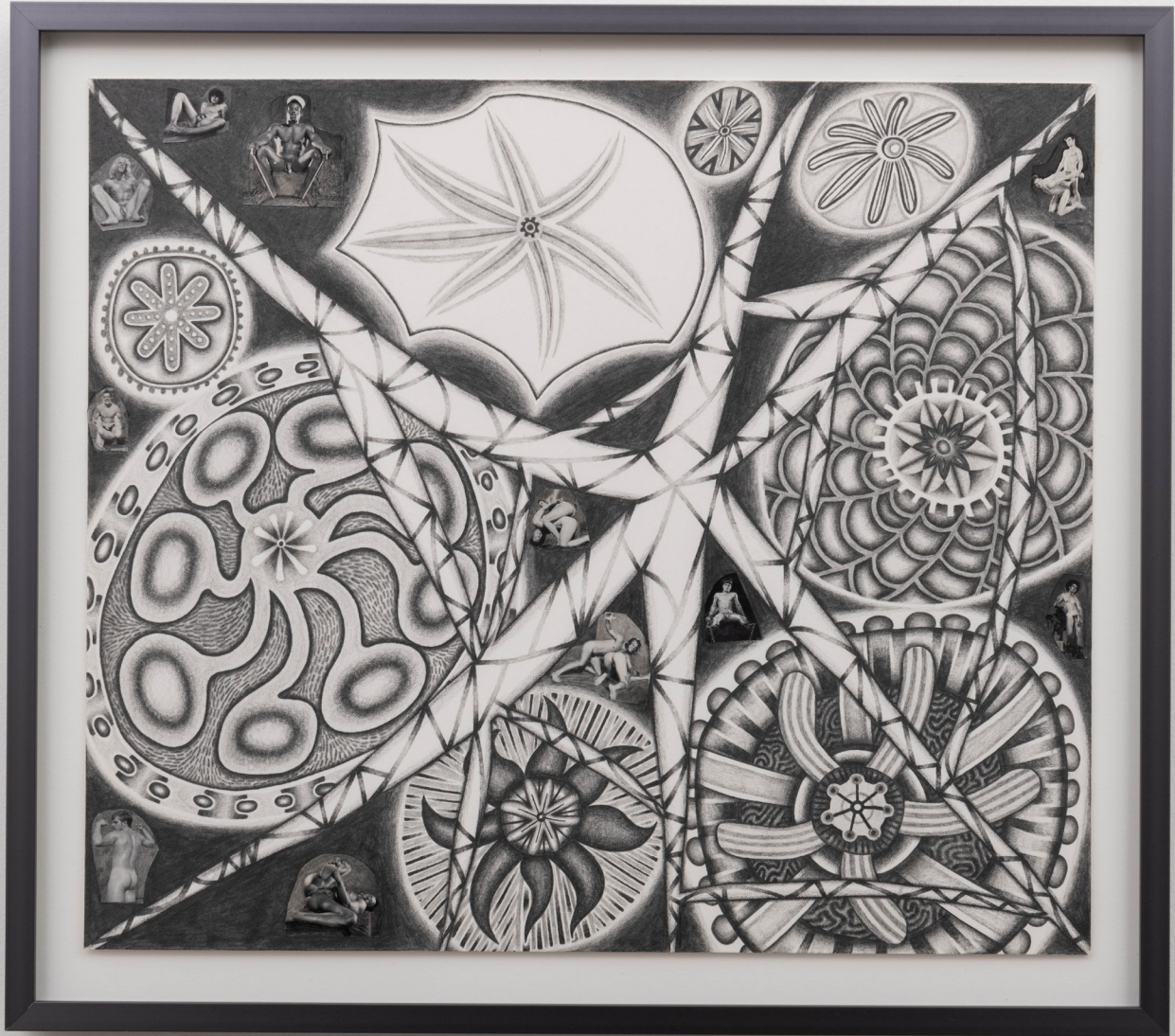
Christian Rogers Untitled Drawing (1) , 2022 Graphite on Paper 15 × 13 In framed