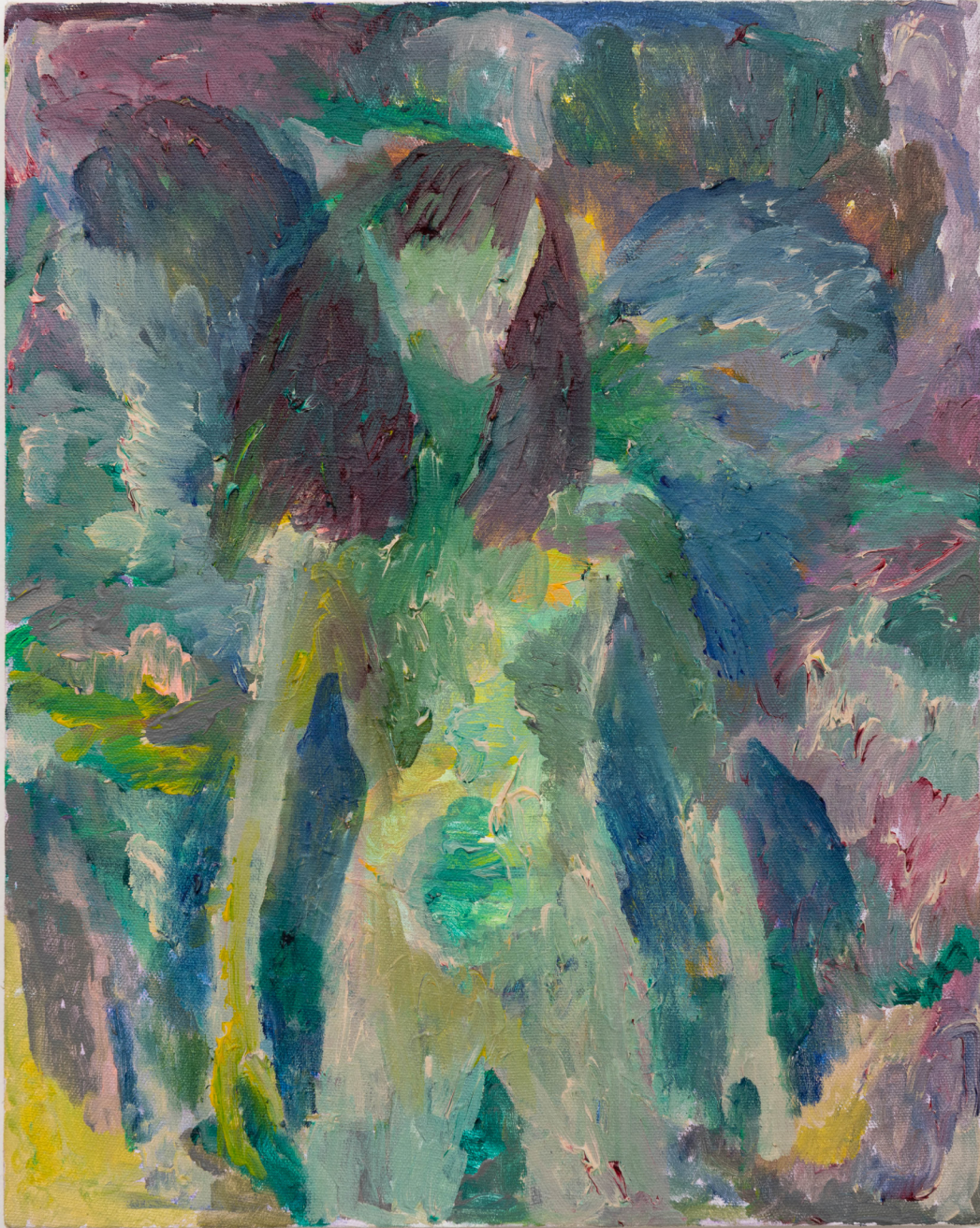
Chase Biado slushy (i follow the flow of my thoughts and feelings), 2017 Acrylic on Canvas 16 × 13 In