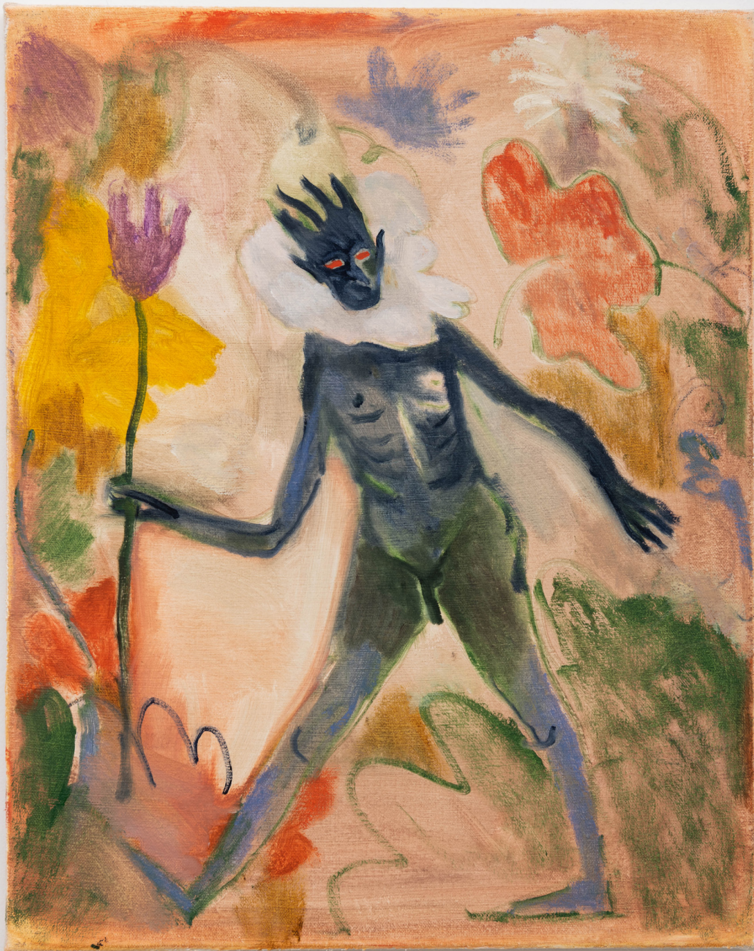
Chase Biado fairy rade trooper , 2021 Oil on Canvas 20 × 16 In