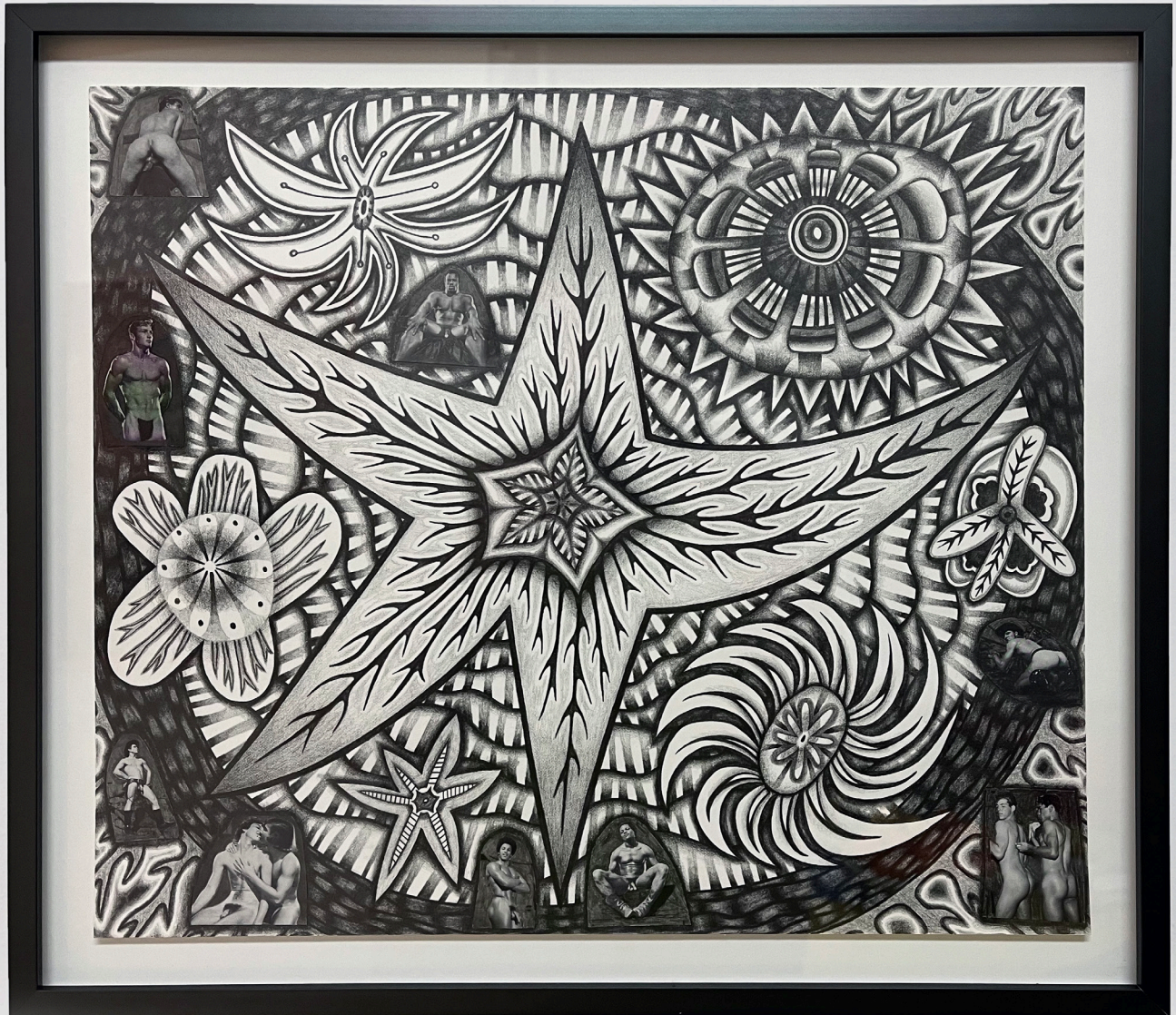
Christian Rogers Untitled Drawing (2) , 2022 Graphite on Paper 15 × 13 In