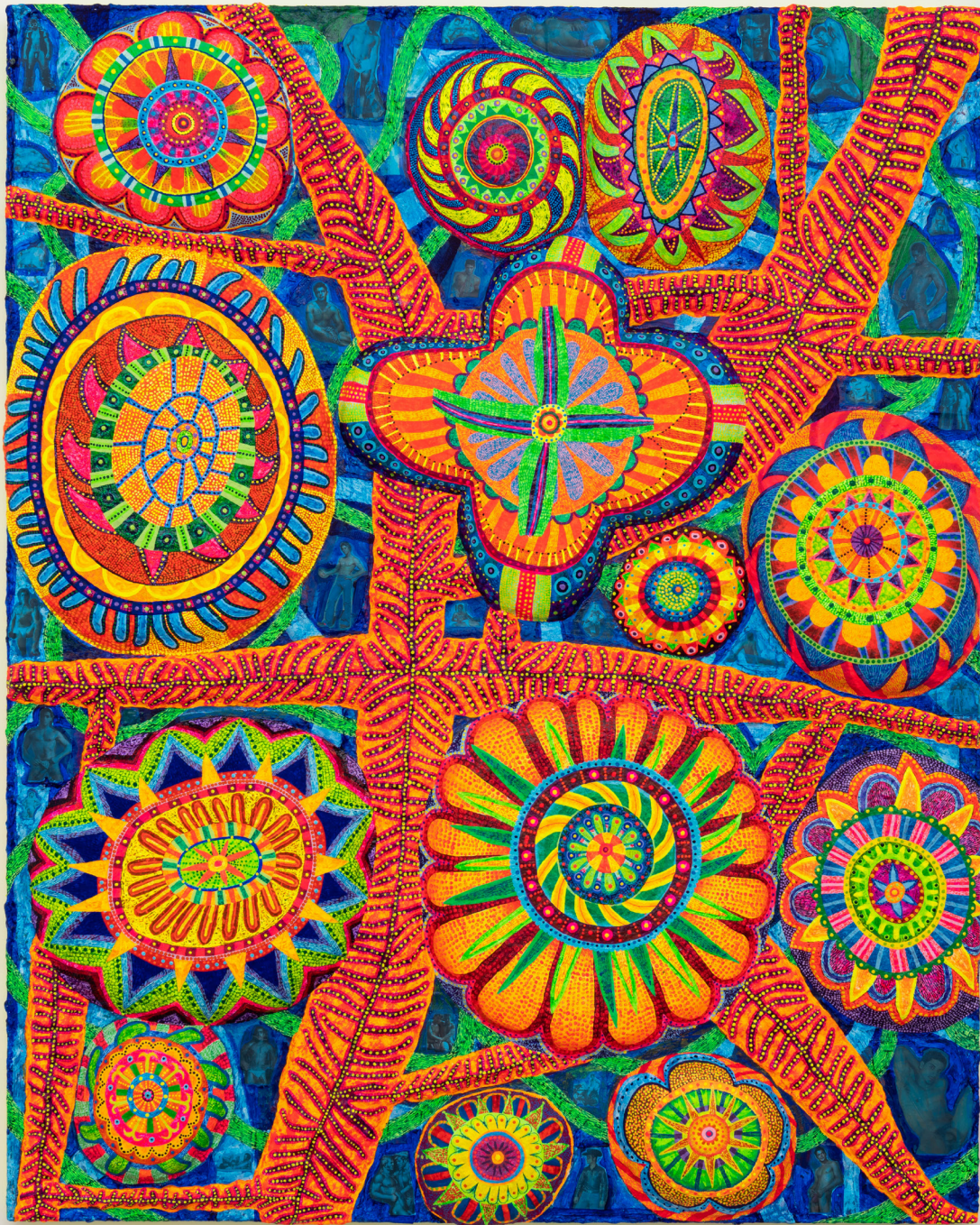
Christian Rogers Lovers Banquet , 2021 Acrylic, Paper Pulp, and Collage on Panel 48 × 60 In