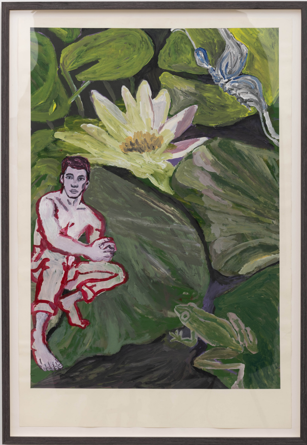
Daniel Long i still wanted to , 2021 Flashe and Acrylic on Paper 28 × 42 In framed