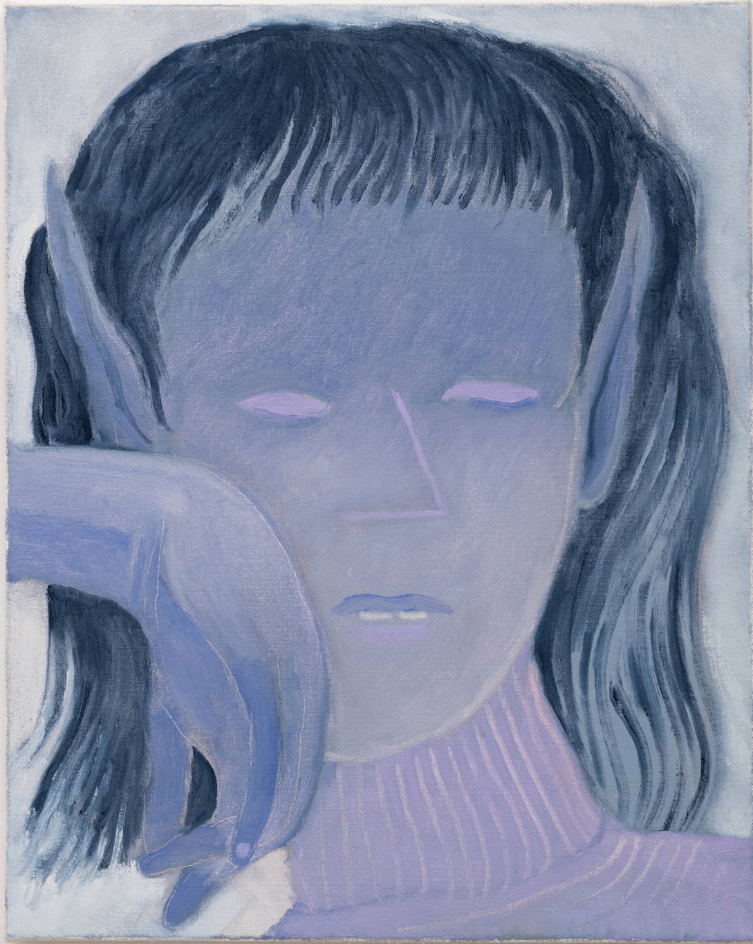
Chase Biado listening to Alanis , 2021 Oil on Canvas 20 × 16 In