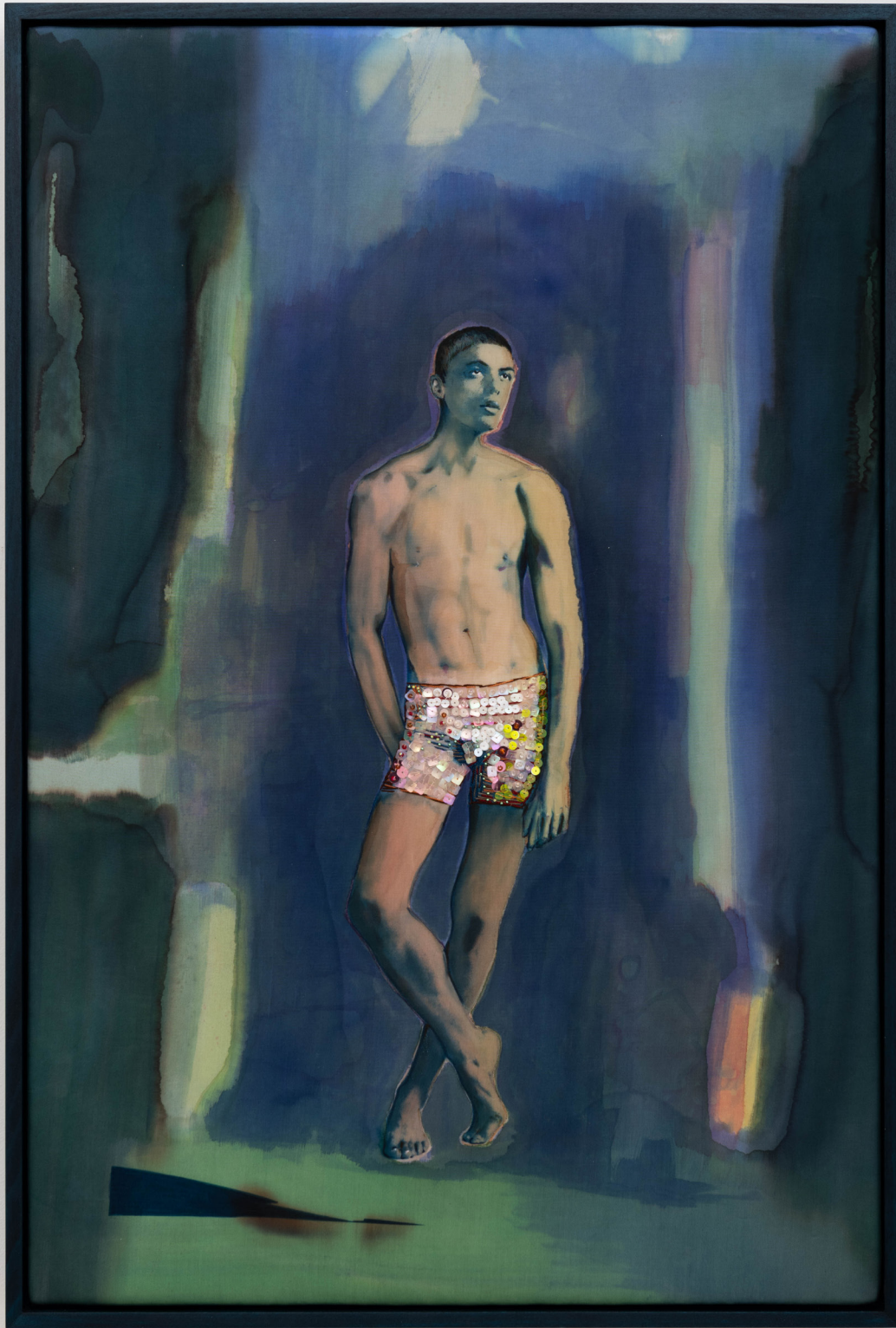
Travis Boyer Blue Milk Portrait (Shorts) , 2022 Cyanotype, Dye, and Embroidery on Silk in Artist Frame 26 ½ x 34 In