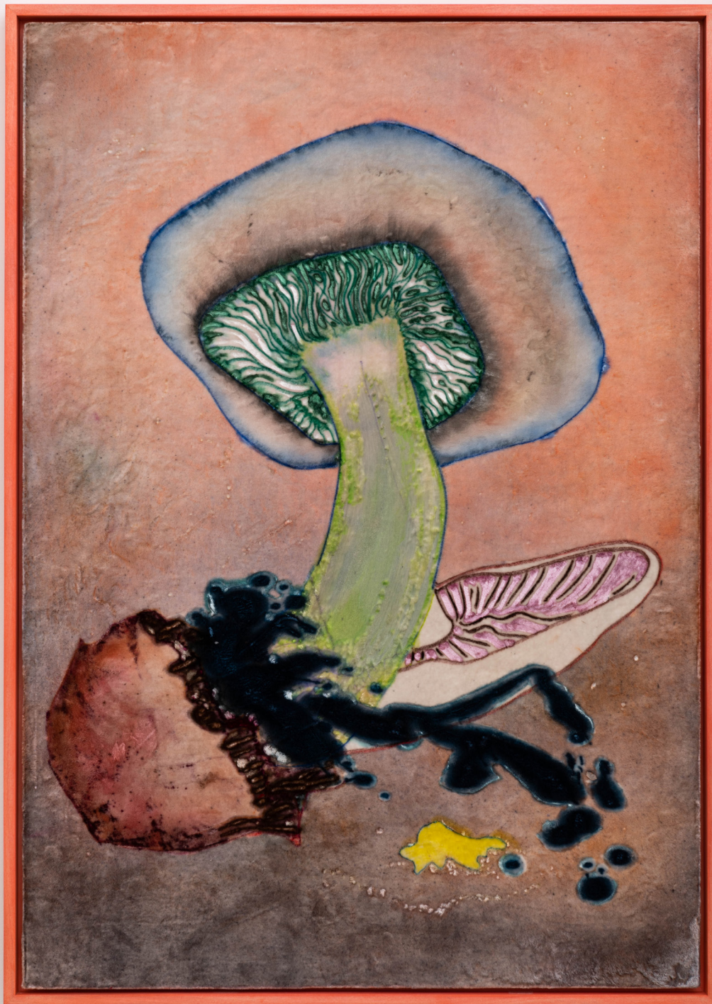
Travis Boyer Take Hold , 2021 Dye on Silk Velvet on Panel in Artist Frame 40 5 / 8 × 28 5 / 8 In