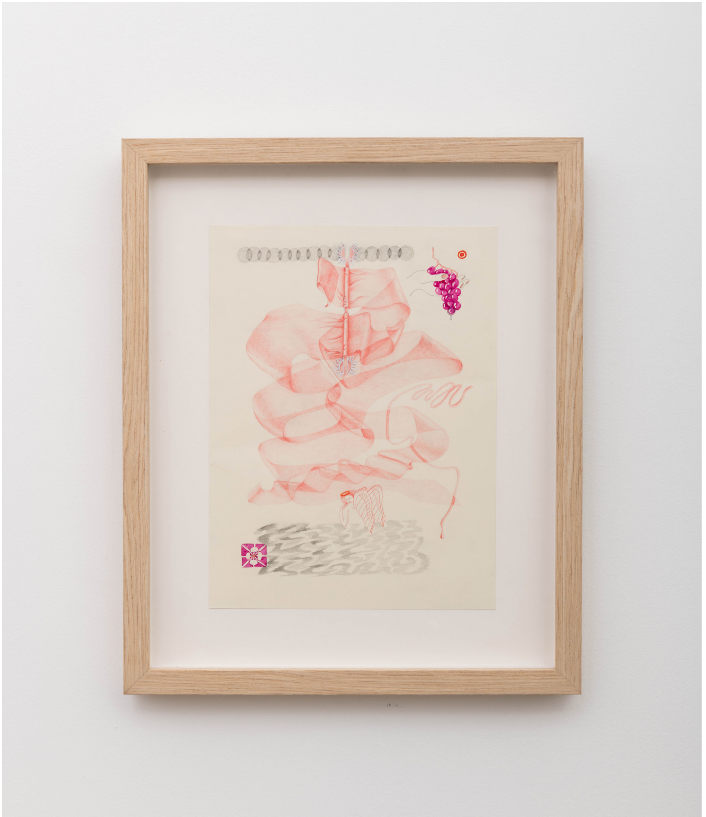
Maren Jensen Ease , 2019 Colored pencil, ink on paper 9 × 12 In framed