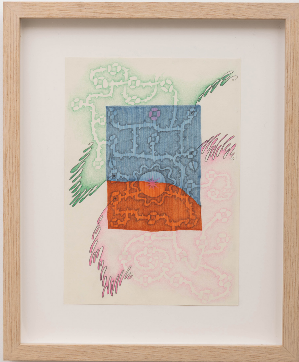
Maren Jensen Untitled (pink and green), 2021 Colored pencil, ink on paper 8.5 × 12 In framed