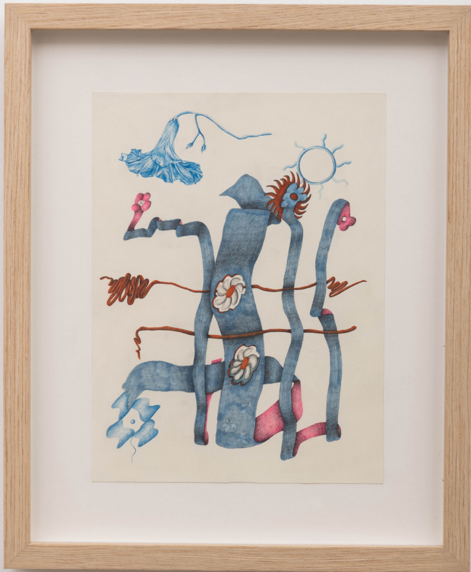
Maren Jensen Blue Morning Glory , 2019 Colored pencil, ink on paper 9 × 12 In framed