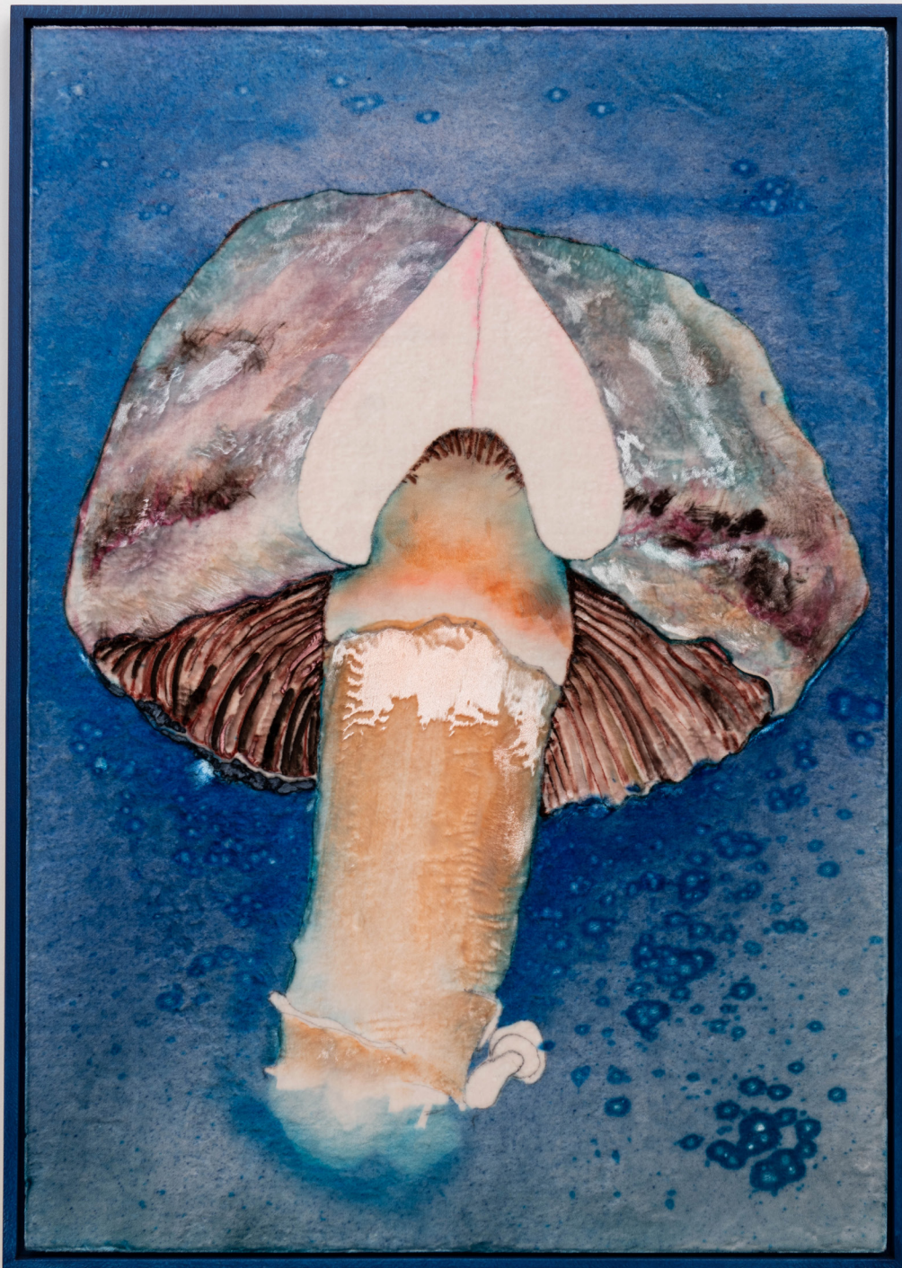
Travis Boyer We Shall By Morning , 2021 Dye on Silk Velvet on Panel in Artist Frame 40 5 / 8 × 28 5 / 8 In