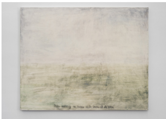
Nino Kapanadze Untitled (sea), 2021 oil on cotton 162 × 130 cm

დღღი [Doghi] Nino Kapanadze Solo exhibition 15.07.2023 – 03.09.2023