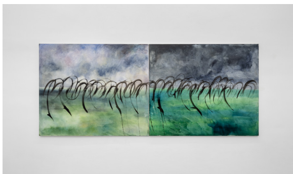
Nino Kapanadze დღღი III, 2023 Oil and natural pigments on cotton 153 × 366 cm