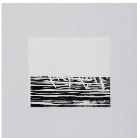
Nino Kapanadze Untitled, 2021 Linogravure print each: 13 × 11 cm