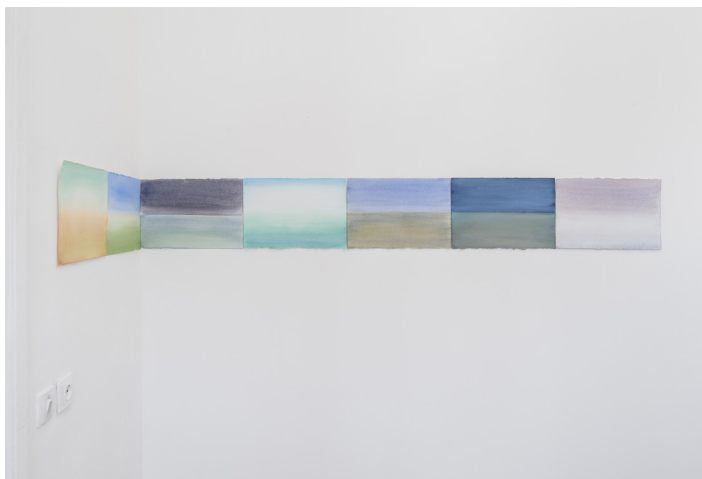
Nino Kapanadze Untitled, 2022 Japanese gansai watercolor on paper 29 × 266 cm