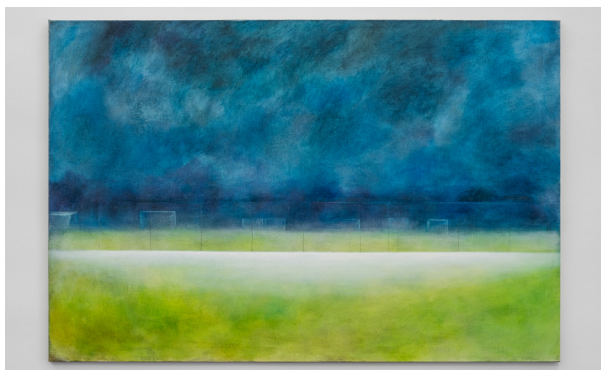
Nino Kapanadze Untitled (stadium), 2023 oil on linen 130 × 195 cm