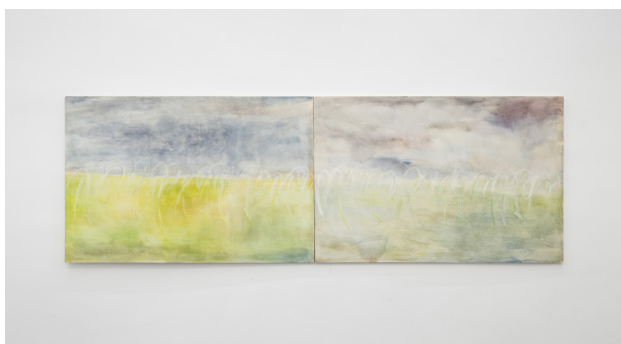
Nino Kapanadze დღღი II (traces), 2022 Oil on cotton 130 × 390 cm