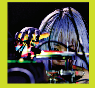
Evicshen June 15, 8 PM