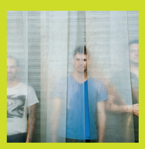
Sontag Shogun September 28, 8 PM