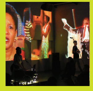
SCRAAATCH August 3, 8 PM