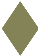
1 Diamond Green, 2020 Hand-cut, 1-color lithographs with thermochemical ink on BFK Rives paper 116 x 76 cm Ed. of 45