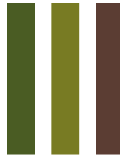
1 Ronettes III, 2022 Color shifting paint on aluminum honey comb panel 183 x 108 cm