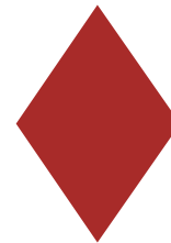
1 Diamond Red, 2020 Hand-cut, 1-color lithographs with thermochemical ink on BFK Rives paper 116 x 76 cm Ed. of 45