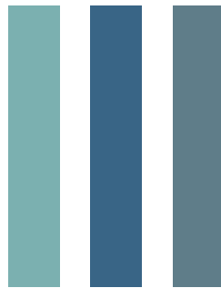
1 Ronettes II, 2022 Color shifting paint on aluminum honey comb panel 183 x 108 cm