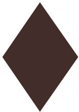
1 Diamond Brown, 2020 Hand-cut, 1-color lithographs with thermochemical ink on BFK Rives paper 116 x 76 cm Ed. of 45