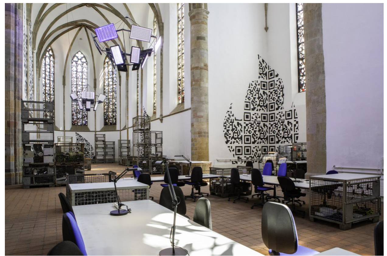
Aram Bartholl, "Package ready for pickup", installation view Kunsthalle Osnabrück, 2023. Courtesy Aram Bartholl and Kunsthalle Osnabrück. Photo: Lucie Marsmann