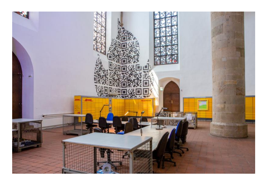
Aram Bartholl, "Package ready for pickup", installation view Kunsthalle Osnabrück, 2023. Courtesy Aram Bartholl and Kunsthalle Osnabrück. Photo: Lucie Marsmann

Berlin, Emmanuel Art Gallery, Denver (all 2019), Palais de Tokyo, Paris (2015) or Kasseler Kunstverein (2013). Extensive works and new productions by him were also represented at the Werkleitz Festival "Model and Ruin", the San Francisco Museum of Modern Art (both 2019), the Biennale d'art contemporain de Strasbourg, the Thailand Biennale, the Seoul Museum of Art (all 2018) as well as at Skulptur Projekte Münster and the Hyperpavillion at the Venice Biennale (both 2017).