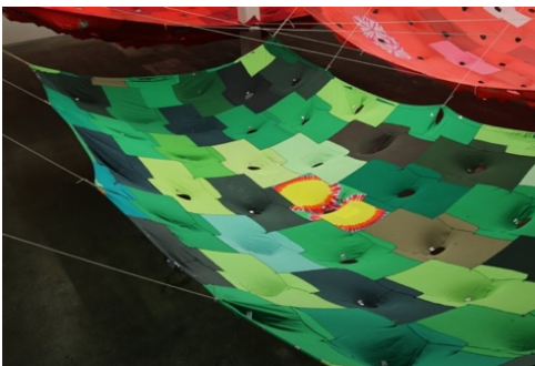
Pia Camil Bara Bara Bara (Divisor Pirata Verde) 2017

Polyurethane resin, raw Virginia cotton, dye sublimation t-shirts, altered t-shirts, confetti t-shirts, housedress, epoxy resin, carbon fiber, altered housedresses, durags, work gloves, shoelaces 74 × 250 3/4 × 2 in (188 × 636.9 × 5.1 cm)