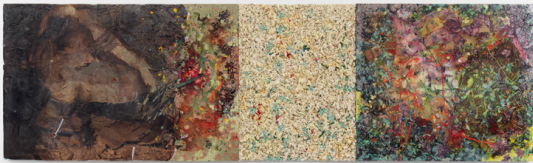
Kevin Beasley Cottonwood (From the Grove) 2022

A soft place to land July 7, 2023–January 7, 2024