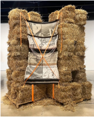
Cass Davis Binding the Devil 2023 Hay, hand-woven jacquard textile, orange strapping 120 x 96 x 60 in (304.8 x 243.84 x 152.4 cm)