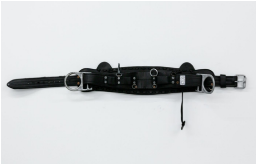
Tiona Nekkia McClodden A.B. 2_BLANK 2019 Leather lineman harness, steel, leather dye, Saphir shoe polish, spit 6 x 45 x 7 inches (15.24 x 114.3 x 17.78 cm)