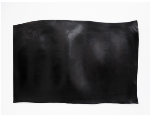
Tiona Nekkia McClodden SOUL BENDER 2019 Leather sole hide, leather dye, Angelus shoe polish, Saphir shoe polish 31 x 46 x 1 in (78.74 x 116.84 x 2.54 cm)