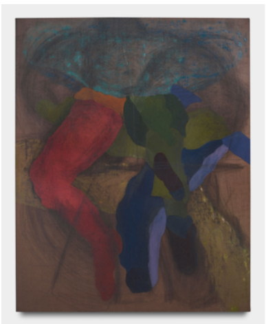
Kaveri Raina Lack Of; Lack Thereof; Continuous Search of Doom 2021 Acrylic, graphite, oil pastel, burlap 60 x 48 in (152.4 x 121.9 cm)