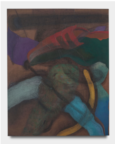
Kaveri Raina Unforeseen Rigor; To Cease 2021 Acrylic, graphite, oil pastel, burlap 60 x 48 in (152.4 x 121.9 cm)