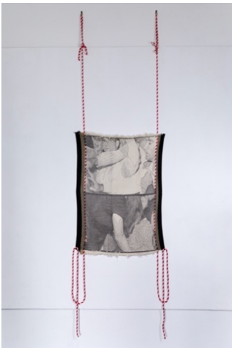
Cass Davis Laying of Hands 2022 Hand-woven jacquard wool textile, emergency rope line 185 x 32 in (469.9 x 81.28 cm)