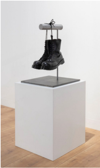
Tiona Nekkia McClodden TNM_ [CLUB - 2018] 2021 Polished leather boots on metal stand 21.25 x 16 x 16 in (53.98 x 40.64 x 40.64 cm)