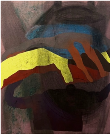
Kaveri Raina Magnetic Fields 2023 Acrylic, graphite, oil pastel, burlap 60 x 48 in (152.4 x 121.9 cm)