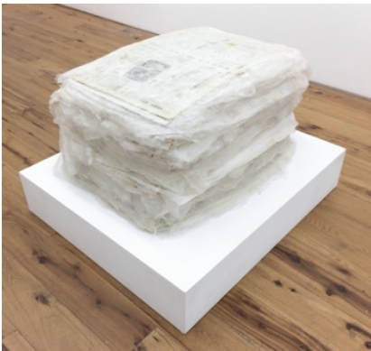
Liang Shaoji Nature Series No. 103 2008 Newspapers, silk 34 x 29.5 x 43.3 in (86.36 x 74.93 x 109.98 cm)