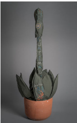
Margarita Cabrera Space In Between-Agave (Manuel S. G.) 2016 Border Patrol uniform fabric, copper wire, PVC pipe, foam, thread, terra cotta pot 64.5 x 22 x 18 in (163.83 x 55.88 x 45.72 cm)