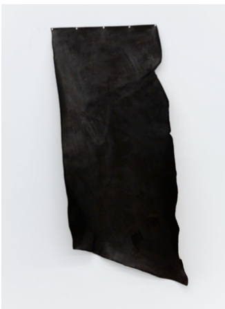
Tiona Nekkia McClodden NOTIONS OF AN EQUATION IMPLIES A SOLUTION 2019 Leather hide, leather dye, Kiwi shoe polish, Diamond shoe polish 44 x 22 x 6 in (111.76 x 55.88 x 15.24 cm)