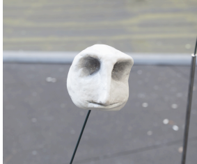
Claude Eigan, Maren Karlson Owls, 2019 Clay, acrylic paint, varnish, wire, steel Dimensions variable