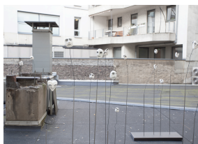
Claude Eigan, Maren Karlson Owls, 2019 Clay, acrylic paint, varnish, wire, steel Dimensions variable