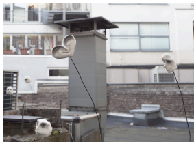
Claude Eigan, Maren Karlson Owls, 2019 Clay, acrylic paint, varnish, wire, steel Dimensions variable