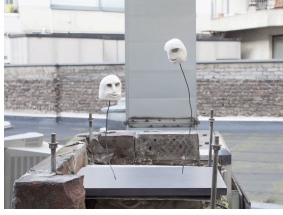
Claude Eigan, Maren Karlson Owls, 2019 Clay, acrylic paint, varnish, wire, steel Dimensions variable