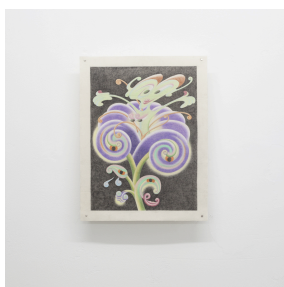
Maren Karlson Let's see if I can be born again, 2018 pencil on canvas 49 x 37,5 cm