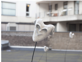
Claude Eigan, Maren Karlson Owls, 2019 Clay, acrylic paint, varnish, wire, steel Dimensions variable