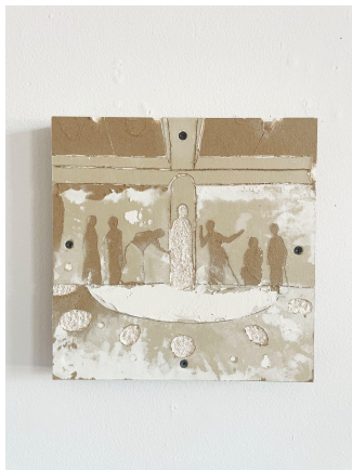
Down the Path, 2023 Primer, Joint Compound, Drywall Anchors, Metal Studs, Drywall 10x10 po