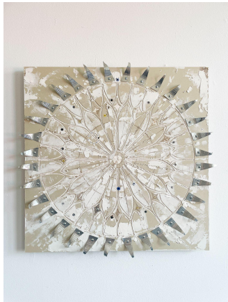
Rose, 2023 Primer, Joint Compound, Drywall Anchors, Metal Studs, Drywall 24x24 in