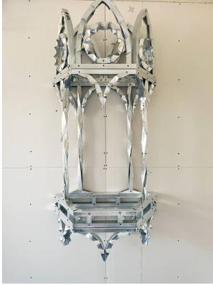
Bay Window, 2023 Metal Studs 36x60x16 in