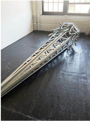
Spike, 2023 Metal Studs 32x32x120 in