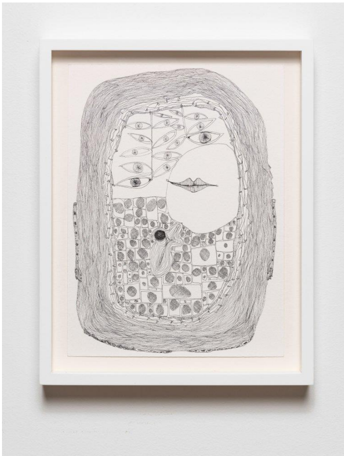
Rae Davis Forty winks , 2022 ink on paper