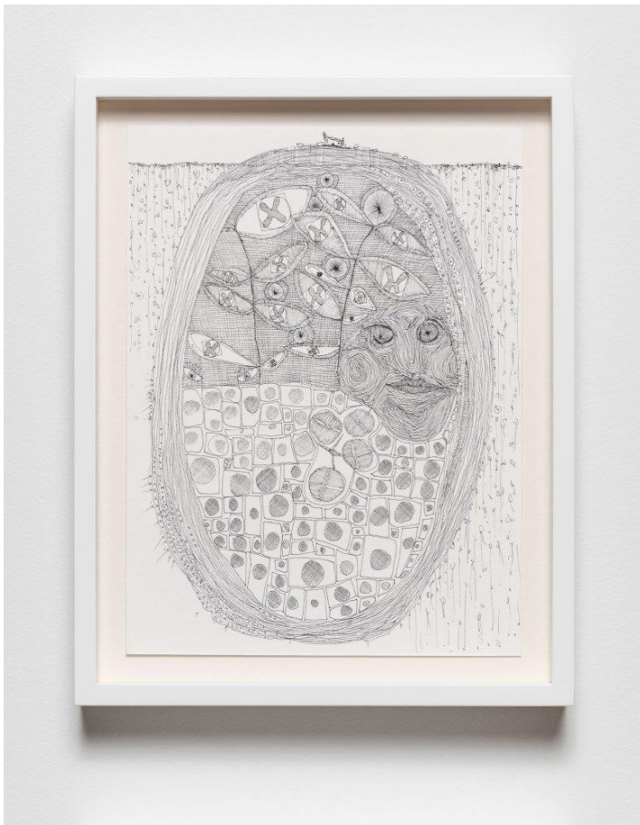
Rae Davis More than meets the eye, 2022 ink on paper