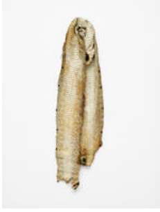
Anna Virnich Untitled, 2023 Snake skin, cultured pearls, glass beads, stone 65 × 18 × 3,5 cm

Jülicher Strasse 14, D-50674 Cologne +49 221 95814522, gallery@drei.cologne