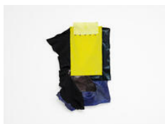
Anna Virnich Flimmerblitze , 2023 Chlorinated satin, leather, satin, cotton embossed, cultured pearls, silver thread fabric, yarn 54 × 38 cm