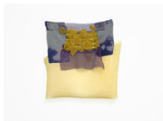
Anna Virnich Gauge Your Fears , 2023 Latex, lace, satin chlorinated, polyester, cotton, yarn 39 × 40 cm