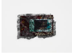
Anna Virnich Onkel Man and Me, Watching TV and Dancing (La Isla Bonita, Madonna 1987/Westberlin) , 2023 Mantilla veil, photography, brocade fabric, yarn 19,5 × 29,5 cm