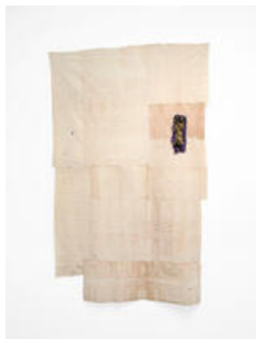
Anna Virnich Portal , 2023 Dyed and folded sieve nettle, delphinium flowers, printed polyester, synthetic fabric, yarn 188 × 114 cm