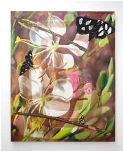
Delaney Lee Crawling Close To The Bottom , 2023 Oil paint on canvas 48 x 60 inches