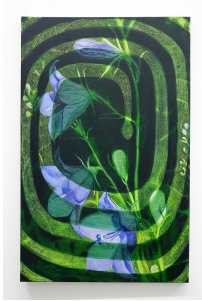
Delaney Lee Deep Spring , 2022 Oil paint and oil pastel on canvas 26.5 x 41.5 inches