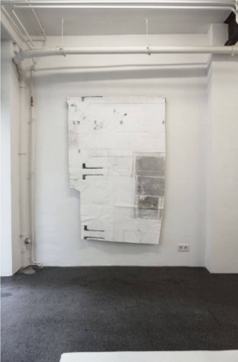
X Breidenbach Metabolic painting 3 handmade recyclingpaper, collected wax, chalk, coal, pigment, found fabrics 300x135 cm, 2023