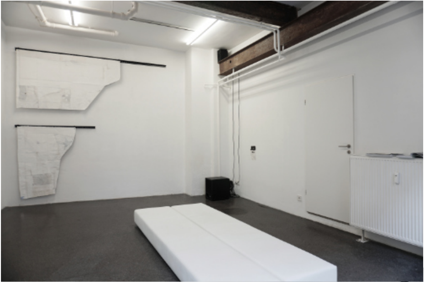
X Breidenbach Metabolic painting 2 handmade recyclingpaper, collected wax, chalk, coal, pigment, found fabrics 100x138cm, 2023