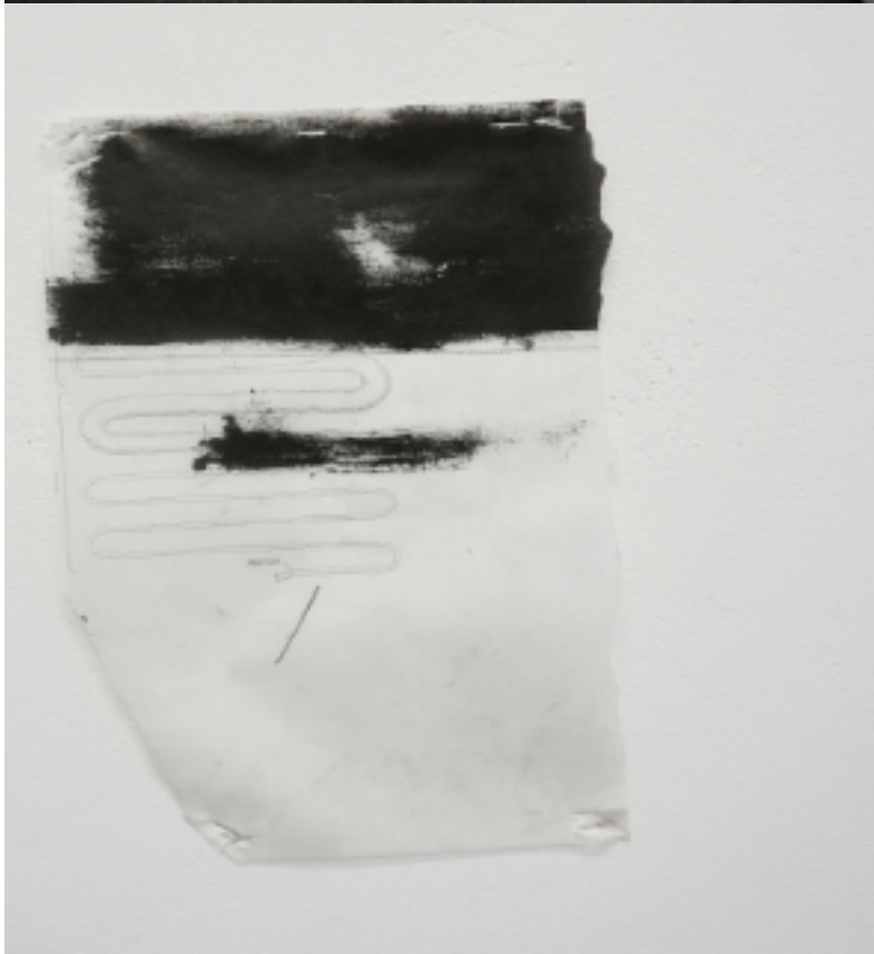
X Breidenbach o.T. (Rectum) b/w print, found paper, collected wax 18,5x28,5cm, 2023