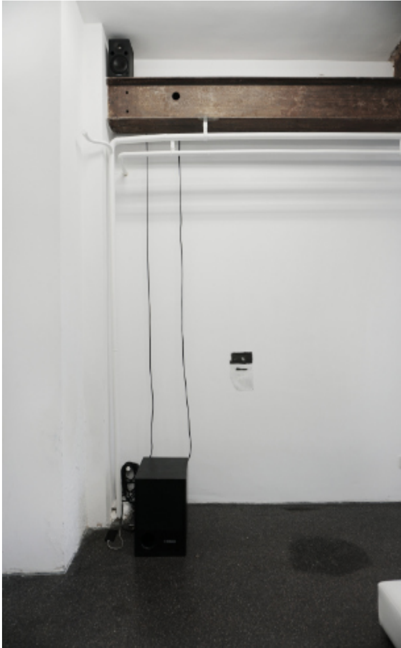
Christian Doeller O.T. (B_ER_MX802A_A1-C1_A2-DR-ME) 30 min. No Input Mix, 2023