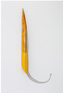
Jim Roche Reno , 2023 poplar, steel,, synthetic polymer, ink, resin 135 × 57.5 × 15 cm #RRJR2023059

JIM ROCHE | Van Der Zande 31 August—30 September, 2023