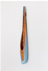
Jim Roche Van Der Zande , 2023 poplar, synthetic polymer, ink and resin 145 × 18 × 16 cm #RRJR2023060