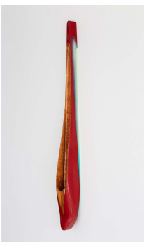
Jim Roche Marja , 2023 poplar, synthetic polymer, ink and resin 166 × 17 × 15 cm #RRJR2023062