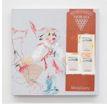
Isadora Vogt Restaurant Morava , 2023 Direct print, paper cutout, acrylic, marker, oil chalk on linen 25.6 x 25.6 in (65 x 65 cm) IV005