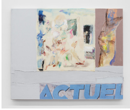
Isadora Vogt ACTUEL , 2023 Direct print, oil chalk, color pencil, marker, and acrylic on patchwork canvas 35.43 x 43.3 in (90 x 110 cm) IV002