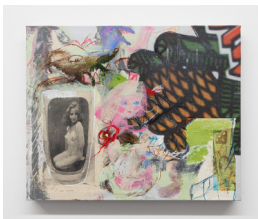
Isadora Vogt Forbidden Cuteness , 2022 Direct print, paper cutouts, acrylic, marker, oil chalk on linen 17.7 x 21.7 in (45 x 55 cm) IV008