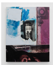
Isadora Vogt Don't forget to call your Mother , 2023 Direct print, paper cutout, acrylic on patchwork linen 37.4 x 29.5 in (95 x 75 cm) IV006