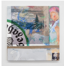
Isadora Vogt Bezahlt , 2023 Direct print, oil chalk, acrylic on patchwork linen 39.37 x 37.4 in (100 x 95 cm) IV003