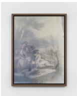
centaur , 2023