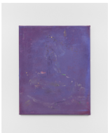
bruidspaar I (wedding couple I), 2023 oil on linen with gold leaf 50 x 40 cm - 19 3/4 x 15 3/4 in (MP-SCHOM-00239)