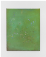
hyacinth , 2023 oil on linen with gold leaf 50 x 40 cm - 19 3/4 x 15 3/4 in (MP-SCHOM-00240)