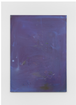
bruidspaar II (wedding couple II) , 2023