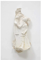
the wedding figures 2, 2023 plaster and pigments 21 x 9 x 5.5 cm - 8 1/4 x 3 1/2 x 2 1/8 in (MP-SCHOM-00248)