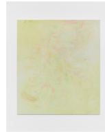
zelfportret met Adriaan (self portrait with Adriaan) , 2023 oil on linen 140 x 60 cm - 55 1/8 x 23 5/8 in (MP-SCHOM-00245)