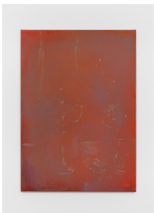
candlelight , 2023 oil on linen with powder pigment, paper, gold and copper leaf 69.5 x 49.5 cm - 27 3/8 x 19 1/2 in (MP-SCHOM-00251)