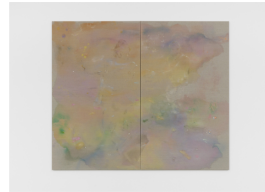
dancing couple, 2023 oil on linen with powder pigment in two parts 1: 150 x 90 cm - 59 x 35 3/8 in 2: 150 x 90 cm - 59 x 35 3/8 in (MP-SCHOM-00254)