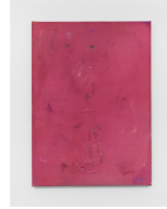
vase , 2023 oil on linen with appliqué 55 x 40 cm - 21 5/8 in x 15 3/4 in (MP-SCHOM-00246)