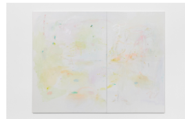
dancing diptych , 2023 oil on linen with pigments, air brush and appliqué, in two parts: 1: 212 x 140 cm - 83 1/2 x 55 1/8 in 2: 212 x 110 cm - 83 1/2 x 43 1/4 in (MP-SCHOM-00250)