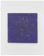
meditation , 2023 oil on linen 24 x 24 cm - 9 1/2 x 9 1/2 in (MP-SCHOM-00244)