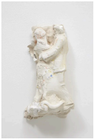
the wedding figures 1, 2023 plaster and pigments 18 x 9.5 x 5.5 cm - 7 1/8 x 3 3/4 x 2 1/8 in (MP-SCHOM-00247)