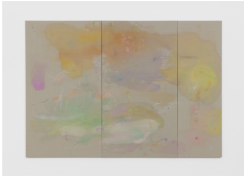
viering (celebration) , 2023