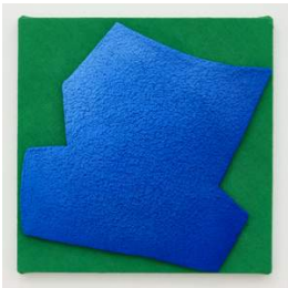
11. Kim Fisher Majorelle Blue , 2023 Oil on matrix dryve on dyed linen covered panel 14 x 14 inches