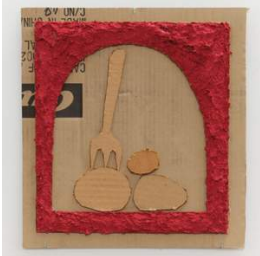
7. Florian Morlat Untitled , 2021 Celluclay and flashe on cardboard 12 x 14 inches