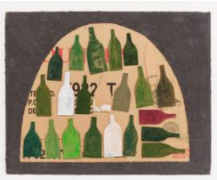
29. Florian Morlat Troglydtes , 2021 Celluclay and flashe on cardboard 45 x 36 inches