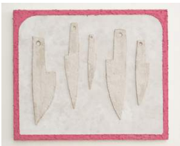
19. Florian Morlat Knife Games , 2023 Celluclay, flashe and cardboard on linen 30 x 25 inches