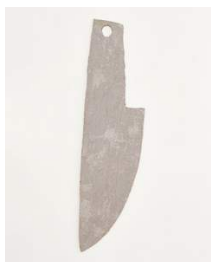
22. Florian Morlat Untitled , 2023 Celluclay and flashe on cardboard 35 x 12 inches