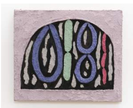
17. Florian Morlat Early in the Morning , 2023 Celluclay, flashe and cardboard on linen 19 x 16 inches