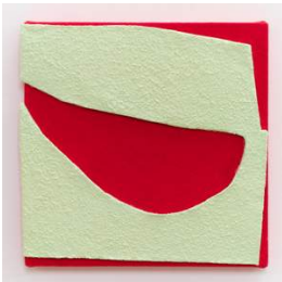
28. Kim Fisher Young Creature , 2023 Oil, masonry stucco on dyed linen 14 x 14 inches