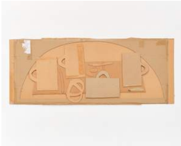
32. Florian Morlat Beer Yoga , 2020 Cardboard 60 x 24 inches