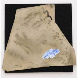
18. Kim Fisher Dune , 2023 Oil on matrix dryve on dyed linen 31 x 34 inches