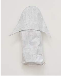
12. Florian Morlat Untitled , 2022 Celluclay, cardboard, paper and flashe 20 x 26 x 6 inches