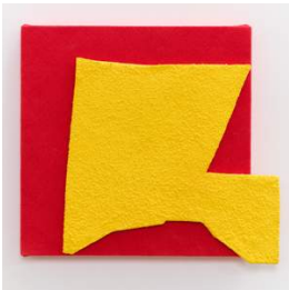
8. Kim Fisher Small Treehouse , 2023 Oil on masonry stucco on dyed linen covered panel 14 x 15 inches