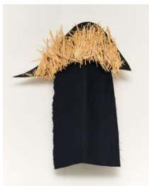
5. Florian Morlat Untitled , 2013 cardboard, straw and fabric 24 x 32 x 6 inches