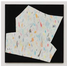
3. Kim Fisher Composite , 2023 Oil on masonry stucco on dyed linen on panel 31 x 31 inches