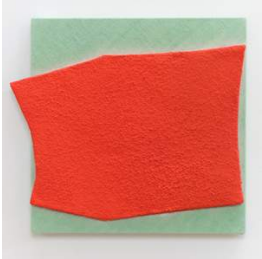
13. Kim Fisher Cocktail , 2023 Oil, masonry stucco on dyed linen 15.5 x 14 inches