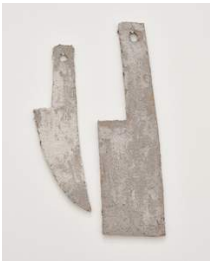
15. Florian Morlat Untitled , 2023 Celluclay and flashe on cardboard 10 x 17 inches