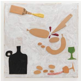
23. Florian Morlat Same Thing, Again , 2023 Celluclay and flashe on cardboard 35.5 x 26 inches