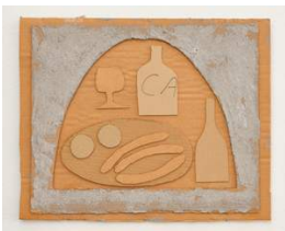
21. Florian Morlat CA , 2021 Celluclay on cardboard 24 x 20 inches