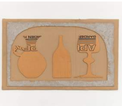
27. Florian Morlat Untitled , 2021 Celluclay and flashe on cardboard 36.5 x 22 inches