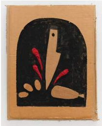
26. Florian Morlat Blood Sausage , 2023 Celluclay and flashe on cardboard 14 x 18 inches