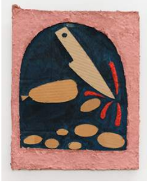
30. Florian Morlat Cold Cut , 2023 Celluclay and flashe on cardboard 14 x 18 inches