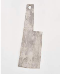
31. Florian Morlat Untitled , 2023 Celluclay and flashe on cardboard 35 x 12 inches