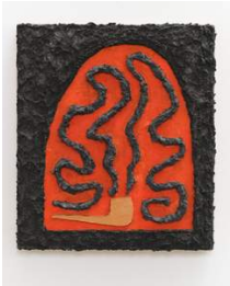
14. Florian Morlat Untitled , 2022 Celluclay, flashe and cardboard on linen 14 x 16 inches