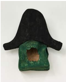
9. Florian Morlat Untitled , 2023 Celluclay, cardboard, paper and flashe 20 x 22 x 6 inches