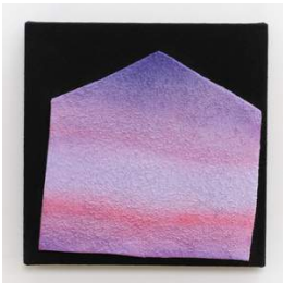
10. Kim Fisher Open House , 2023 Oil on masonry stucco on dyed linen covered panel 14 x 14 inches