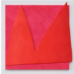
1. Kim Fisher Cuttings , 2023 Oil on matrix dryve on dyed linen covered panel 32 x 32 inches