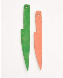
25. Florian Morlat Untitled , 2023 Celluclay and flashe on cardboard 20 x 6 inches