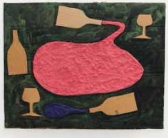
24. Florian Morlat Double Spill , 2023 Celluclay and flashe on cardboard 30 x 24 inches