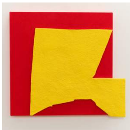
4. Kim Fisher Treehouse , 2023 Oil on masonry stucco on dyed linen on panel 35 x 31 inches