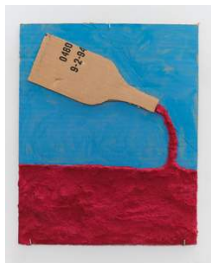
20. Florian Morlat Untitled , 2023 Celluclay and flashe on cardboard 12 x 14 inches