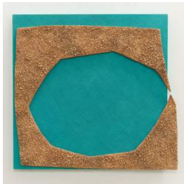
2. Kim Fisher Core , 2023 Oil on gravel and masonry stucco on dyed linen covered panel 33 x 31 inches