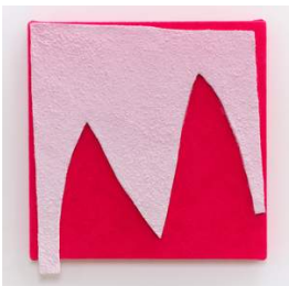
16. Kim Fisher Fang , 2023 Oil, masonry stucco on dyed linen 14.5 x 14 inches