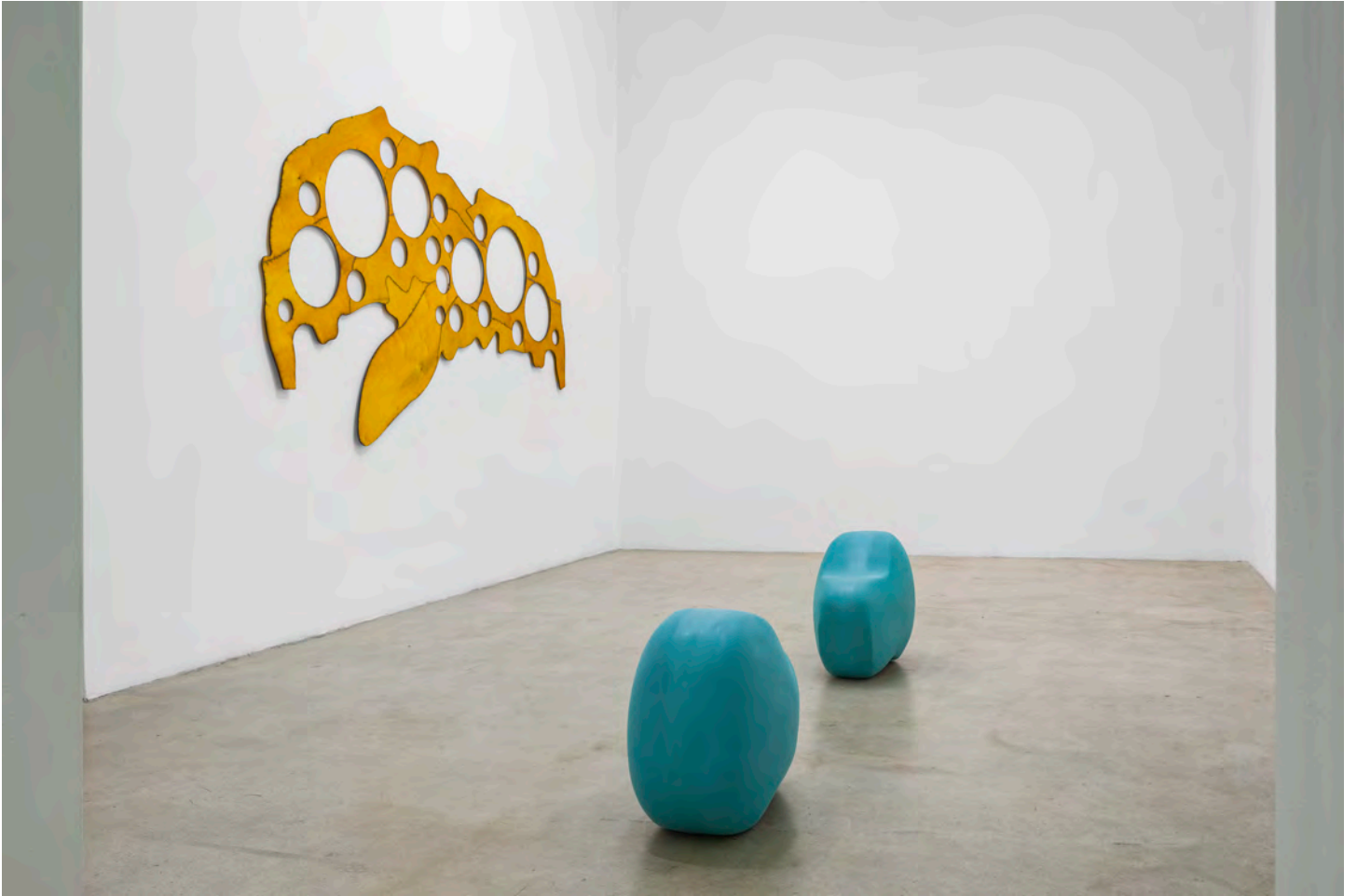
Chadwick Rantanen, RIGORS , Installation view, 2023