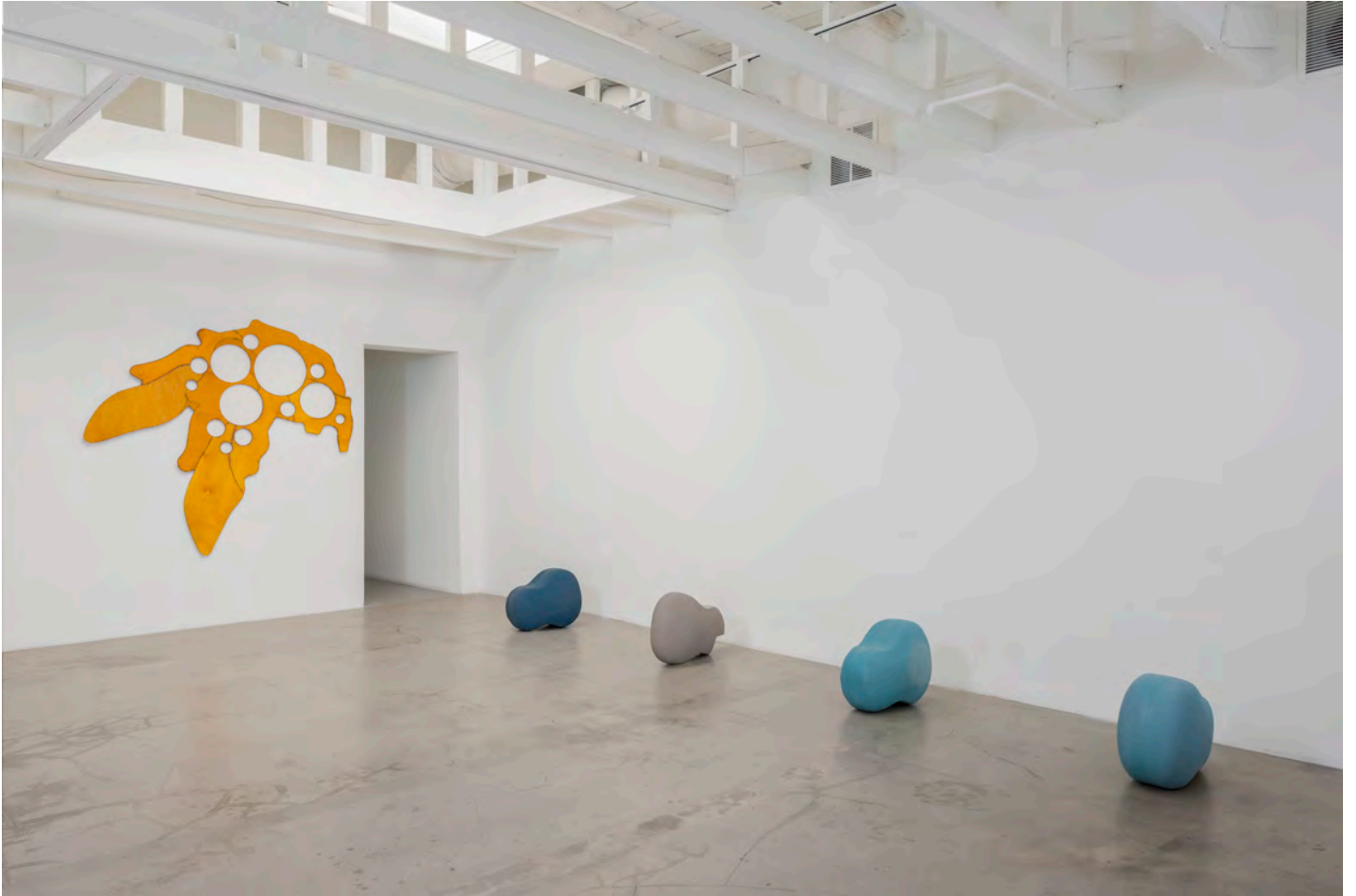
Chadwick Rantanen, RIGORS , Installation view, 2023