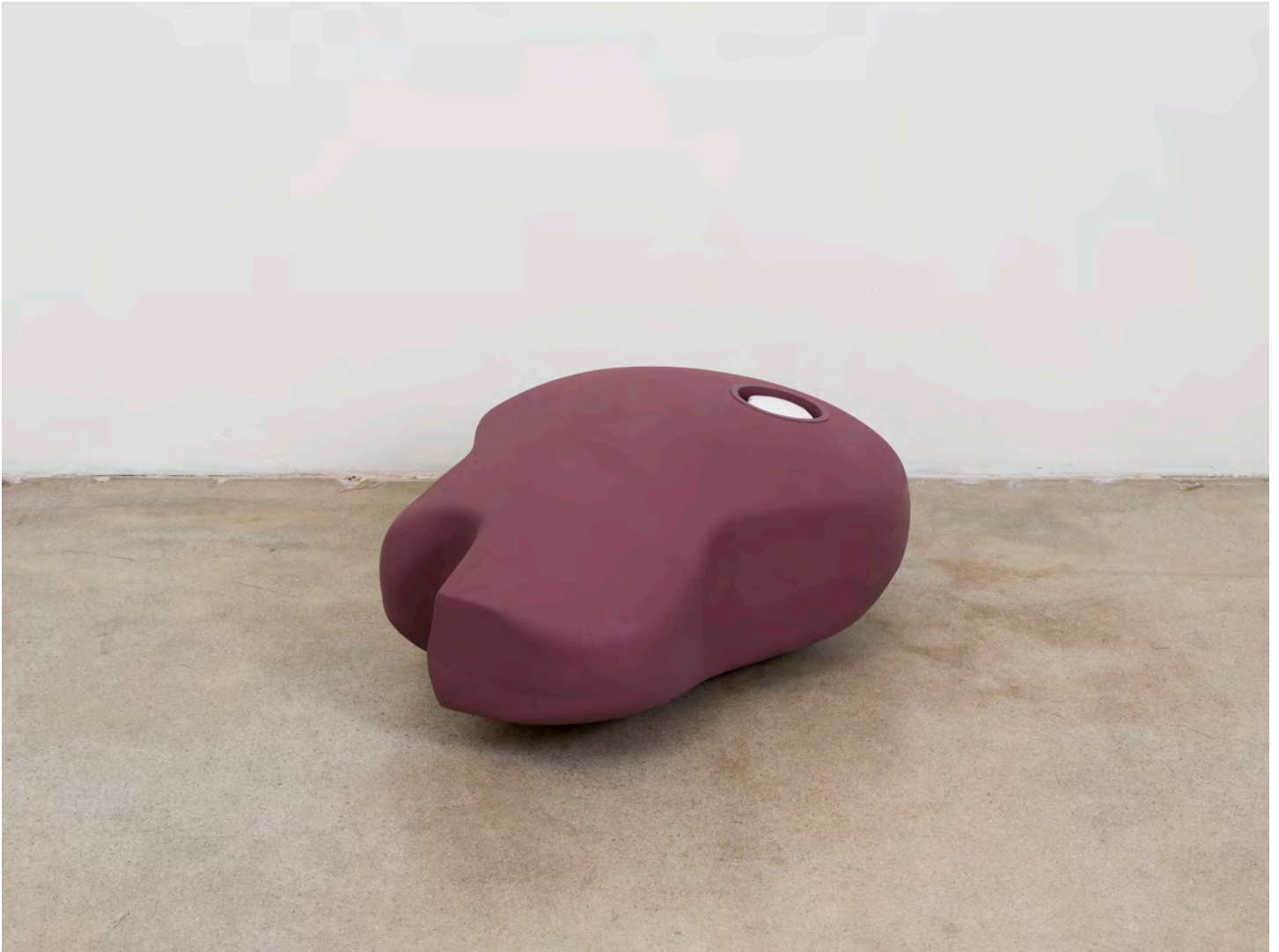
Chadwick Rantanen Weightable Cutaway , 2023 Fiberglass, resin, wood, urethane, pvc, sand 12 x 16.5 x 20 inches mb1948