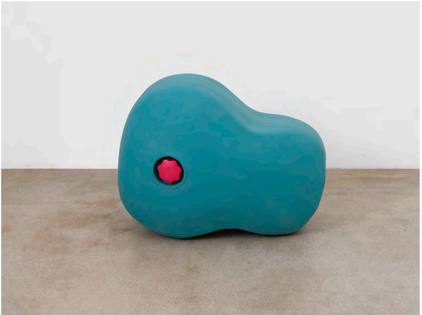
Chadwick Rantanen Weightable Roundback , 2023 Fiberglass, resin, wood, urethane, pvc, sand 12 x 16.5 x 20 inches mb1961