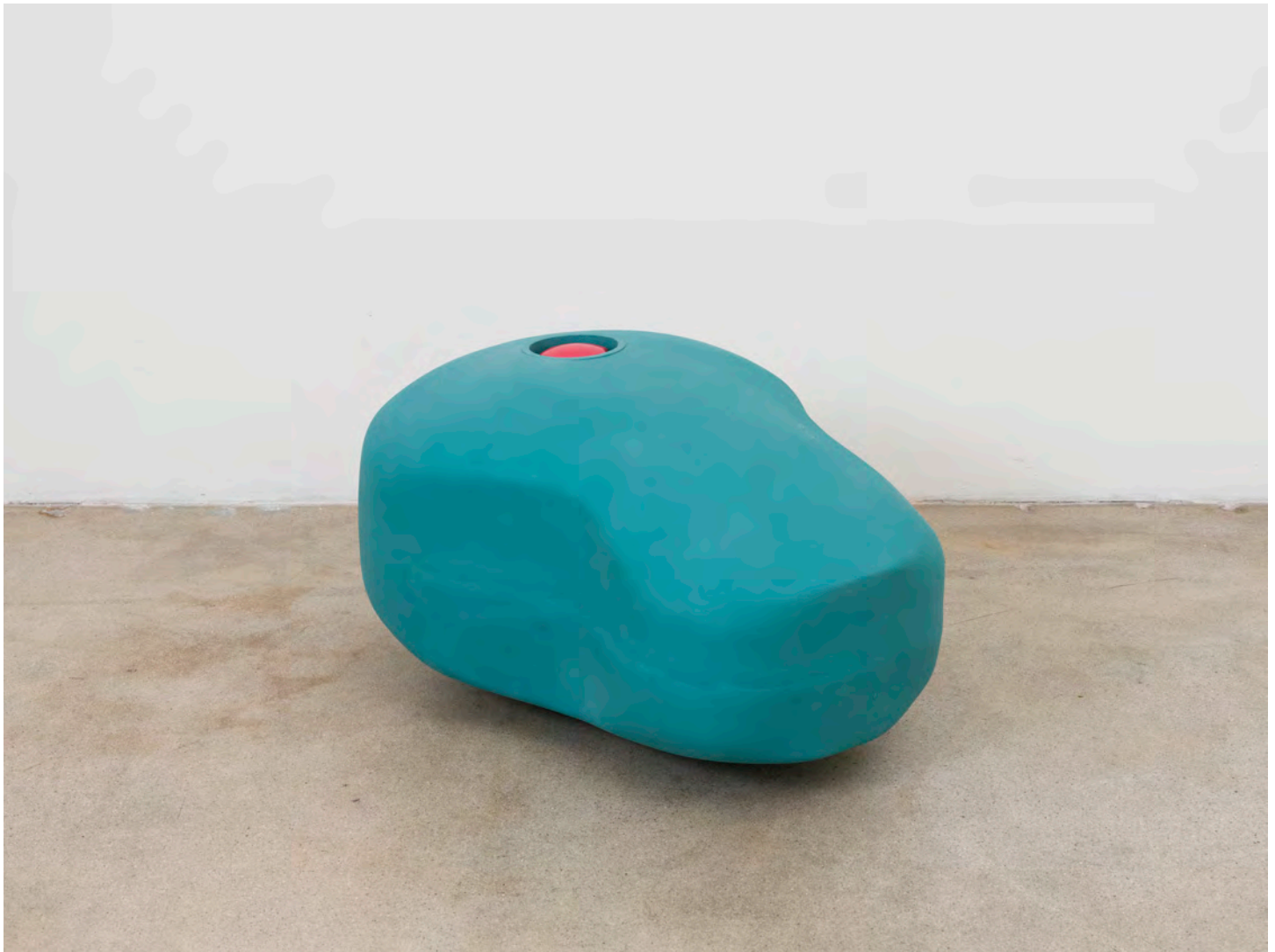
Chadwick Rantanen Weightable Roundback , 2023 Fiberglass, resin, wood, urethane, pvc, sand 12 x 16.5 x 20 inches mb1961