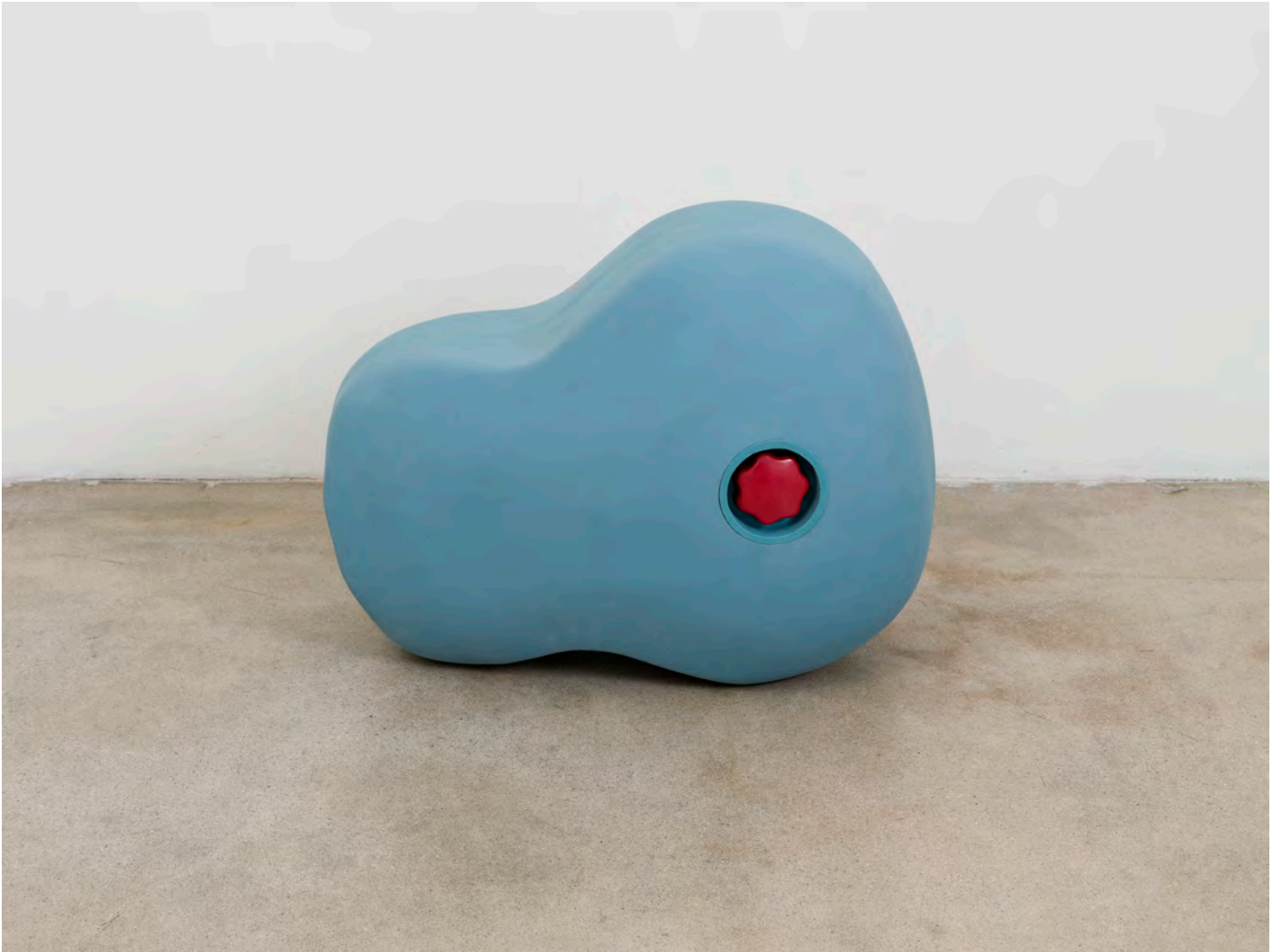
Chadwick Rantanen Weightable Roundback , 2023 Fiberglass, resin, wood, urethane, pvc, sand 12 x 16.5 x 20 inches mb1958