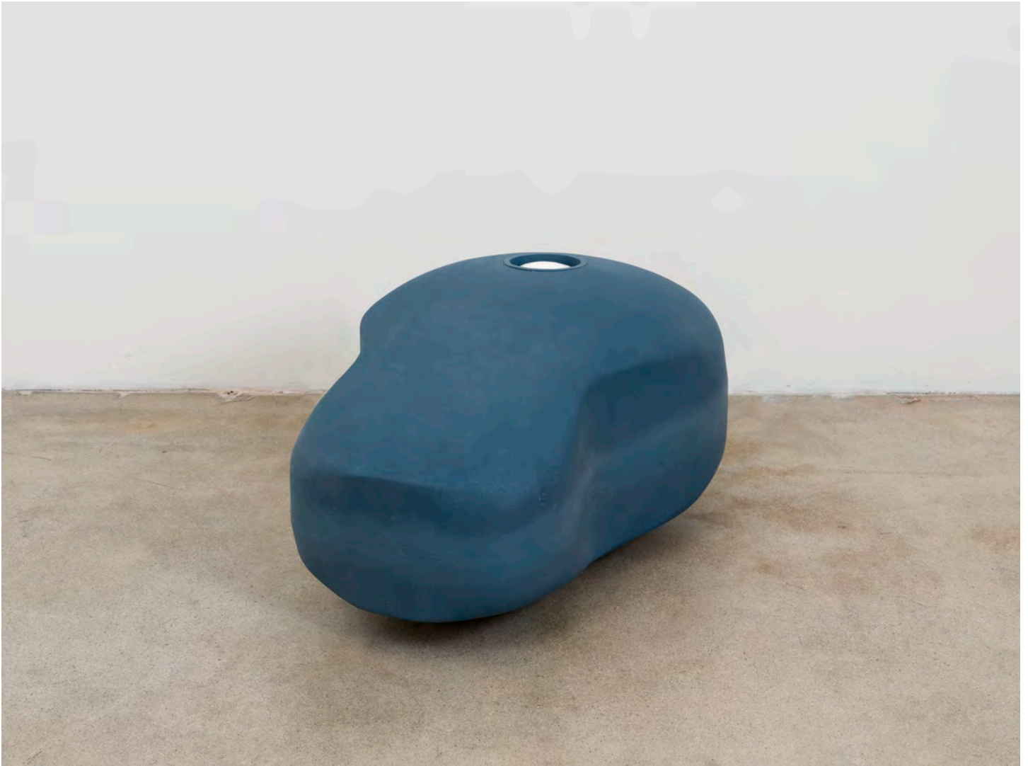
Chadwick Rantanen Weightable Roundback , 2023 Fiberglass, resin, wood, urethane, pvc, sand 12 x 16.5 x 20 inches mb1955