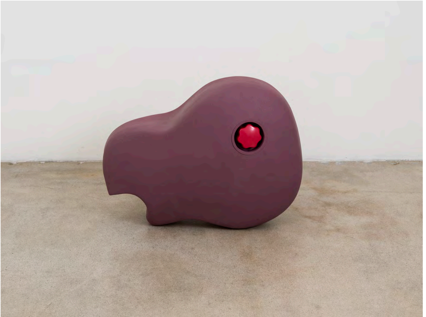
Chadwick Rantanen Weightable Cutaway , 2023 Fiberglass, resin, wood, urethane, pvc, sand 12 x 16.5 x 20 inches mb1949