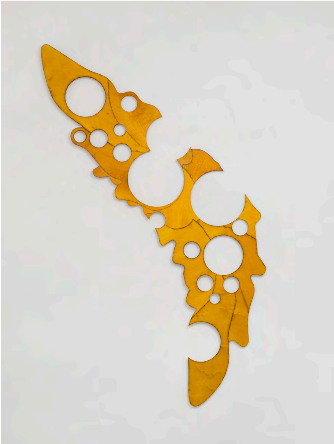
Chadwick Rantanen Epaulet (scrambled eggs) , 2023 Laser cut poplar plywood, stain 115 x 32 inches mb1941