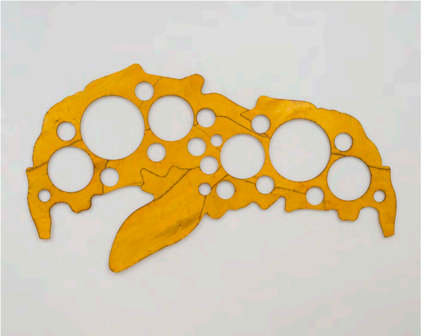
Chadwick Rantanen Epaulet (scrambled eggs) , 2023 Laser cut poplar plywood, stain 52 x 94 inches mb1959