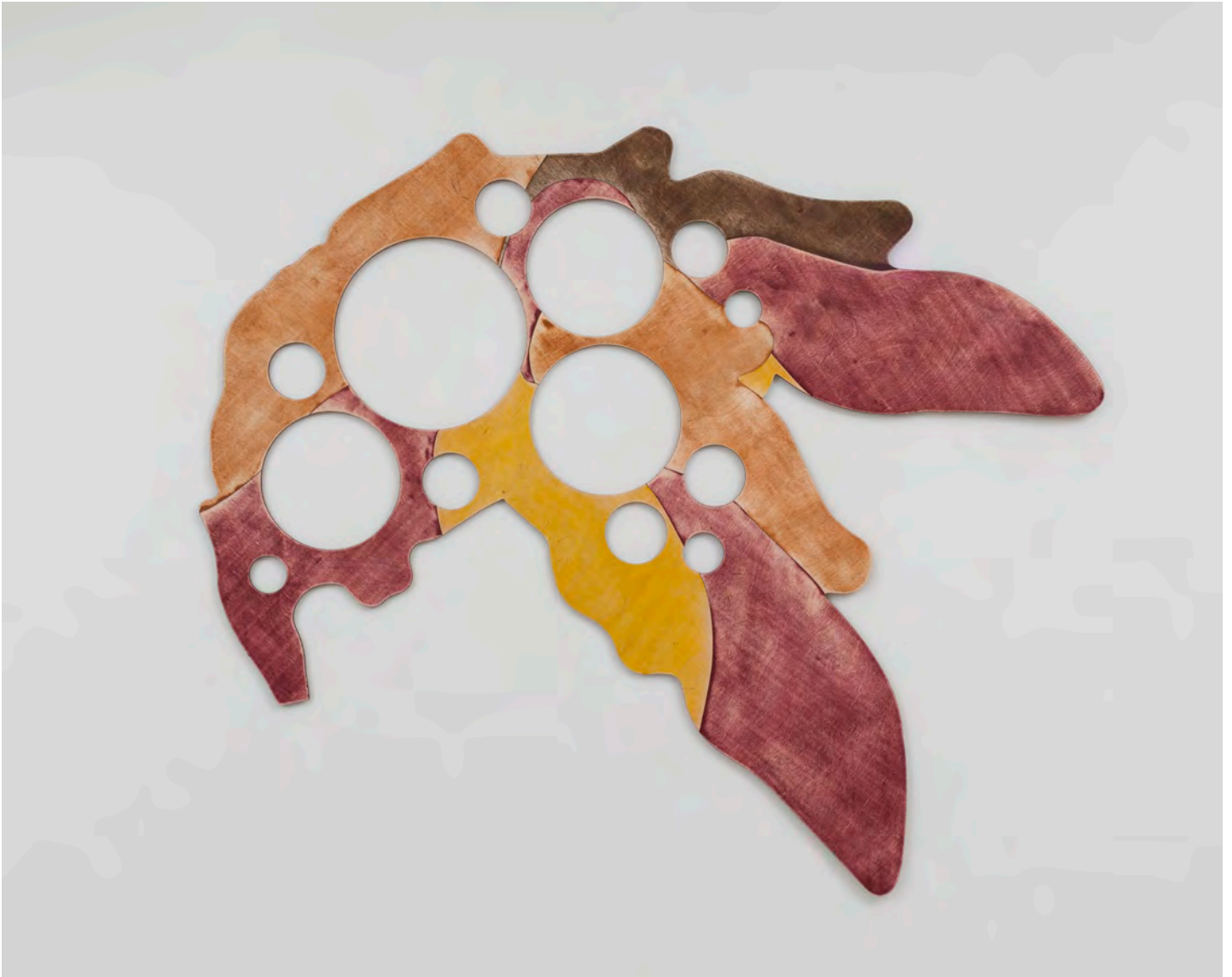
Chadwick Rantanen Epaulet (distressed) , 2023 Laser cut poplar plywood, stain 52 x 65.5 inches mb1953