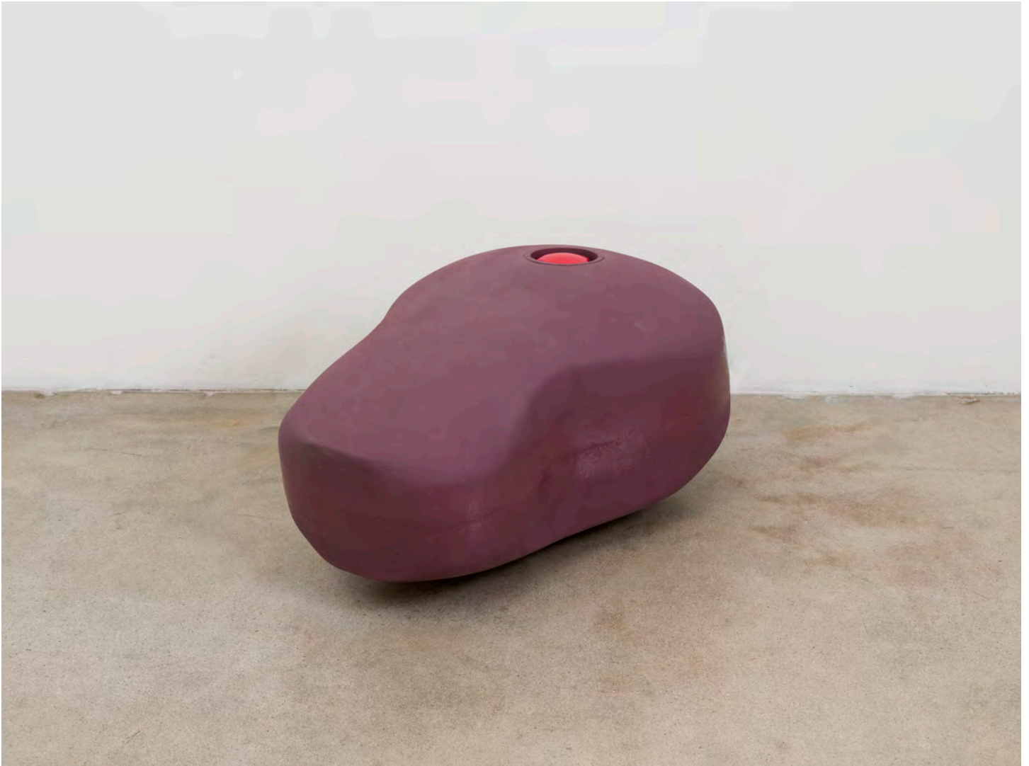
Chadwick Rantanen Weightable Roundback , 2023 Fiberglass, resin, wood, urethane, pvc, sand 12 x 16.5 x 20 inches mb1951