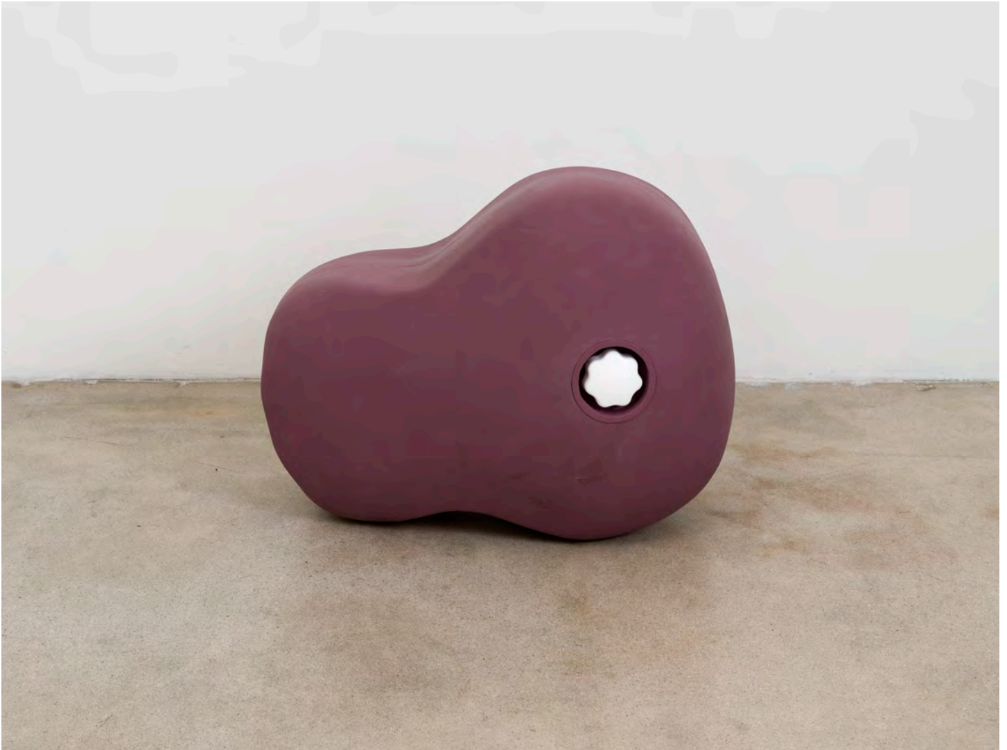
Chadwick Rantanen Weightable Roundback , 2023 Fiberglass, resin, wood, urethane, pvc, sand 12 x 16.5 x 20 inches mb1947