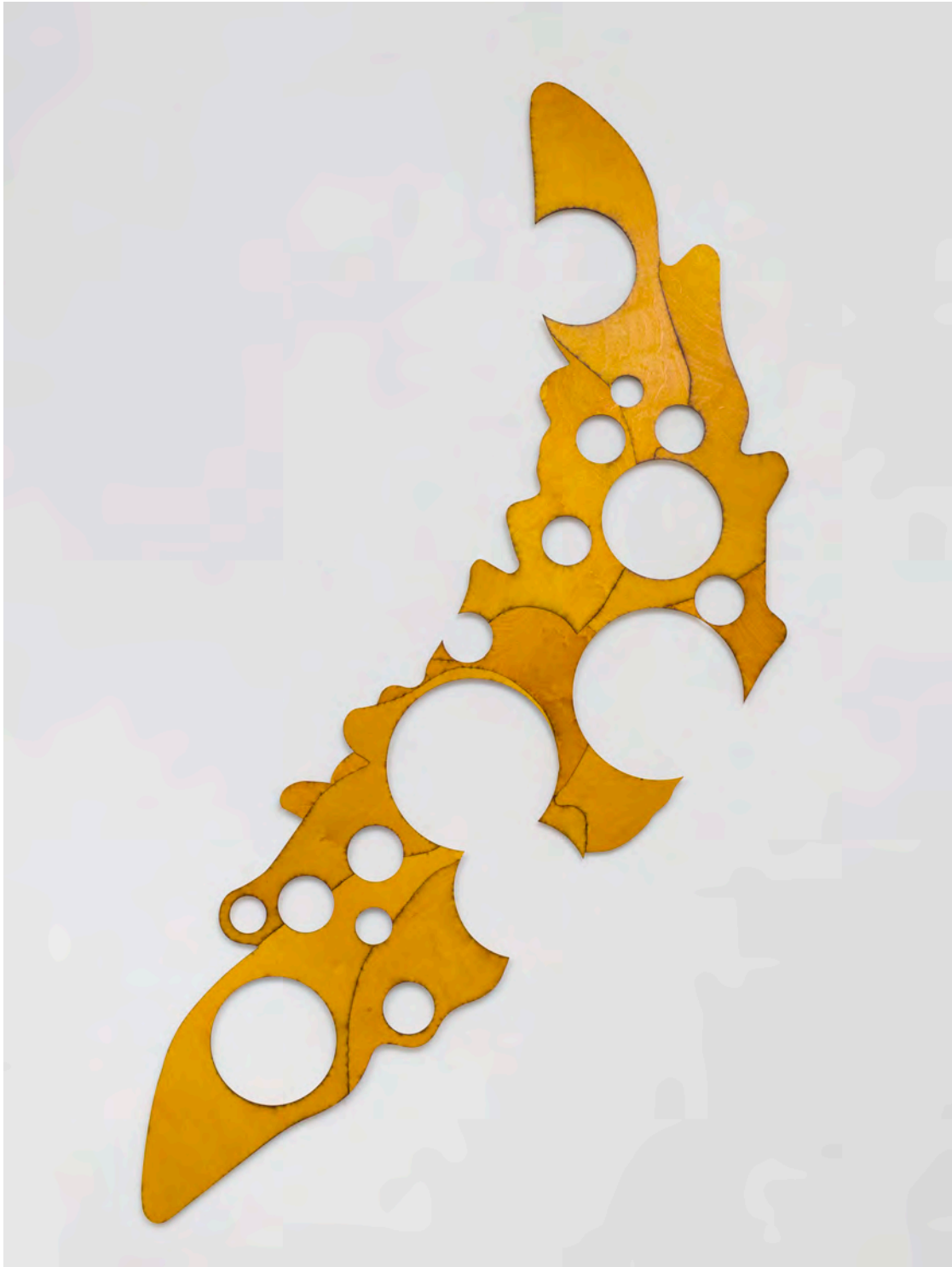
Chadwick Rantanen Epaulet (scrambled eggs) , 2023 Laser cut poplar plywood, stain 115 x 32 inches mb1942