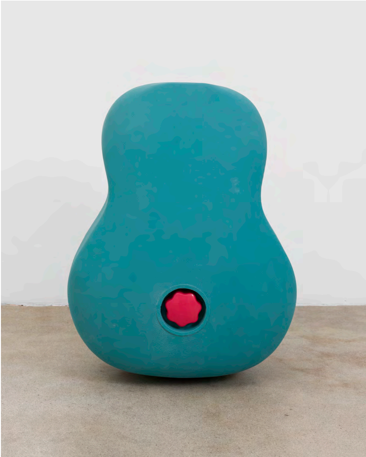
Chadwick Rantanen Weightable Roundback , 2023 Fiberglass, resin, wood, urethane, pvc, sand 12 x 16.5 x 20 inches mb1960