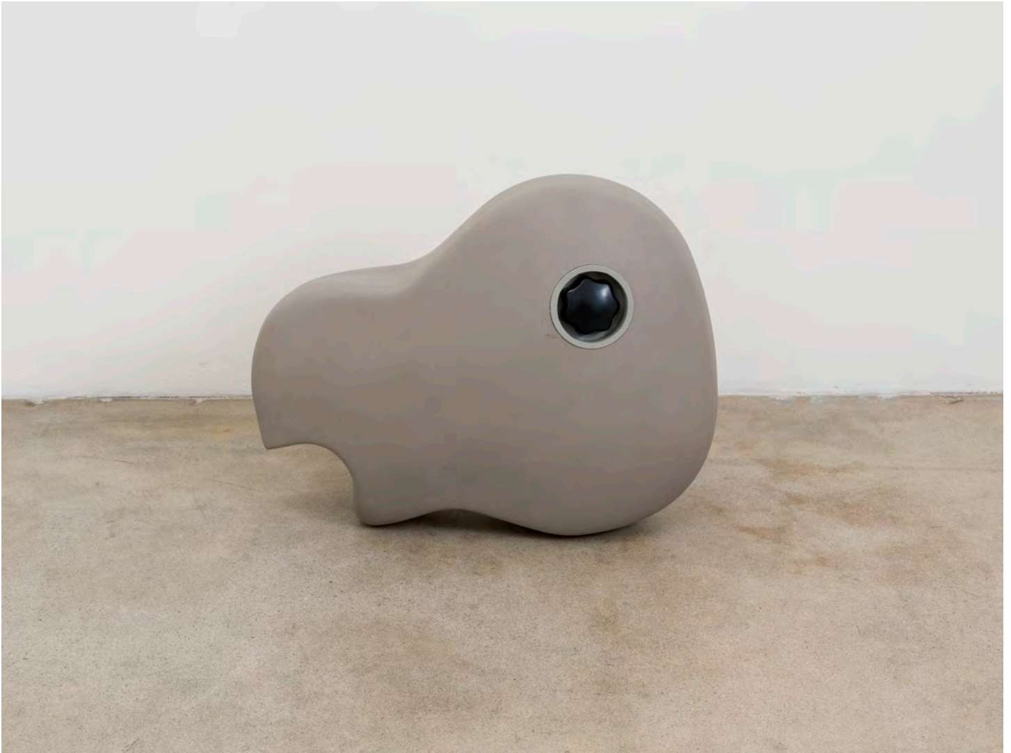
Chadwick Rantanen Weightable Cutaway , 2023 Fiberglass, resin, wood, urethane, pvc, sand 12 x 16.5 x 20 inches mb1956