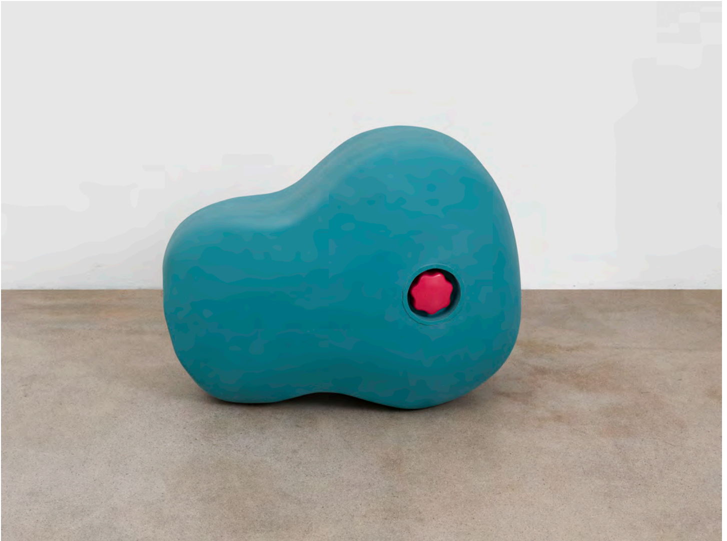
Chadwick Rantanen Weightable Roundback , 2023 Fiberglass, resin, wood, urethane, pvc, sand 12 x 16.5 x 20 inches mb1960