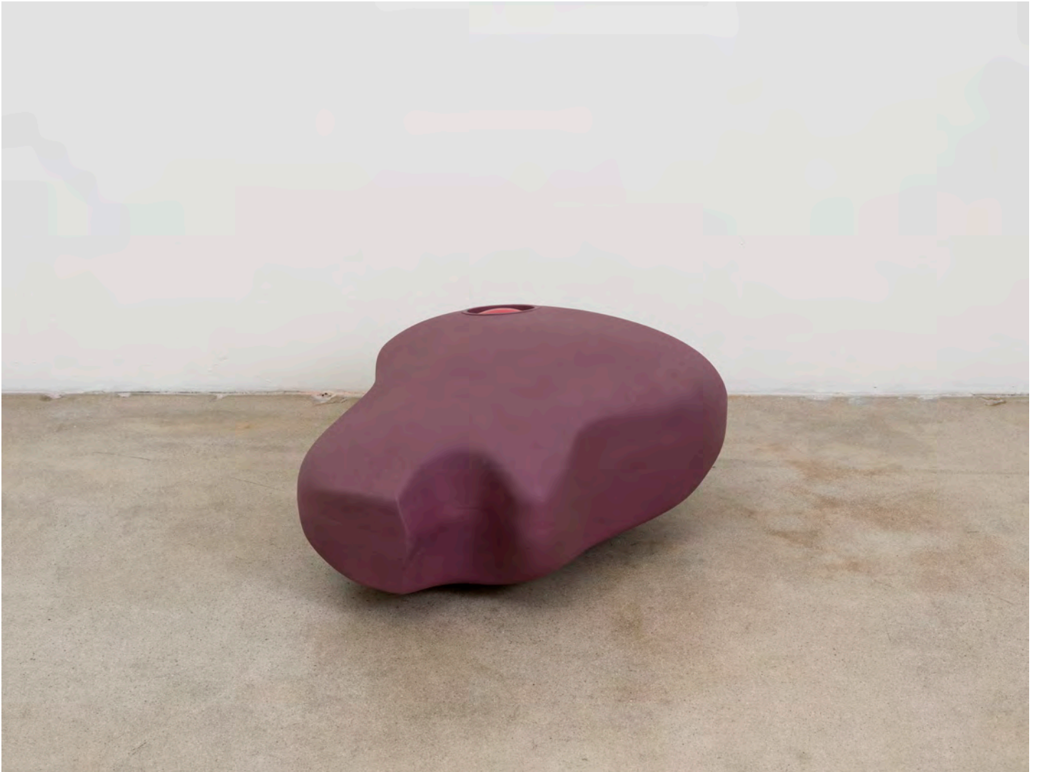
Chadwick Rantanen Weightable Cutaway , 2023 Fiberglass, resin, wood, urethane, pvc, sand 12 x 16.5 x 20 inches mb1949