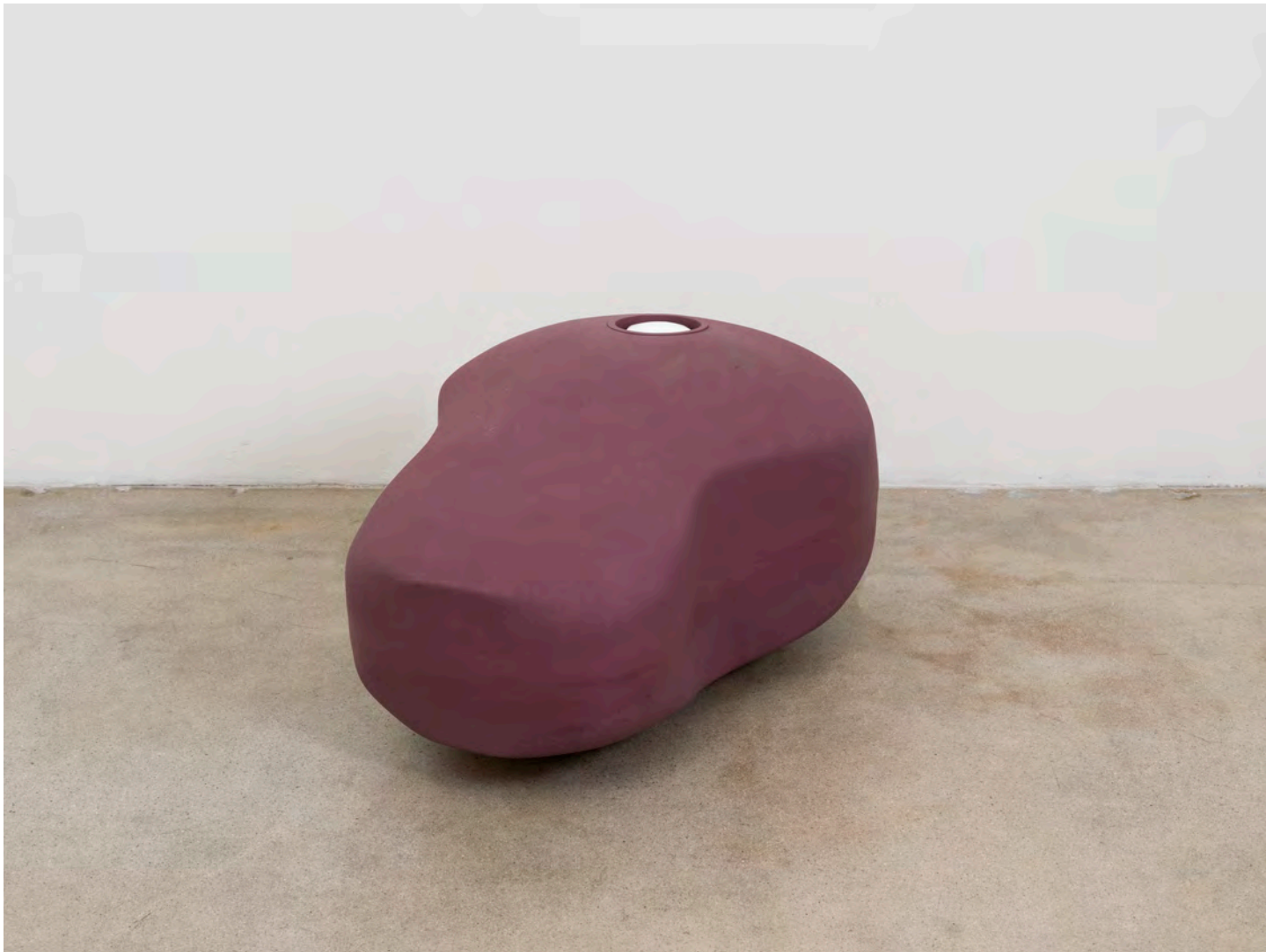
Chadwick Rantanen Weightable Roundback , 2023 Fiberglass, resin, wood, urethane, pvc, sand 12 x 16.5 x 20 inches mb1947