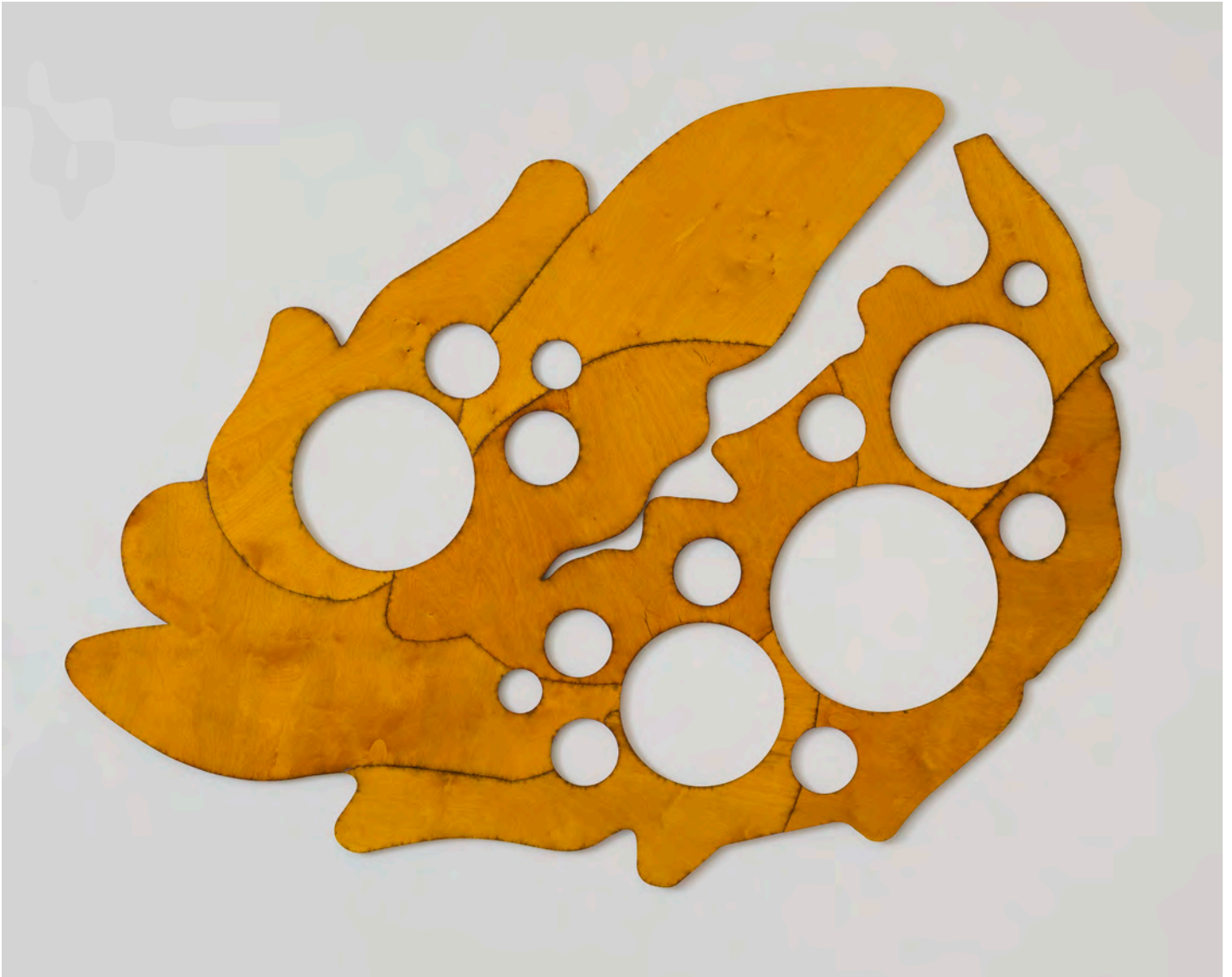
Chadwick Rantanen Epaulet (scrambled eggs) , 2023 Laser cut poplar plywood, stain 76 x 57 inches mb1943