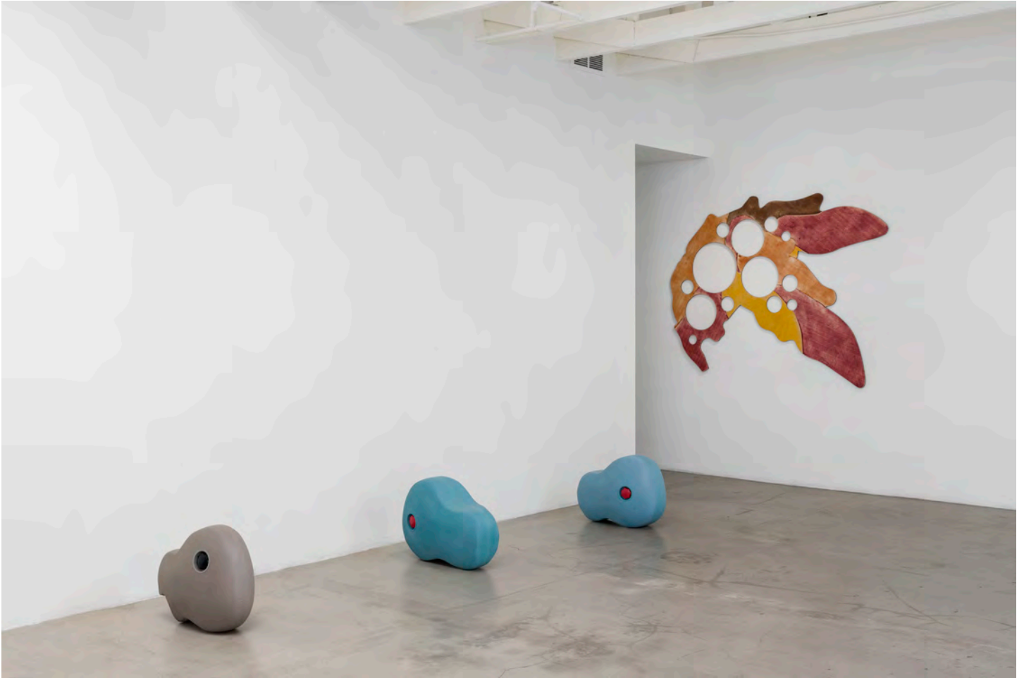
Chadwick Rantanen, RIGORS , Installation view, 2023