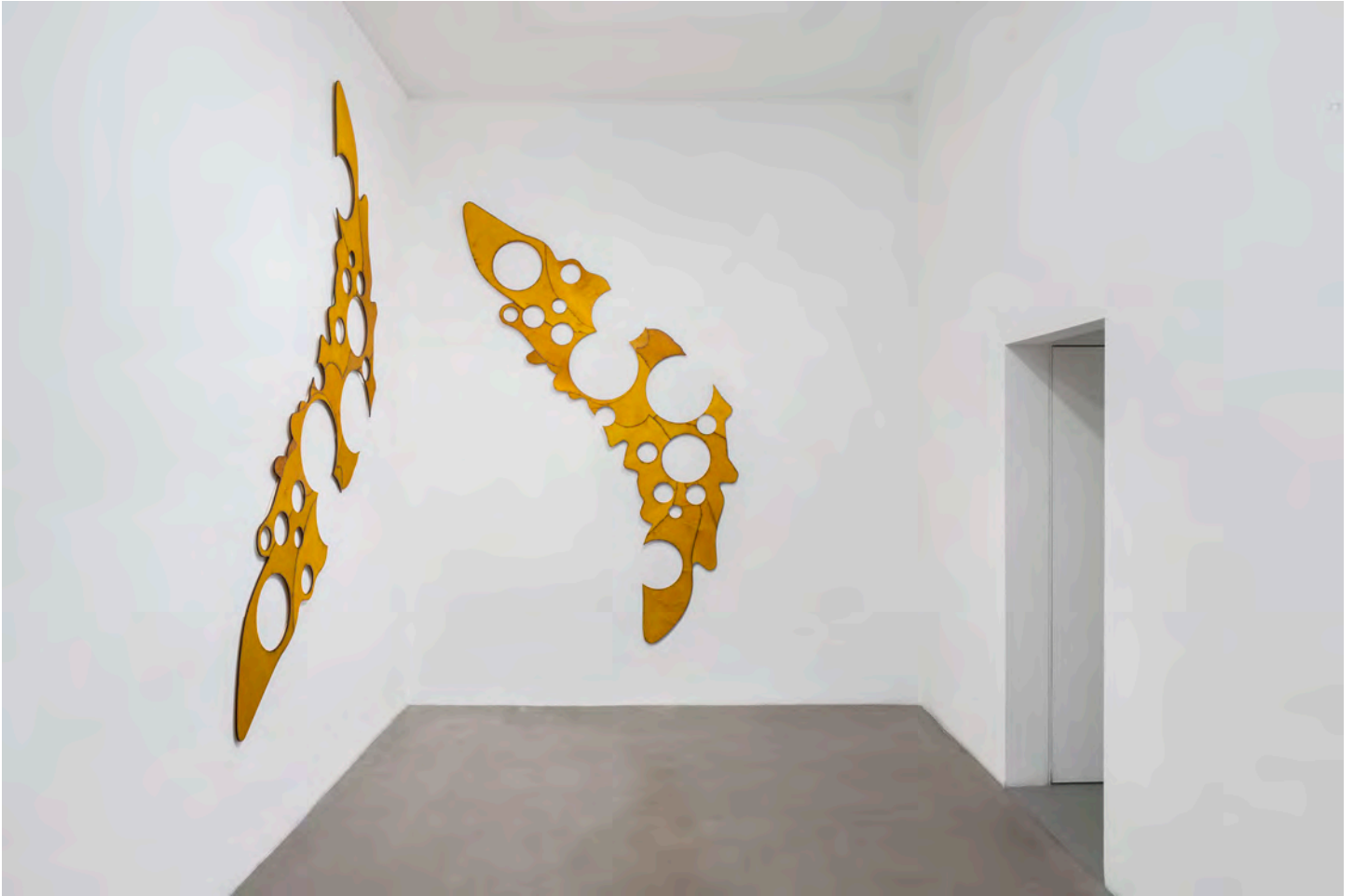
Chadwick Rantanen, RIGORS , Installation view, 2023