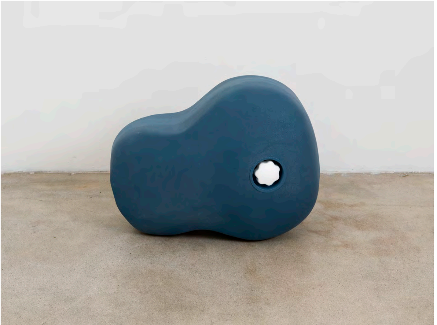
Chadwick Rantanen Weightable Roundback , 2023 Fiberglass, resin, wood, urethane, pvc, sand 12 x 16.5 x 20 inches mb1955