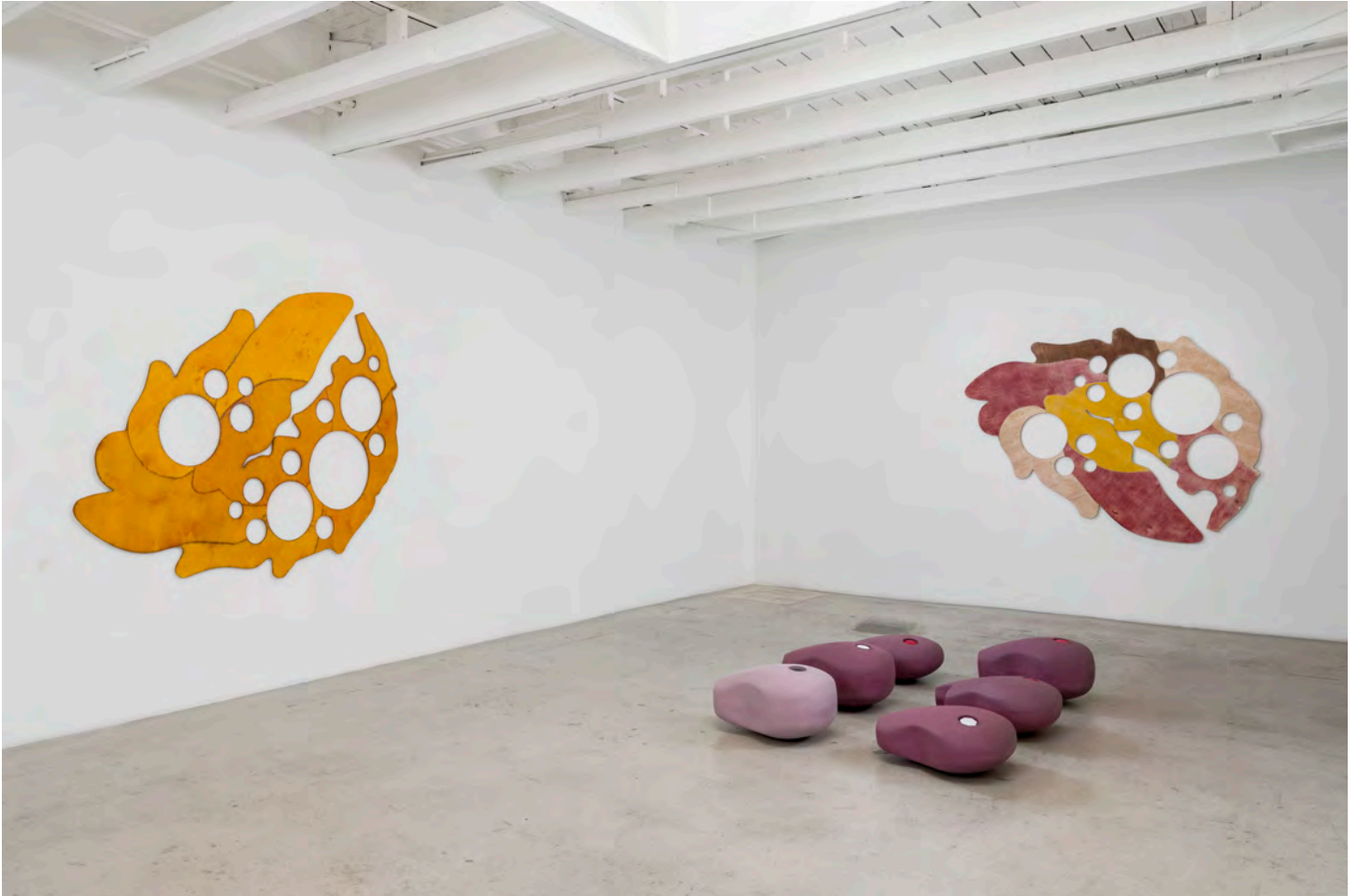
Chadwick Rantanen, RIGORS , Installation view, 2023