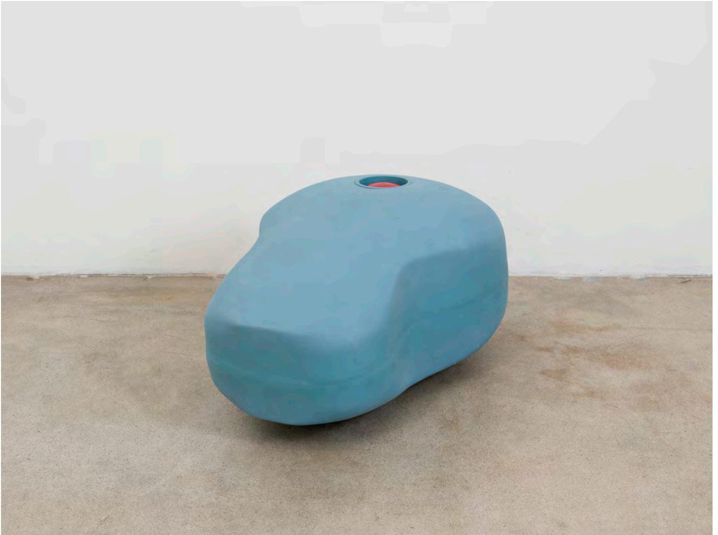
Chadwick Rantanen Weightable Roundback , 2023 Fiberglass, resin, wood, urethane, pvc, sand 12 x 16.5 x 20 inches mb1958