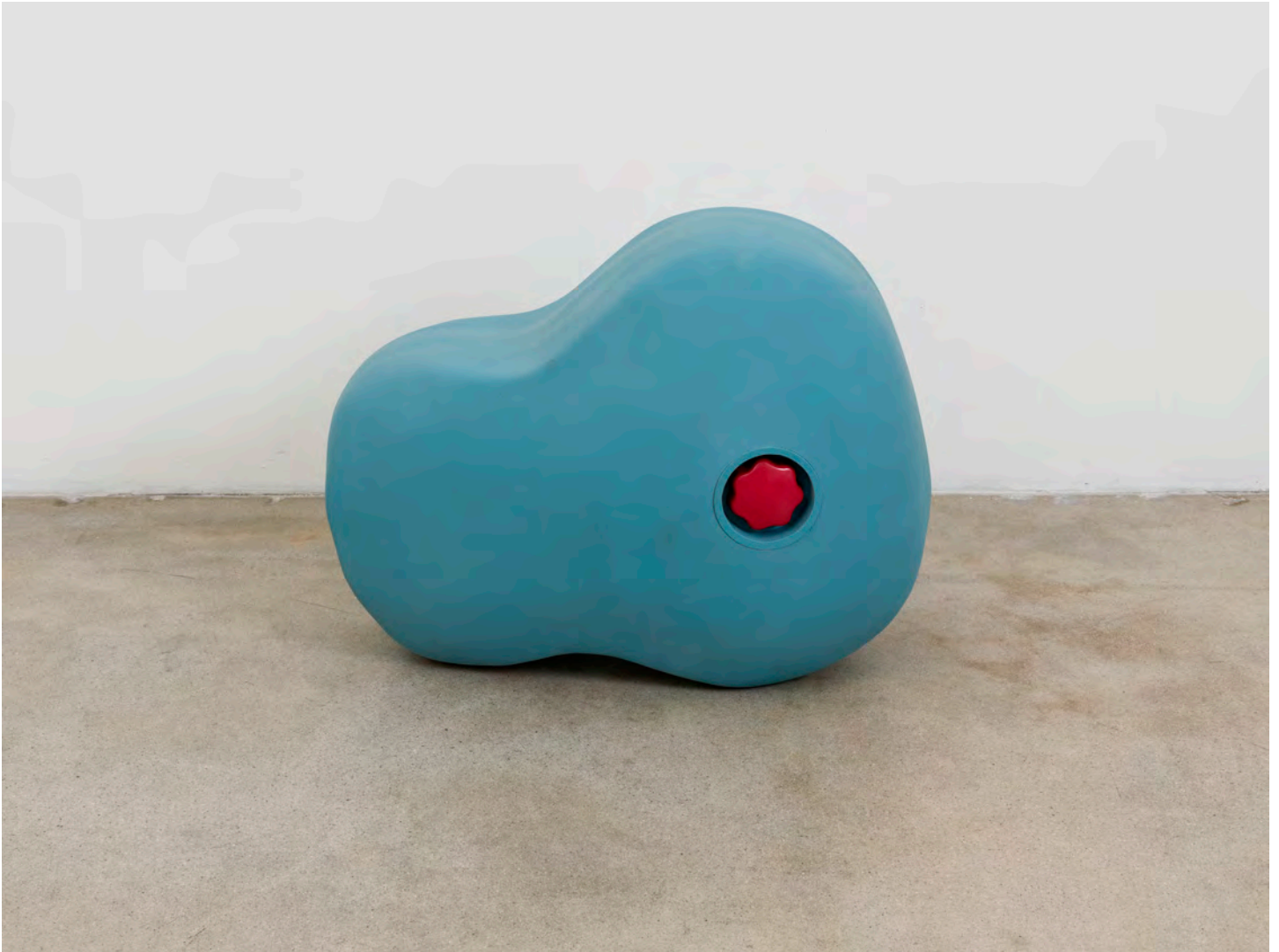
Chadwick Rantanen Weightable Roundback , 2023 Fiberglass, resin, wood, urethane, pvc, sand 12 x 16.5 x 20 inches mb1957