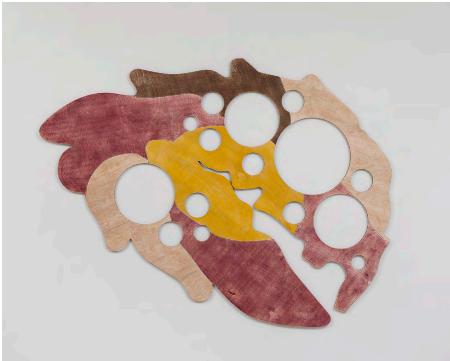
Chadwick Rantanen Epaulet (distressed) , 2023 Laser cut poplar plywood, stain 76 x 57 inches mb1944