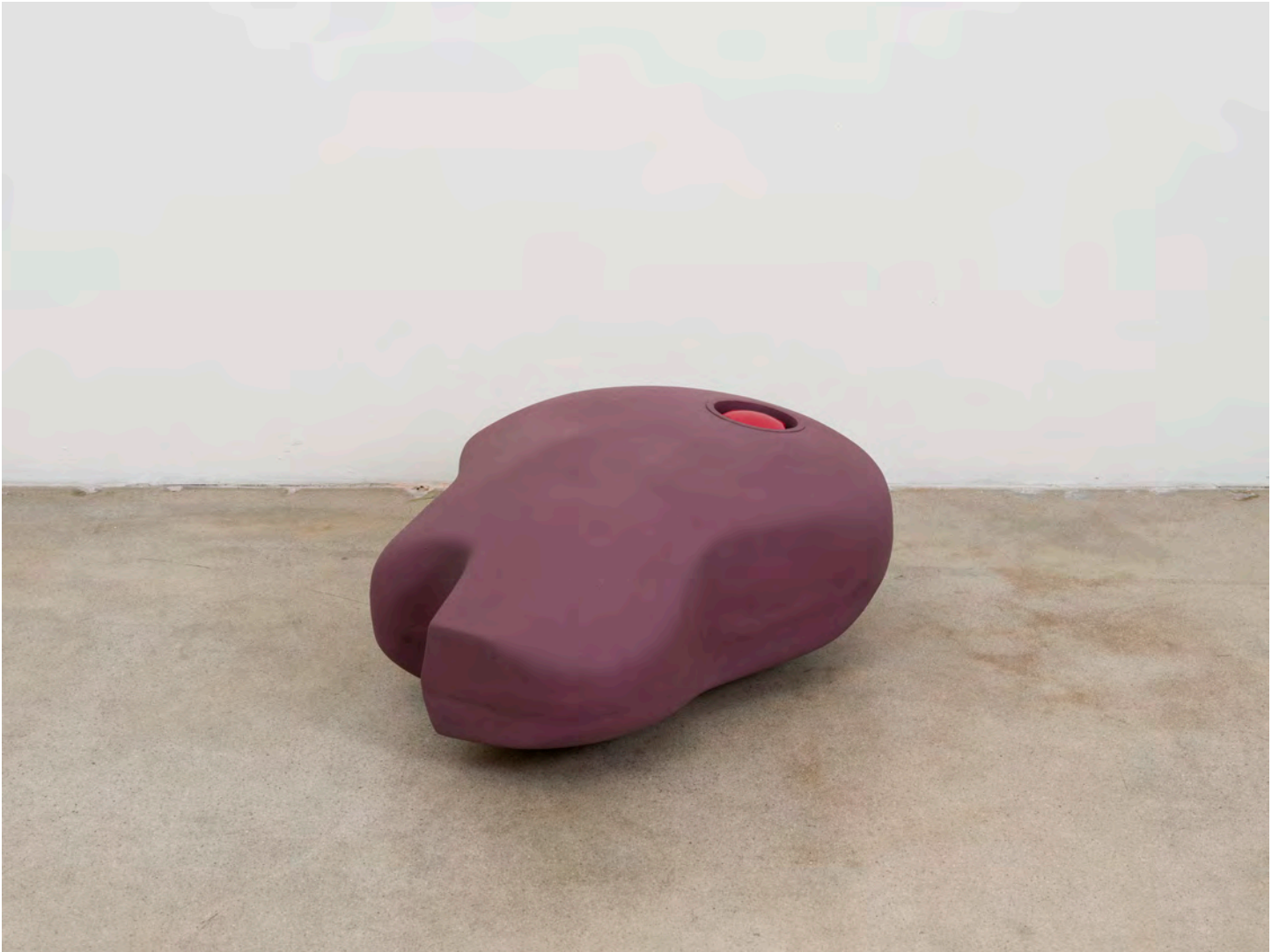
Chadwick Rantanen Weightable Cutaway , 2023 Fiberglass, resin, wood, urethane, pvc, sand 12 x 16.5 x 20 inches mb1950