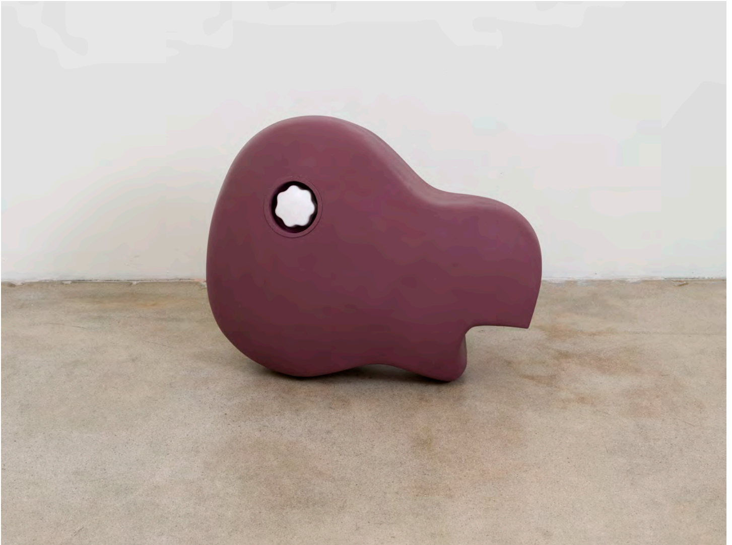
Chadwick Rantanen Weightable Cutaway , 2023 Fiberglass, resin, wood, urethane, pvc, sand 12 x 16.5 x 20 inches mb1948