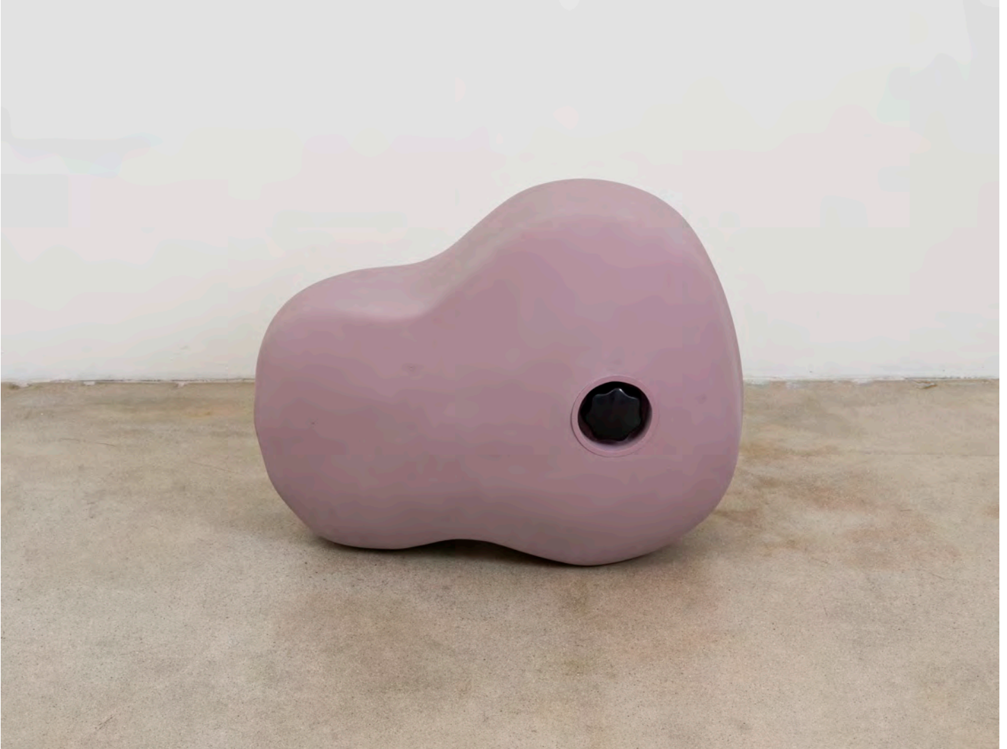
Chadwick Rantanen Weightable Roundback , 2023 Fiberglass, resin, wood, urethane, pvc, sand 12 x 16.5 x 20 inches mb1946