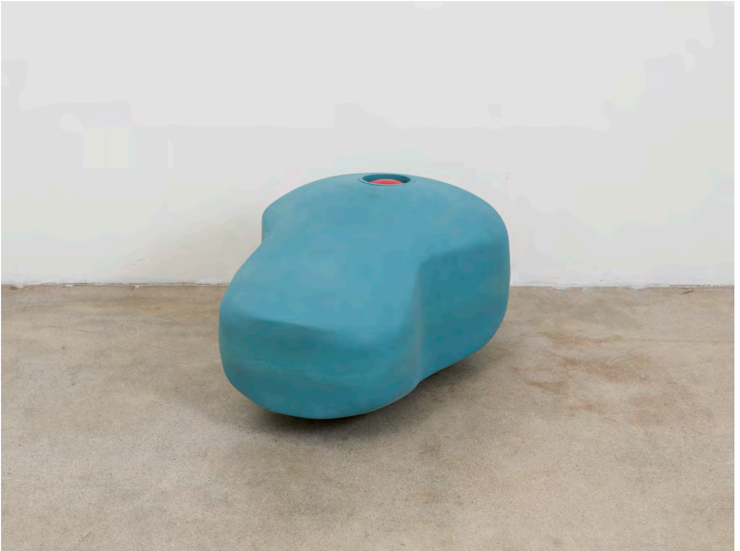
Chadwick Rantanen Weightable Roundback , 2023 Fiberglass, resin, wood, urethane, pvc, sand 12 x 16.5 x 20 inches mb1957