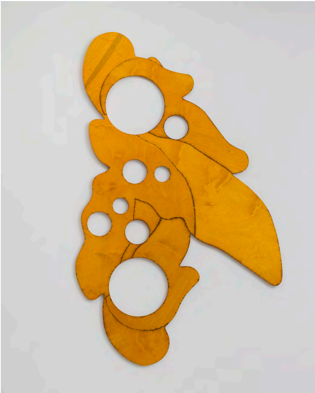
Chadwick Rantanen Epaulet (scrambled eggs) , 2023 Laser cut poplar plywood, stain 71 x 43 inches mb1945