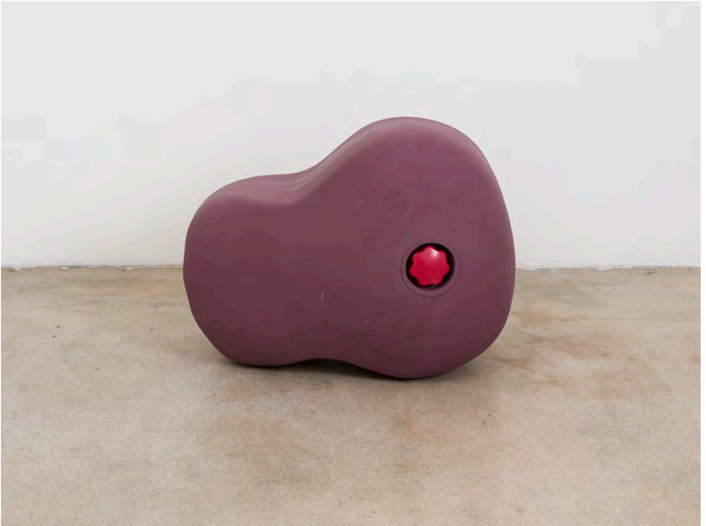
Chadwick Rantanen Weightable Roundback , 2023 Fiberglass, resin, wood, urethane, pvc, sand 12 x 16.5 x 20 inches mb1951