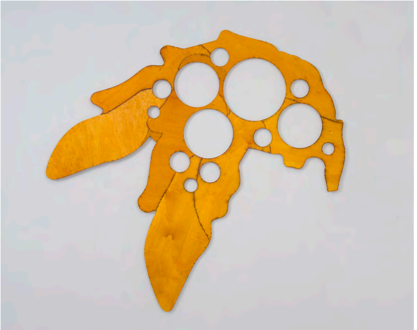
Chadwick Rantanen Epaulet (scrambled eggs) , 2023 Laser cut poplar plywood, stain 52 x 65.5 inches mb1953