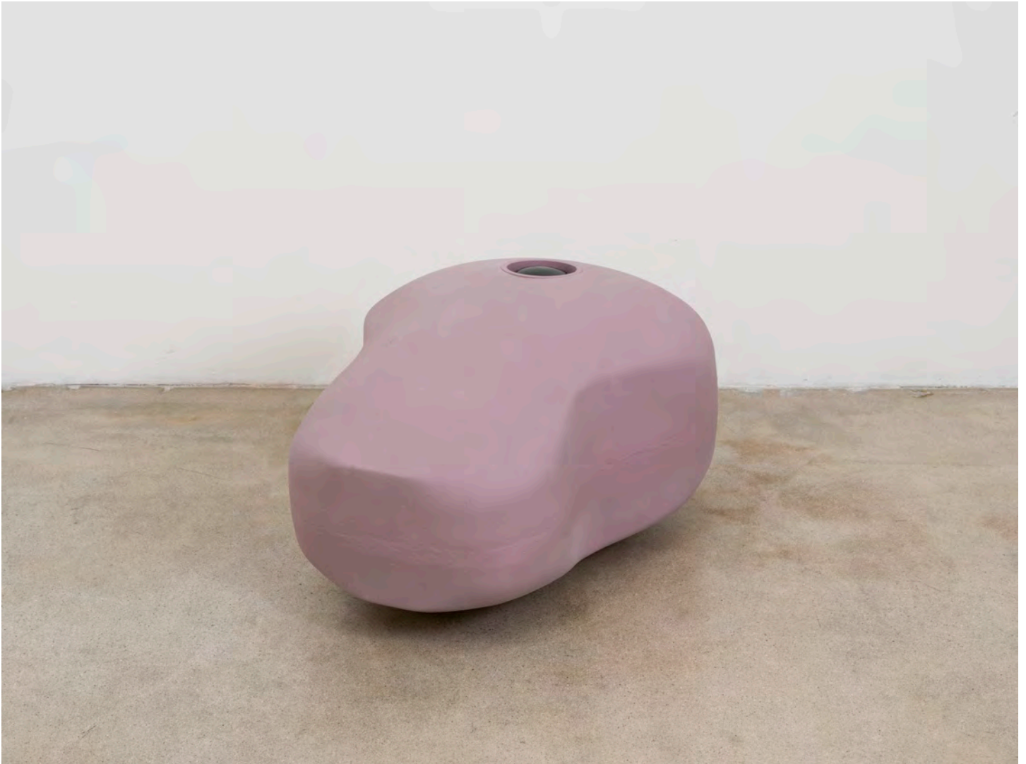
Chadwick Rantanen Weightable Roundback , 2023 Fiberglass, resin, wood, urethane, pvc, sand 12 x 16.5 x 20 inches mb1946