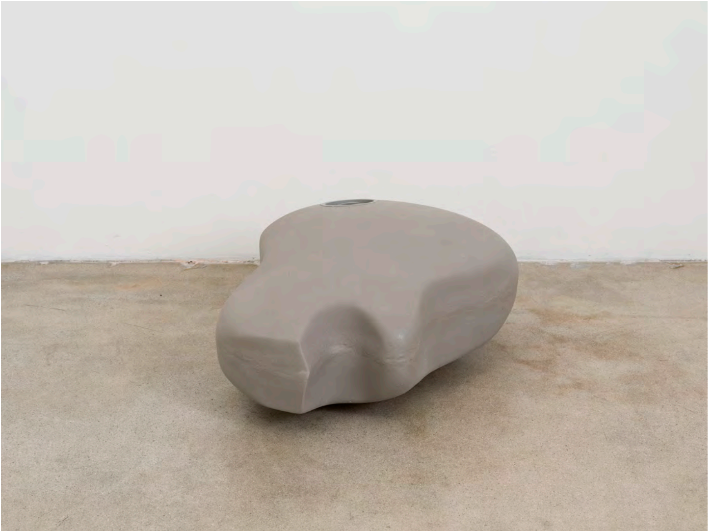
Chadwick Rantanen Weightable Cutaway , 2023 Fiberglass, resin, wood, urethane, pvc, sand 12 x 16.5 x 20 inches mb1956