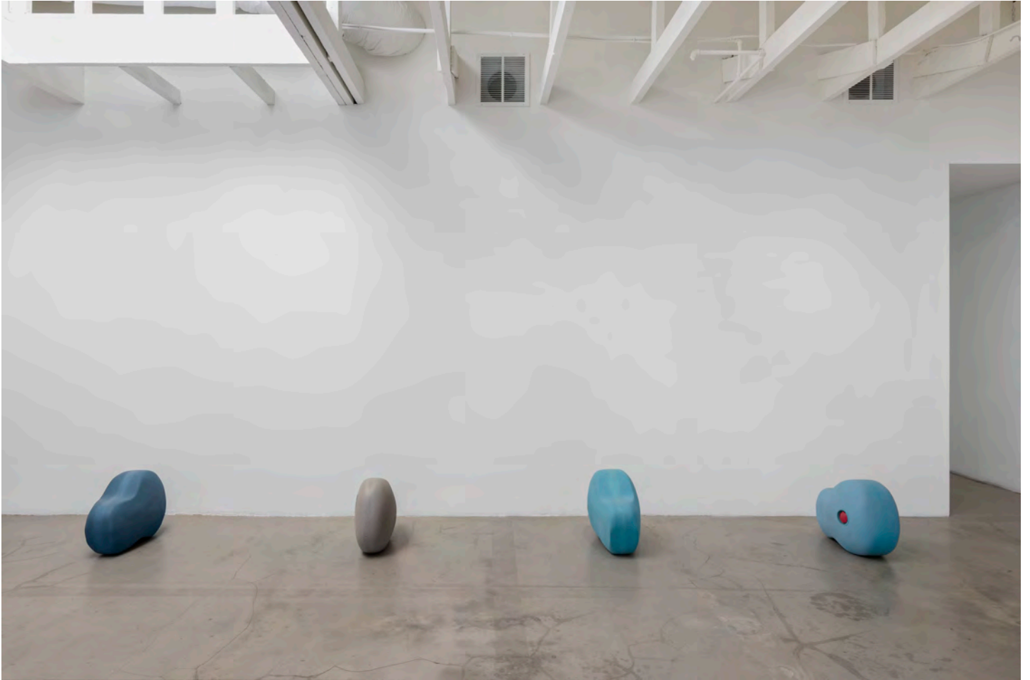
Chadwick Rantanen, RIGORS , Installation view, 2023