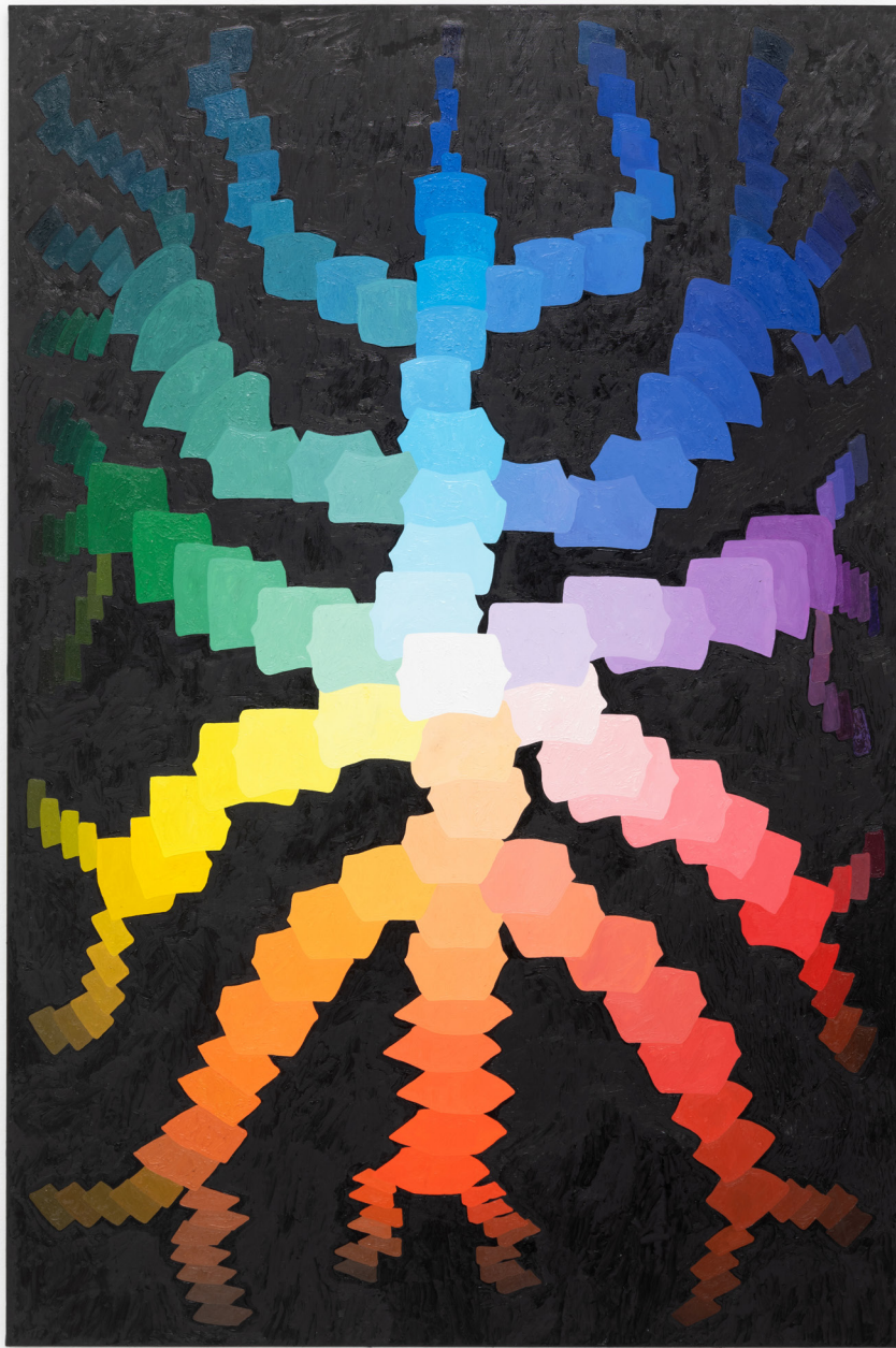
Scute Composition for Hirschfeld-Mack, 2020 Oil on canvas 160,5 x 106 cm