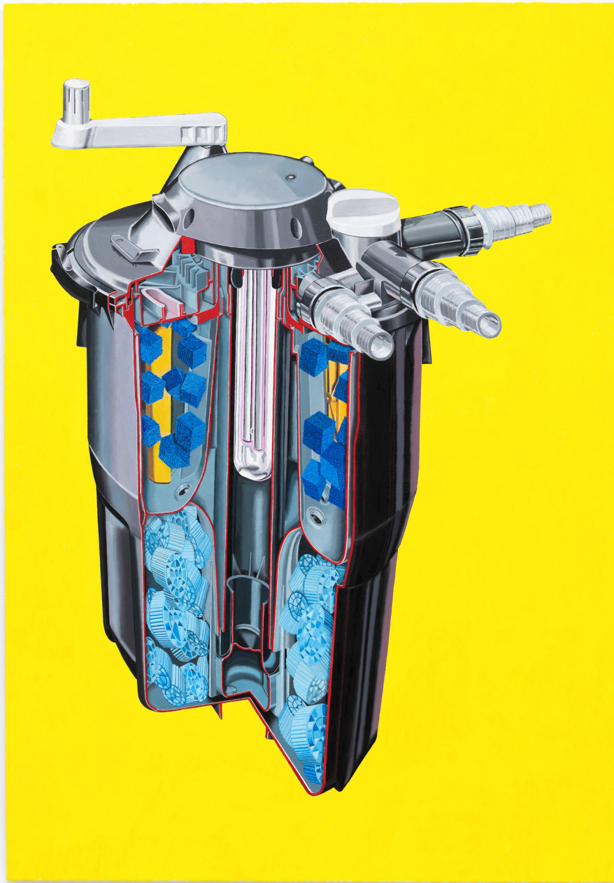
Anamorphic Filter with Cutaway View, 2022 Oil on canvas 160 x 110 cm