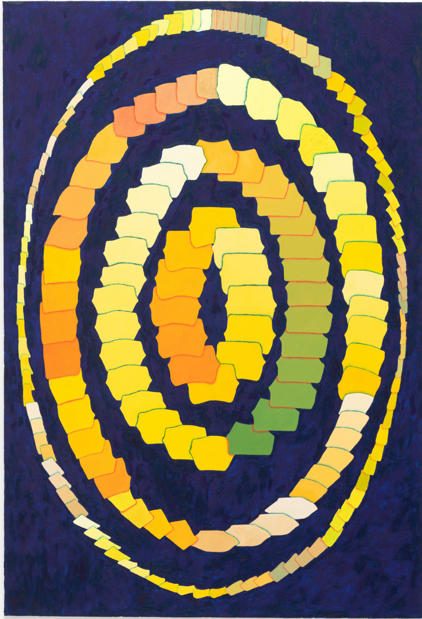
Yellow Caparace Dispersion, 2020 Oil on canvas 160 x 110 cm