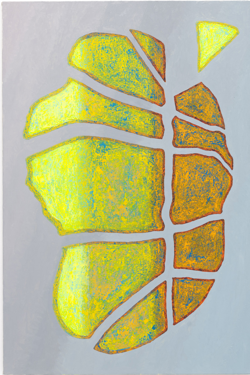
Plastron , 2023 Oil and vinyl color on canvas 150 x 100 cm