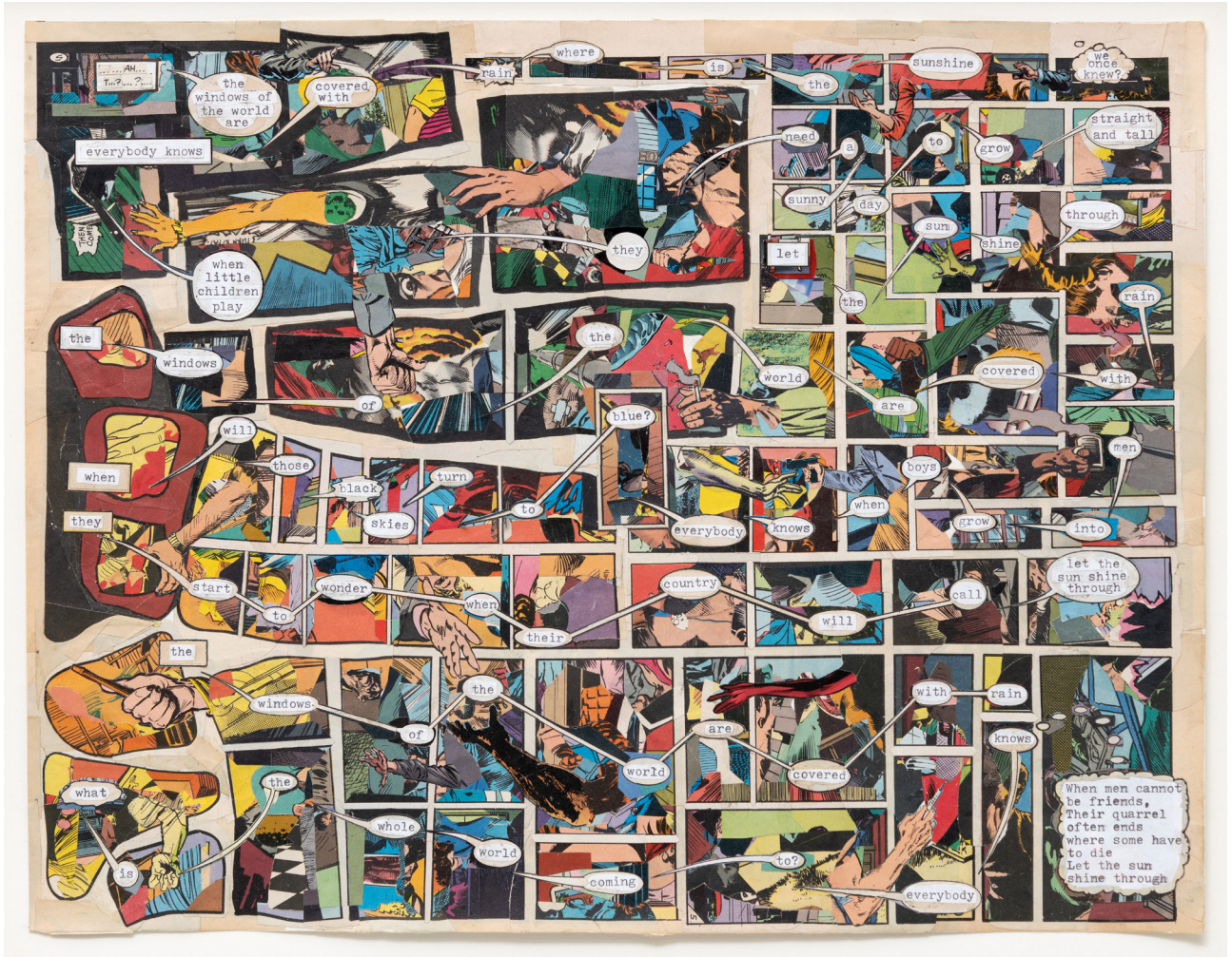
Generic Procedure, 2018 Dyptich of two collages 30 x 38 cm