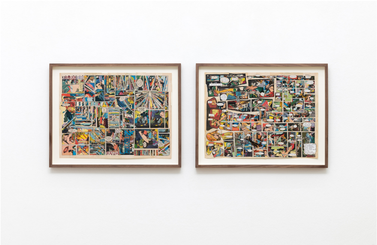
Nicht versöhnt, Generic Procedure, 2018 Dyptich of two collages Each 30 x 38 cm