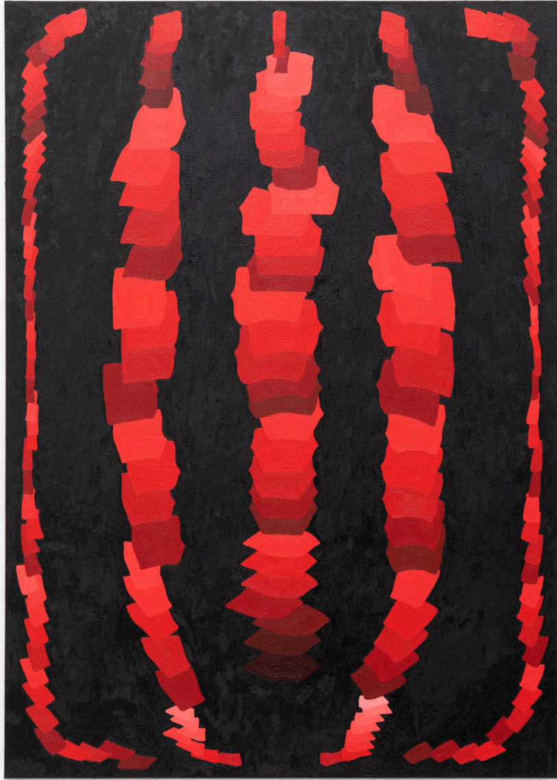
Red Carapace Scute Dispersion , 2020 Oil on canvas 140 x 100 cm