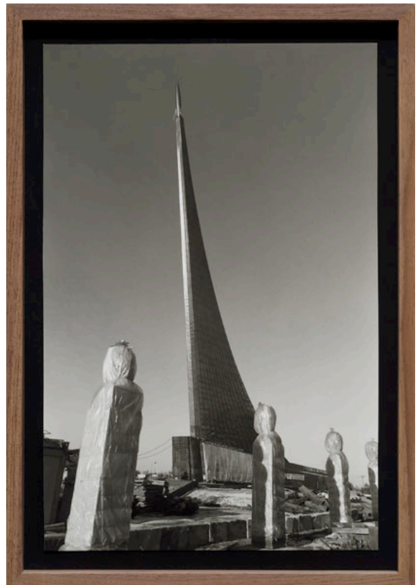
ALLEY OF COSMONAUTS, 2008, Gelatin silver fiber print 11 6/8 x 8 1/8 in / 29.7 x 21 cm

623 W 27 ST NYC 10001 USA +1 212 239 2758 info@foxyproduction.com www.foxyproduction.com