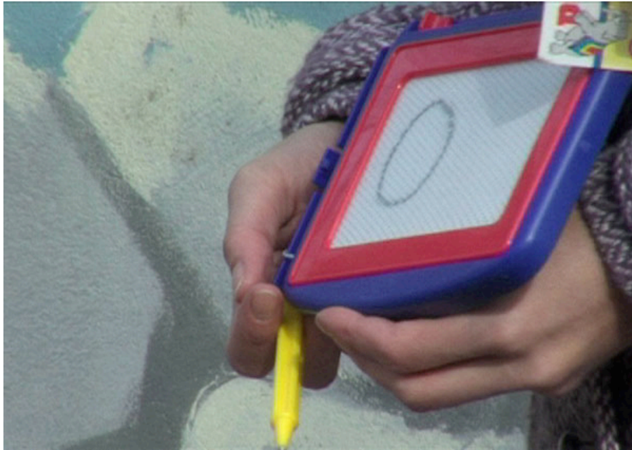
UNTITLED: DEDICATED TO SENGAI, 2008, Video, Dimensions variable 6:09 mins, Edition of 5 + 2AP