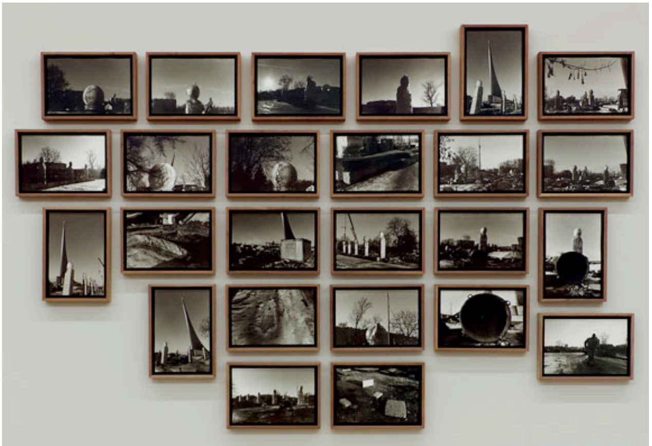
ALLEY OF COSMONAUTS, 2008, Installation view

623 W 27 ST NYC 10001 USA +1 212 239 2758 info@foxyproduction.com www.foxyproduction.com