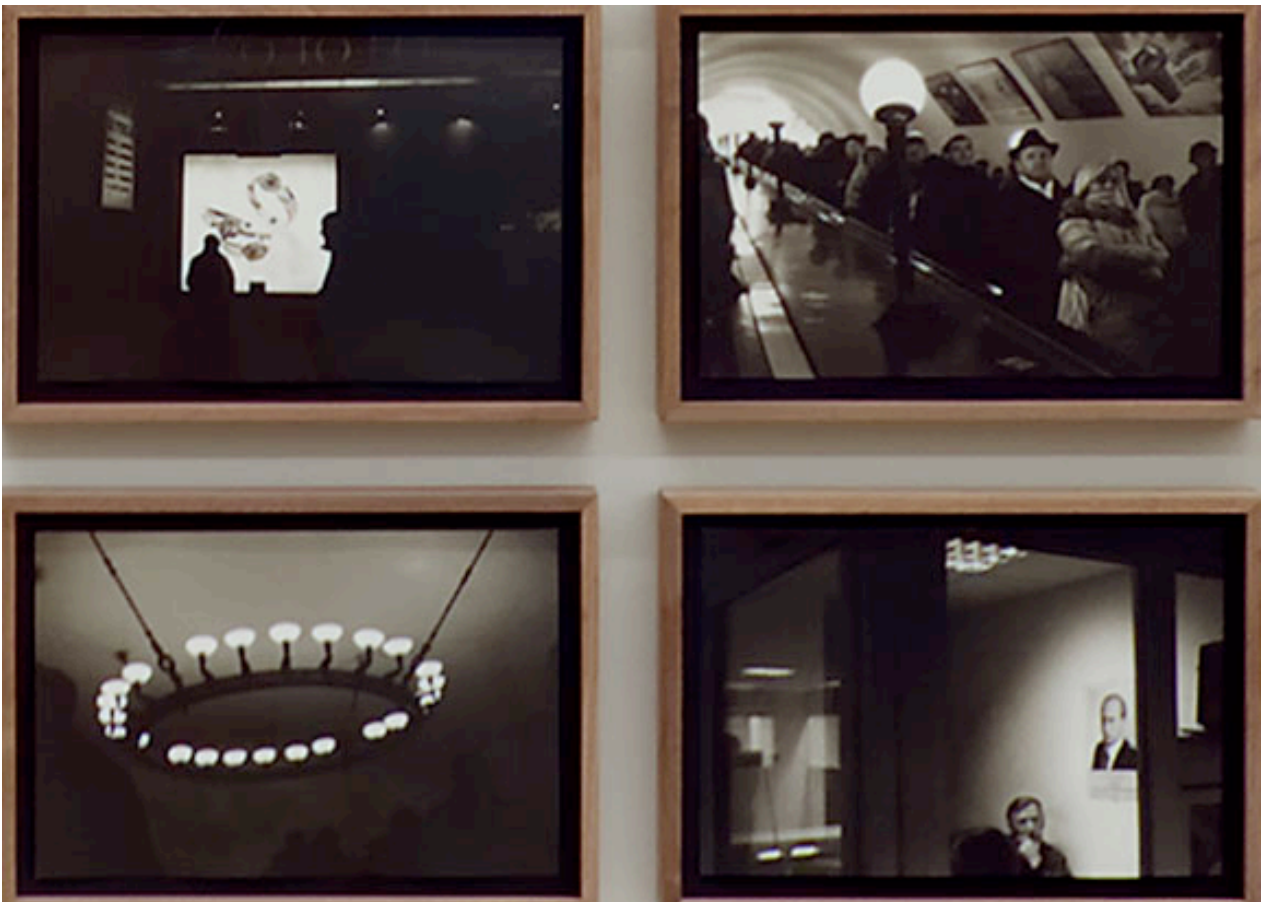
MOSCOW AREA, 2008, Installation detail

623 W 27 ST NYC 10001 USA +1 212 239 2758 info@foxyproduction.com www.foxyproduction.com