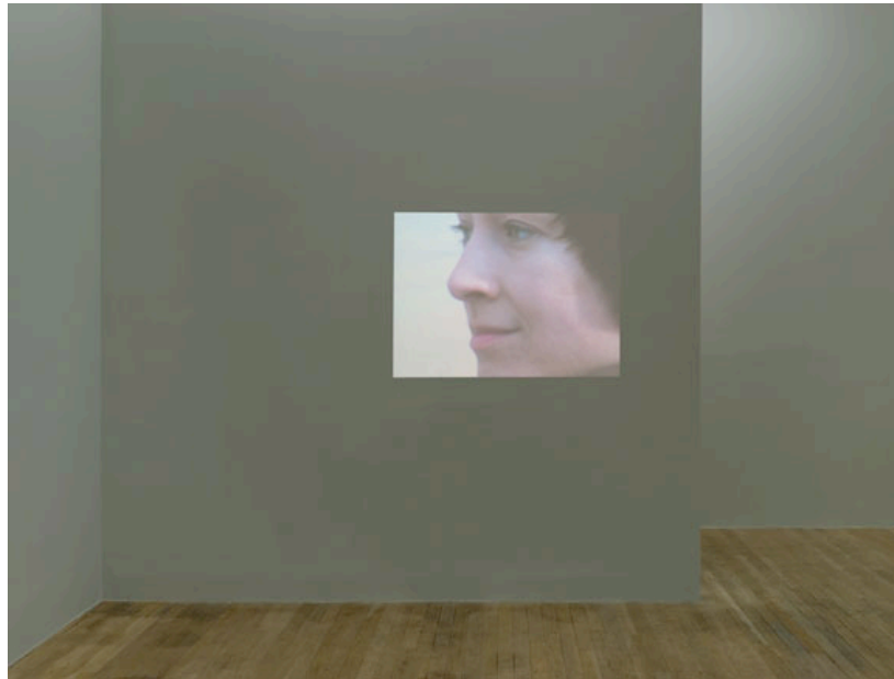
UNTITLED: DEDICATED TO SENGAI, 2008, Installation view

NEW WORK, September 9 - October 11, 2008