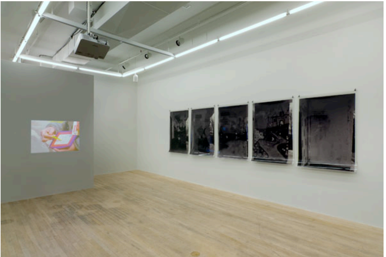
NEW WORK, 2008, Installation views

623 W 27 ST NYC 10001 USA +1 212 239 2758 info@foxyproduction.com www.foxyproduction.com