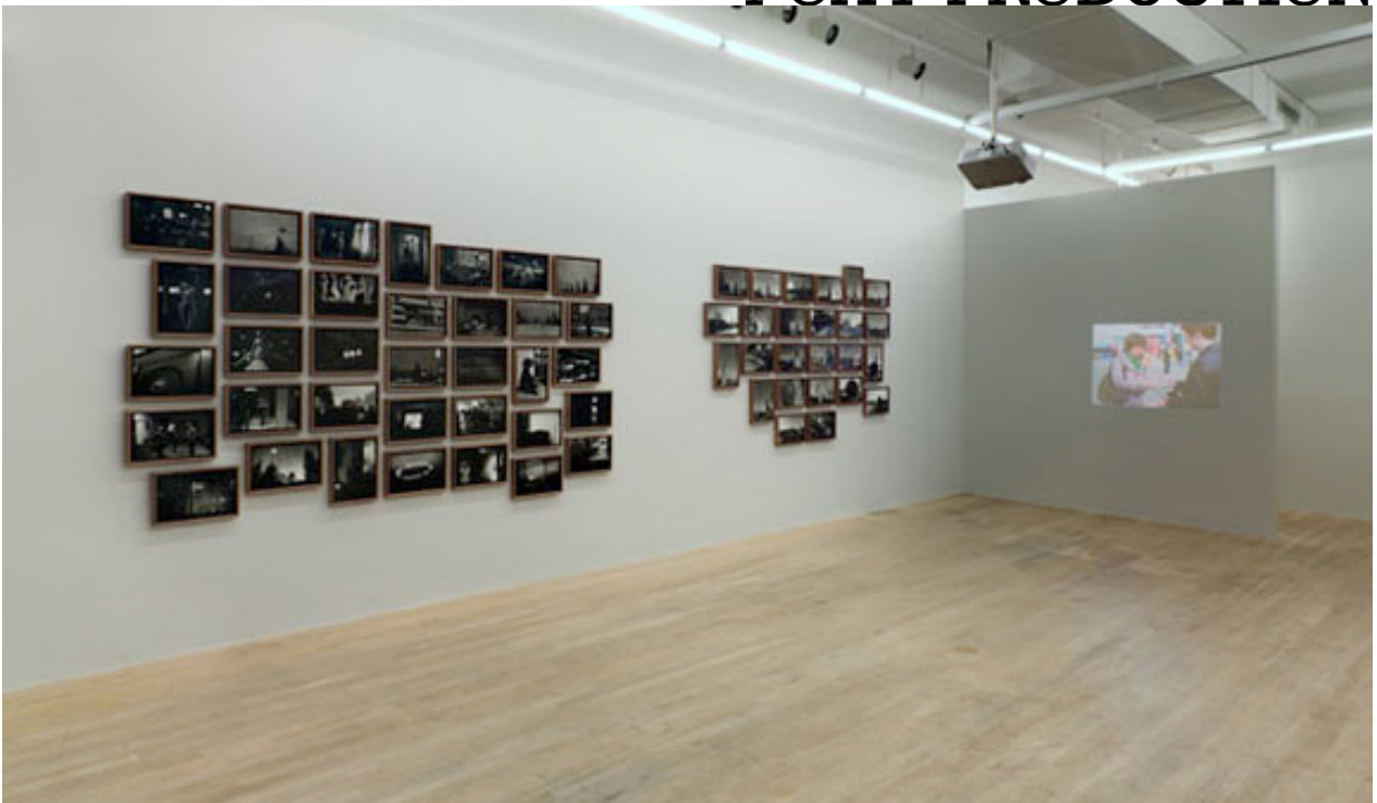
NEW WORK, 2008, Installation view