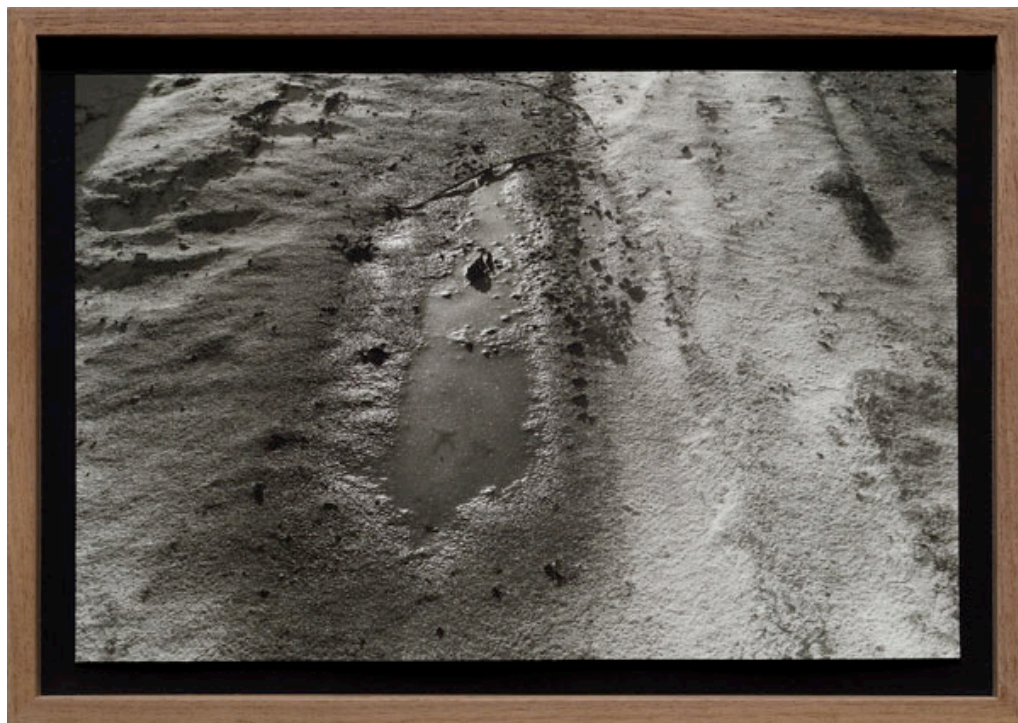
ALLEY OF COSMONAUTS, 2008, Gelatin silver fiber print 11 6/8 x 8 1/8 in / 29.7 x 21 cm