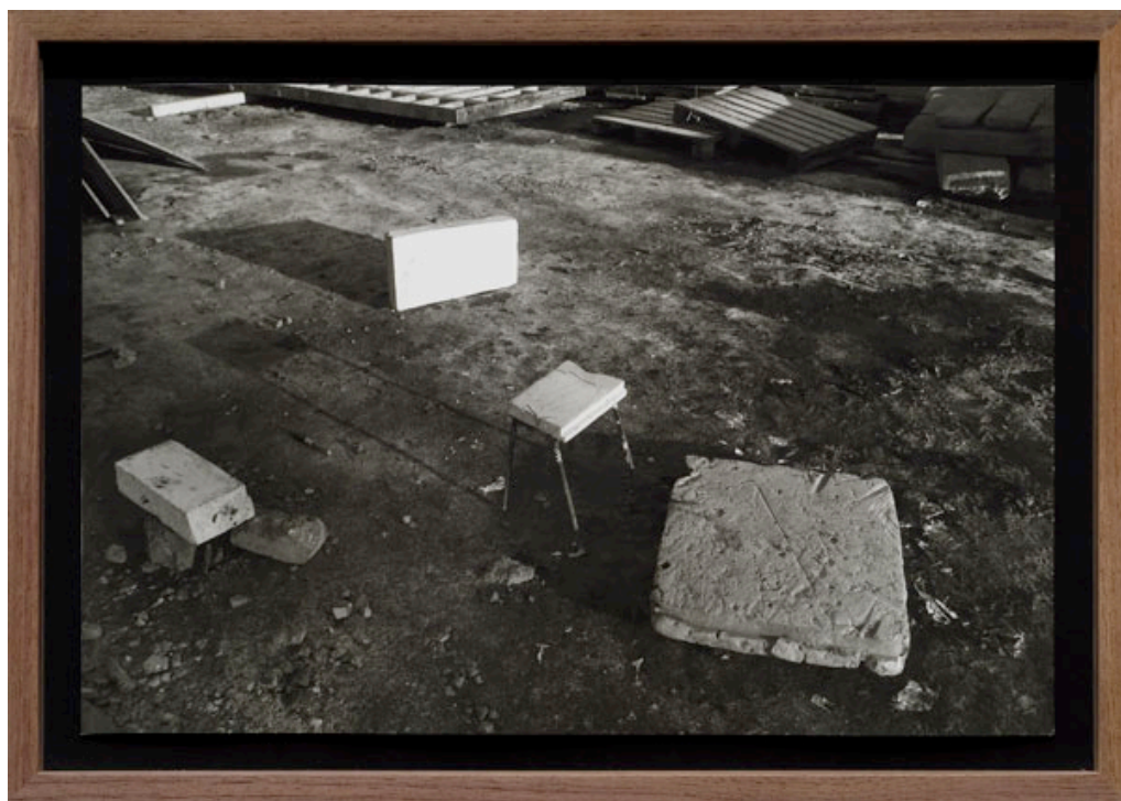
ALLEY OF COSMONAUTS, 2008, Gelatin silver fiber print 11 6/8 x 8 1/8 in / 29.7 x 21 cm

623 W 27 ST NYC 10001 USA +1 212 239 2758 info@foxyproduction.com www.foxyproduction.com