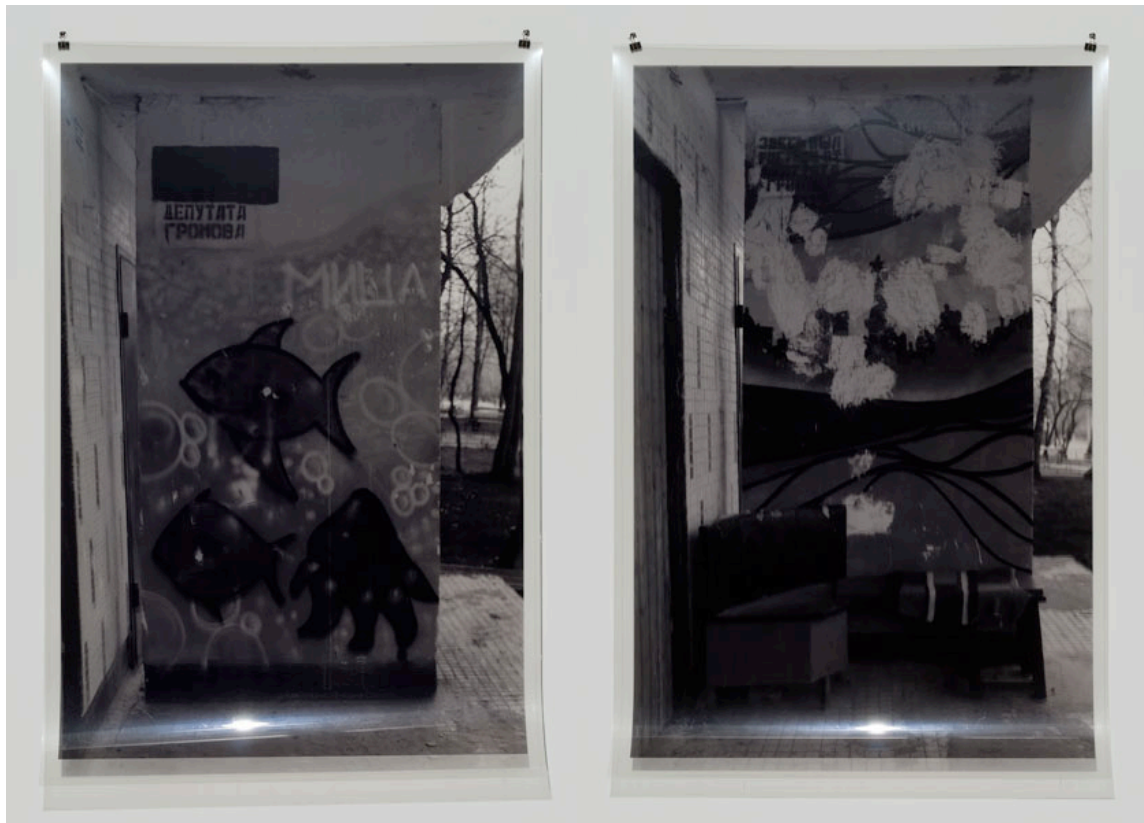
FROM THE DEPUTY, 2008, Duraclear print. 47 x 31 1/4 in/ 119.4 x 79.4 cm Edition of 5 + 2 AP

623 W 27 ST NYC 10001 USA +1 212 239 2758 info@foxyproduction.com www.foxyproduction.com