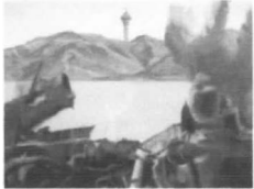
JIMMY BAKER REMOTE VIEWING STUDY (1980 EAGLE CLAW) 2010 Oil on canvas over panel 19 x 26 in. / 48.26 x 66.04 cm. JB-FP1530