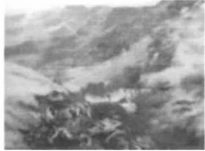
JIMMY BAKER, REMOTE VIEWING STUDY (1980 ZAIRE) 2010 Oil on canvas over panel, 19 x 26 in. / 48.26 x 66.04 cm. JB-FP1530