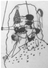
TOMOO GOKITA RIOT 2010 Acrylic enamel, spray paint 63.8 x 104 1/2 in. / 162 x 130.3 cm. TG-FP1533