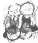
TOMOO GOKITA DRUNK 2010 Acrylic enamel, spray paint 63.8 x 63.8 in. / 162 x 162 cm. TG-FP1532