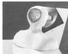
TG-FP1532 SASCHA BRAUNIG NO SOLUTIONS 2009 Oil on canvas over panel 24 x 30 in. / 61 x 76.2 cm. SB-FP1534