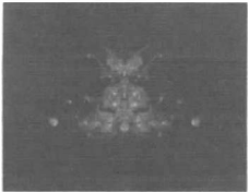
VIOLET HOPKINS INKBLOT 23 2010 Ink on paper 19 x 25 in. / 48.26 cm x 63.5 cm. VH-FP1517