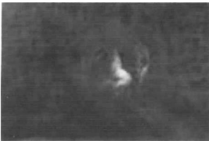
VIOLET HOPKINS THE TEMPLE OF HERMES AND APHRODITE Colored pencil and acrylic ink on archival paper 80 x 120 in. / 203.2 x 304.8 cm. VH-FP967