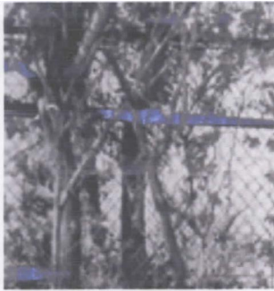
.ALLPAPER (FENCES), 2010 Laser photocopies Dimensions variable Edition of 3 + 2 AP EP-FP1 730