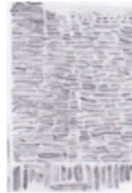
ORGANIZED FRIES, 2007-2010 Inkjet Ultrachrome archival print 41-3/4 X 29-1/2 in. (105.4 X 74.9 cm.) EP-FP1 708