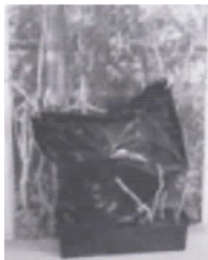
OVERCAST, 2010 Polyurethane and pigments 51 X 52 X 21 in (129.5 X 132.1 X 53 3 cm.) EP-FP1 728