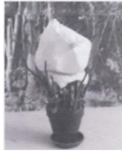
OVERCAST, 2010 Polyurethane and pigments 32 x 22 x 18 in. (81.3 x 55.9 x 45.7 cm.) EP-FP1720