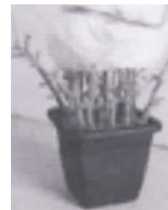
OVERCAST, 2010 Polyurethane and pigments 37 x 27 x 26 in. (94 x 68.6 x 66 cm.) EP-FP1721