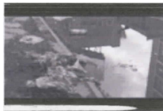
r::1-1051, 2009 Silent video loop, 1' 26" Edition of 3 + 2 AP EP-FP1715