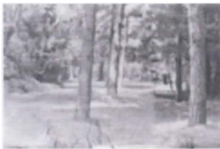
YOU ARE HERE (LIGHTBOX), 2006-2010 50 x 72 in. (127 x 182.9 cm.) Edition of 1 t 1 AP EP-FP1 714