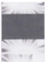
STUDIES IN MYSTICISM (RED SQUARE), 2010 Acrylic and graphite on paper 40 x 42-1/4 in. (101.6 x 106.7 cm.) EP-FP1707