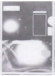
STUDIES ON MYSTICISM (BLUE STELLAR), 2010 Acrylic and graphite on paper 43-1/2 x 33-1/4 in. (110.5 x 84.5 cm.) EP-FP1710