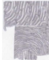
ORGANIZED FRIES, 2007-2010 Inkjet Ultrachrome archival print 35 x 29-1/2 in. (88.9 x 74.9 cm.) EP- FP1716