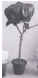
OVERCAST, 2010 Polyurethane and pigments 80 x 32 x 32 in. (203.2 x 81 EP-FP1 729

6 2 3 W 2 7 S T N Y C 1 0 0 0 1 U S A + 1 2 1 2 2 3 9 2 7 5 8 info@foxyproduction.com www.foxyproduction.com