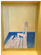
Untitled 15 x 20 in. pencil, watercolor 2011