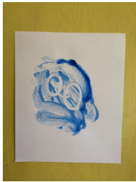
Christmas Cereal in January 2 20 x 16 in. monoprint, vinyl paint on paper 2014