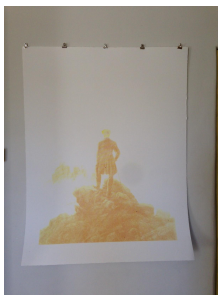
Wanderer Above the Sea Fog 37 1/3 x 29 1/2 in. screenprint (ed. of 5) 2010