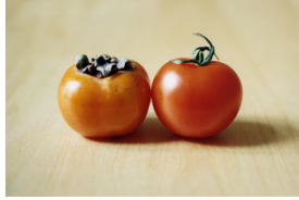
SHIMABUKU Kaki and Tomato, 2008 ( Caco e Pomodoro / Kaki und Tomate ) Private Collection © Shimabuku