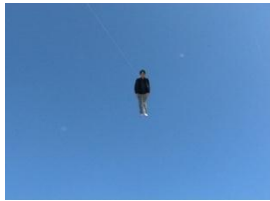
SHIMABUKU Flying Me, 2006 ( Io volante / Fliegendes Ich )