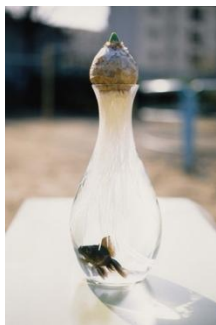
SHIMABUKU Symbiosis (hyacinth & black gold fish), 1992 ( Simbiosi (giacinto & pesce rosso nero) / Symbiose (Hyazinthe und schwarzer Goldfisch) )