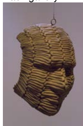
CHUR 2014/2015 Bronze 9 x 6 x 4 1/2 in. (22.86 x 15.24 x 11.43 cm.)