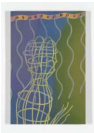
VALANCE 2014/2015 Oil on linen over panel 30 x 20 in. (76.20 x 50.80 cm.)