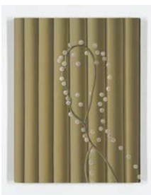
MARKER 2015 Oil on linen over panel 25 x 19 in. (63.50 x 48.26 cm.)