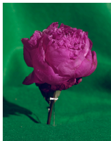
Flower , 2017 C-print mounted on Dibond 30 x 24 in. (76.2 x 60.96 cm.) Edition of 3 with 2 AP SC_FP3736