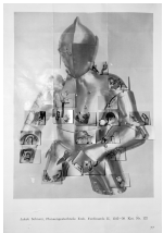
Armor (Jakob Schnatz, Plankengesteckteile Erz. Ferdinands II., 1545-50 Kat. Nr. 122), 2017 C-print mounted on Dibond 62 x 42 in. (157.48 x 106.68 cm.) Edition of 3 with 2 AP SC_FP3731