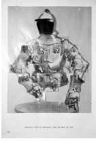
Armor (Sebastian Schmid, Harnash, 1550-60. Kat. Nr. 139), 2017 C-print mounted on Dibond 62 x 42 in. (157.48 x 106.68 cm.) Edition of 3 with 2 AP SC_FP3732