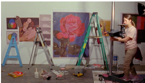
Rose Gold, 2017 16 mm film on video with sound 8 min. Edition of 3 with 2 AP SC_FP3743