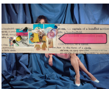
Tracy (One Hundred Consecutive Years) , 2017 Dye sublimation print on aluminum 30 x 38 in. (76.2 x 96.52 cm.) Edition of 3 with 2 AP SC_FP3742