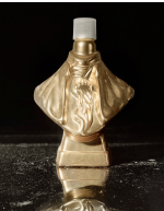
Avon Presidential Bust (Lincoln, Gold), 2017 C-print mounted on Dibond 30 x 24 in. (76.2 x 60.96 cm.) Edition of 3 with 2 AP SC_FP3735