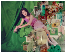
Tracy (Gold Circle), 2017 Dye sublimation print on aluminum 30 x 38 in. (76.2 x 96.52 cm.) Edition of 3 with 2 AP SC_FP3737