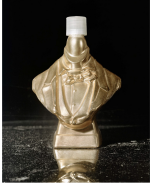
Avon Presidential Bust (Washington, Gold), 2017 C-print mounted on Dibond 30 x 24 in. (76.2 x 60.96 cm.) Edition of 3 with 2 AP SC_FP3733