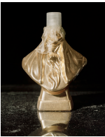
Avon Presidential Bust (Washington 2, Gold), 2017 C-print mounted on Dibond 30 x 24 in. (76.2 x 60.96 cm.) Edition of 3 with 2 AP SC_FP3734