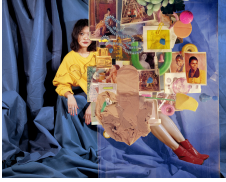
Tracy (Pantyhose), 2017 Dye sublimation print on aluminum 30 x 38 in. (76.2 x 96.52 cm.) Edition of 3 with 2 AP SC_FP3738