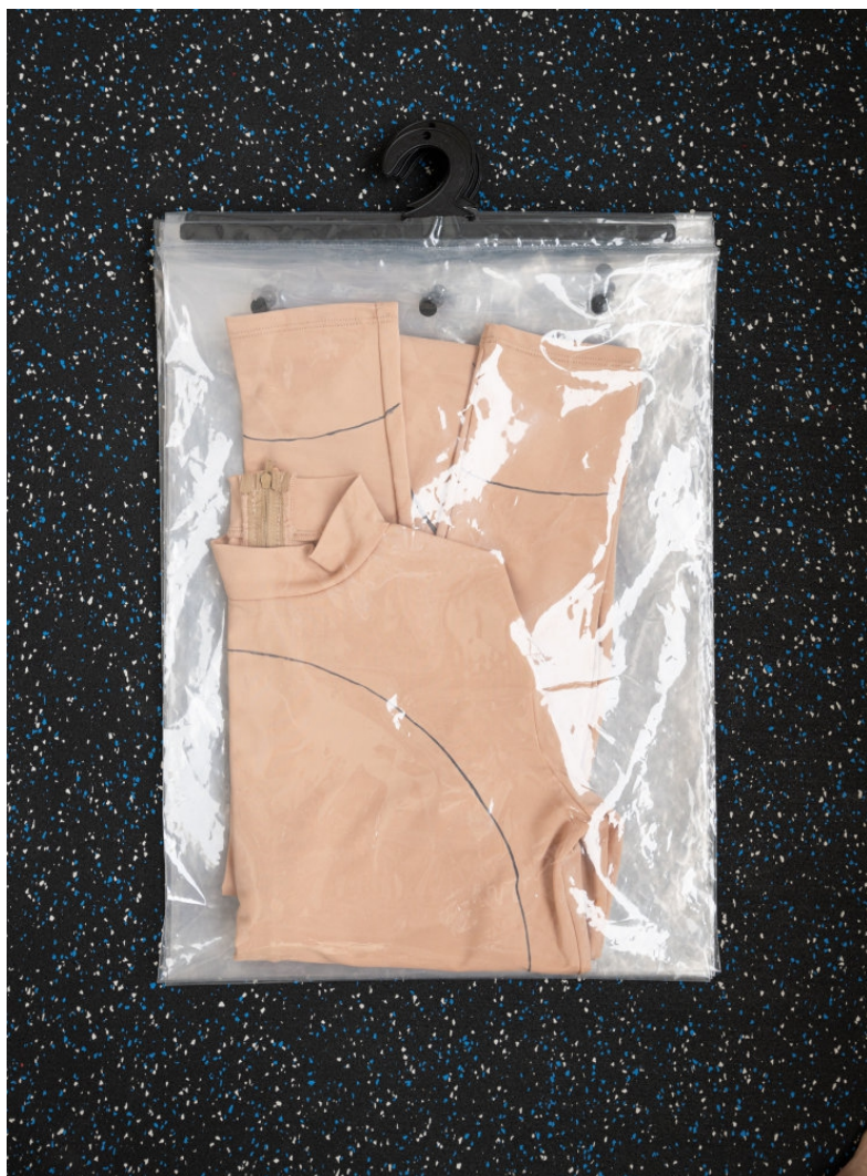
Amanda Ross-Ho NIP AND TUCK , 2023 Sharpie on Lycra Illusion, hanger bags 22 x 14 1/2 x 1 1/2 inches