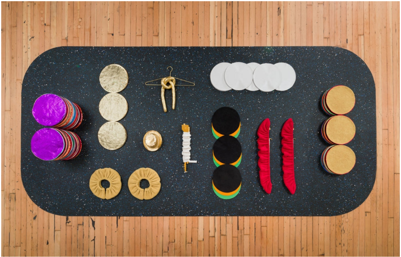
Amanda Ross-Ho OFF ICE JUMP , 2023 Recycled industrial rubber flooring 200 1/2 x 8 1/2 x 1/2 inches