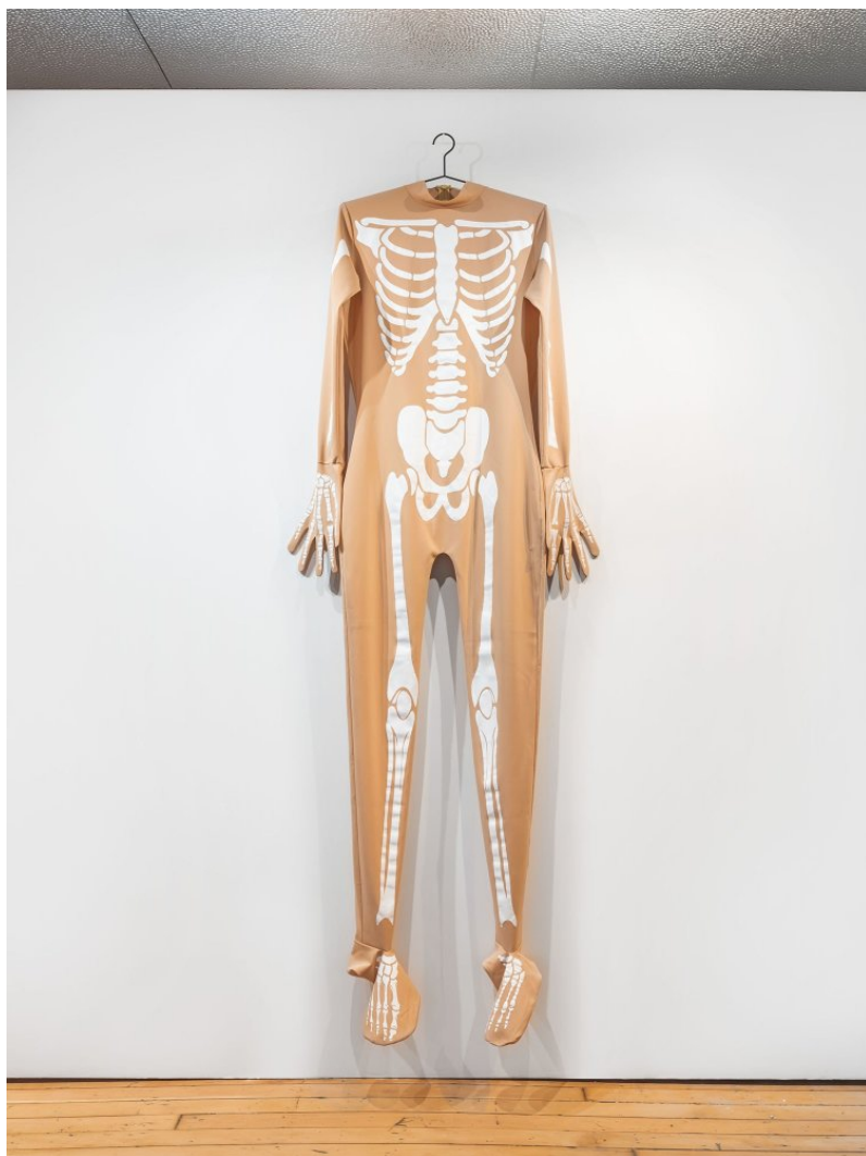
Amanda Ross-Ho SKIN AND BONES , 2023 Screenprint on Lycra Illusion, zipper, patinated steel 114 1/2 x 42 1/2 x 5 3/4 inches (STC) Edition 1 of 3