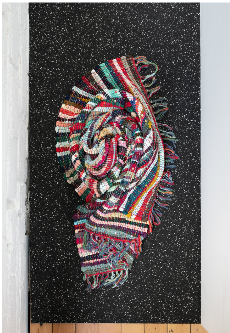
Amanda Ross-Ho RAG RUG VORTEX , 2023 Rag rug, vintage sequins, straight pins 32 3/4 x 17 x 7 inches