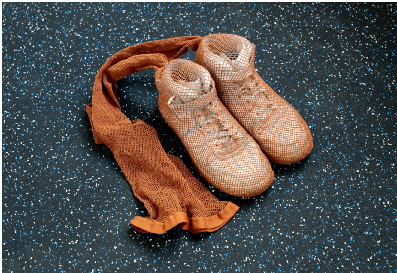
Amanda Ross-Ho BOOT COVERS , 2023 Capezio Professional Fishnet Seamless Tight (Toasted Almond), Air Force Ones 22 x 14 x 1 1/2 inches