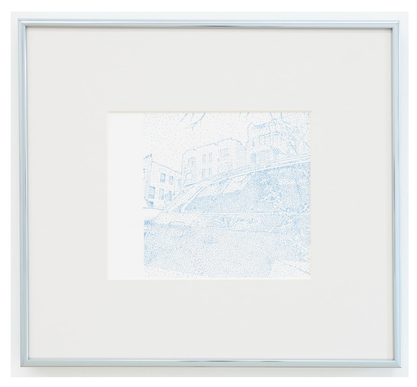
\textit{Untitled}, 2023 \ | \ \text{Pen on paper in artist frame} \ | \ 5.7 \ \text{in} \ x \ 6.9 \ \text{in} \ (12 \ \text{in} \ x \ 13.25 \ \text{in} \ \text{w/frame})