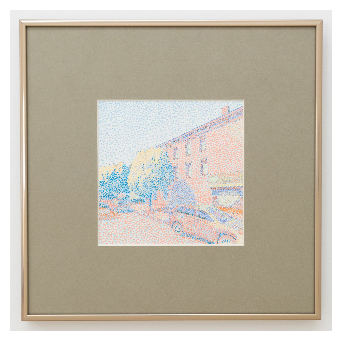
\textit{Untitled}, 2023 \mid Marker \ and \ pen \ on \ paper \ in \ artist \ frame \ | \ 5.6 \ in \ x \ 5.6 \ in \ (12 \ in \ x \ 12 \ in \ w/frame)