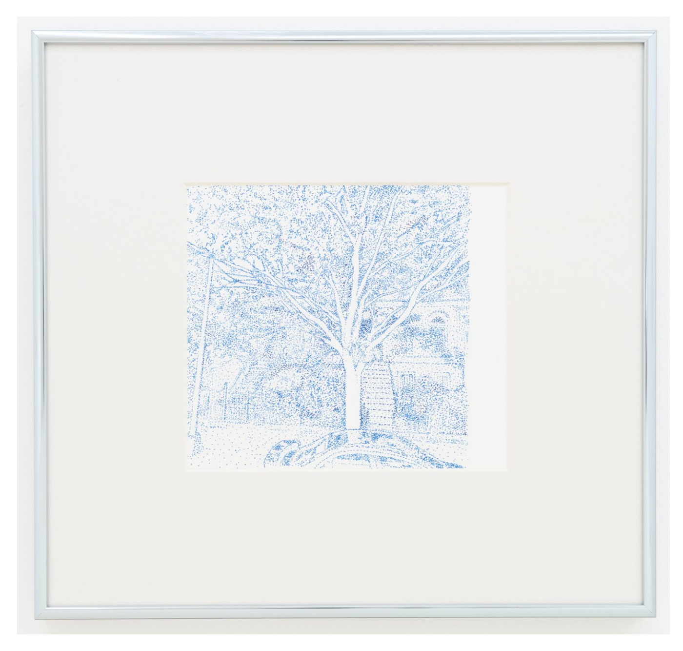
\textit{Untitled}, 2023 \mid \text{Pen on paper in artist frame} \mid 5.75 \text{ in x } 6.5 \text{ in } (12 \text{ in x } 12.9 \text{ in w/frame})