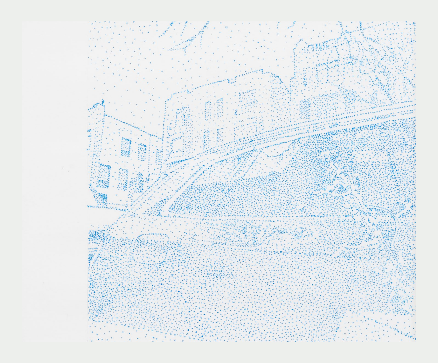
\textit{Untitled}, 2023 \; (\text{detail}) \; | \; \text{Pen on paper in artist frame} \; | \; 5.7 \; \text{in x 6.9 in} \; (12 \; \text{in x 13.25 in w/frame})