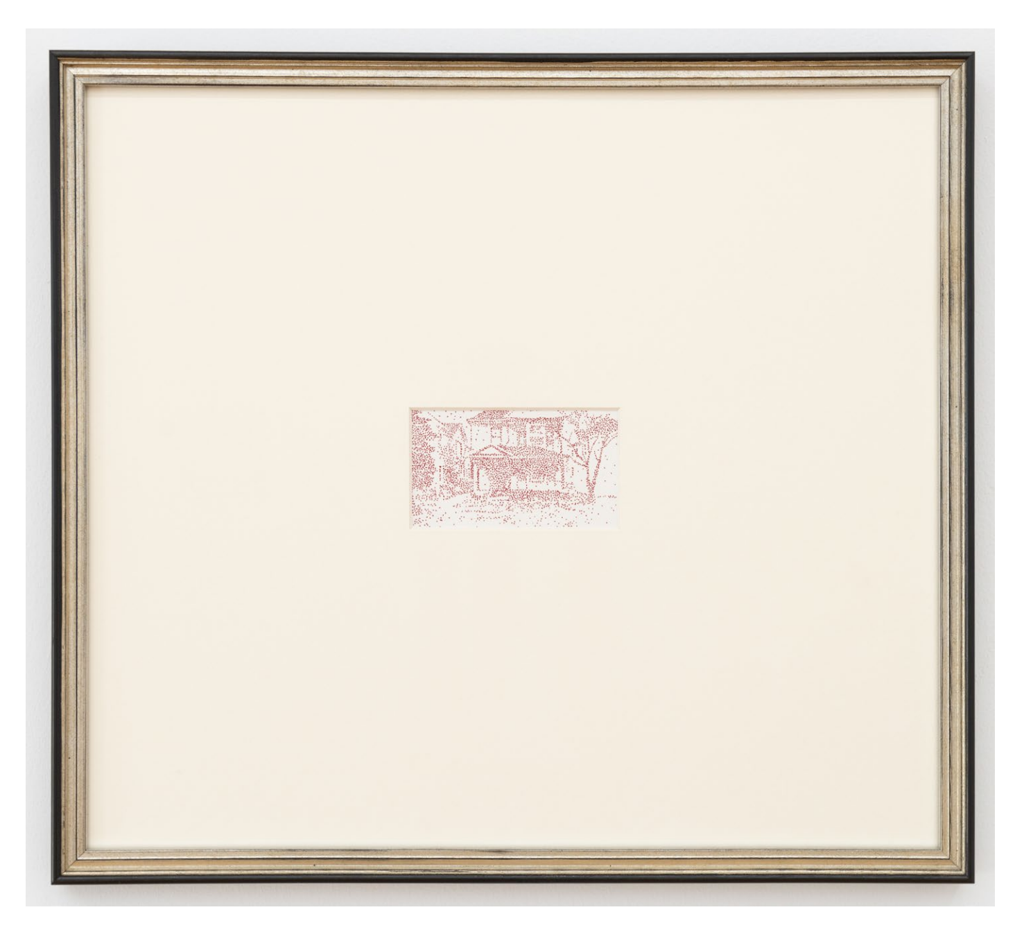
\textit{Untitled}, 2023 \mid Pen \ on \ paper \ in \ artist \ frame \mid 2 \ in \ x \ 3.7 \ in \ (15 \ in \ x \ 16.6 \ w/frame)