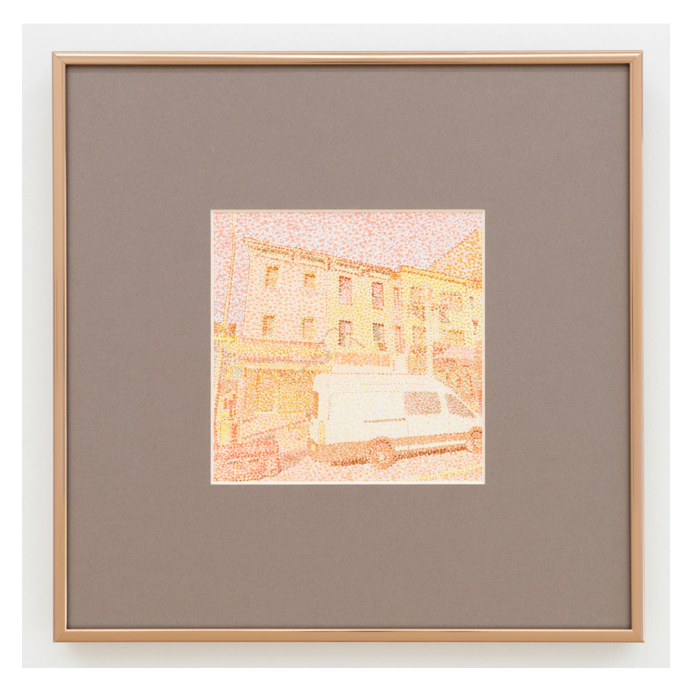
Untitled, 2023 | Marker and pen on paper in artist frame | 5.2 in x 5.2 in (11.5 in x 11.5 in w/frame)