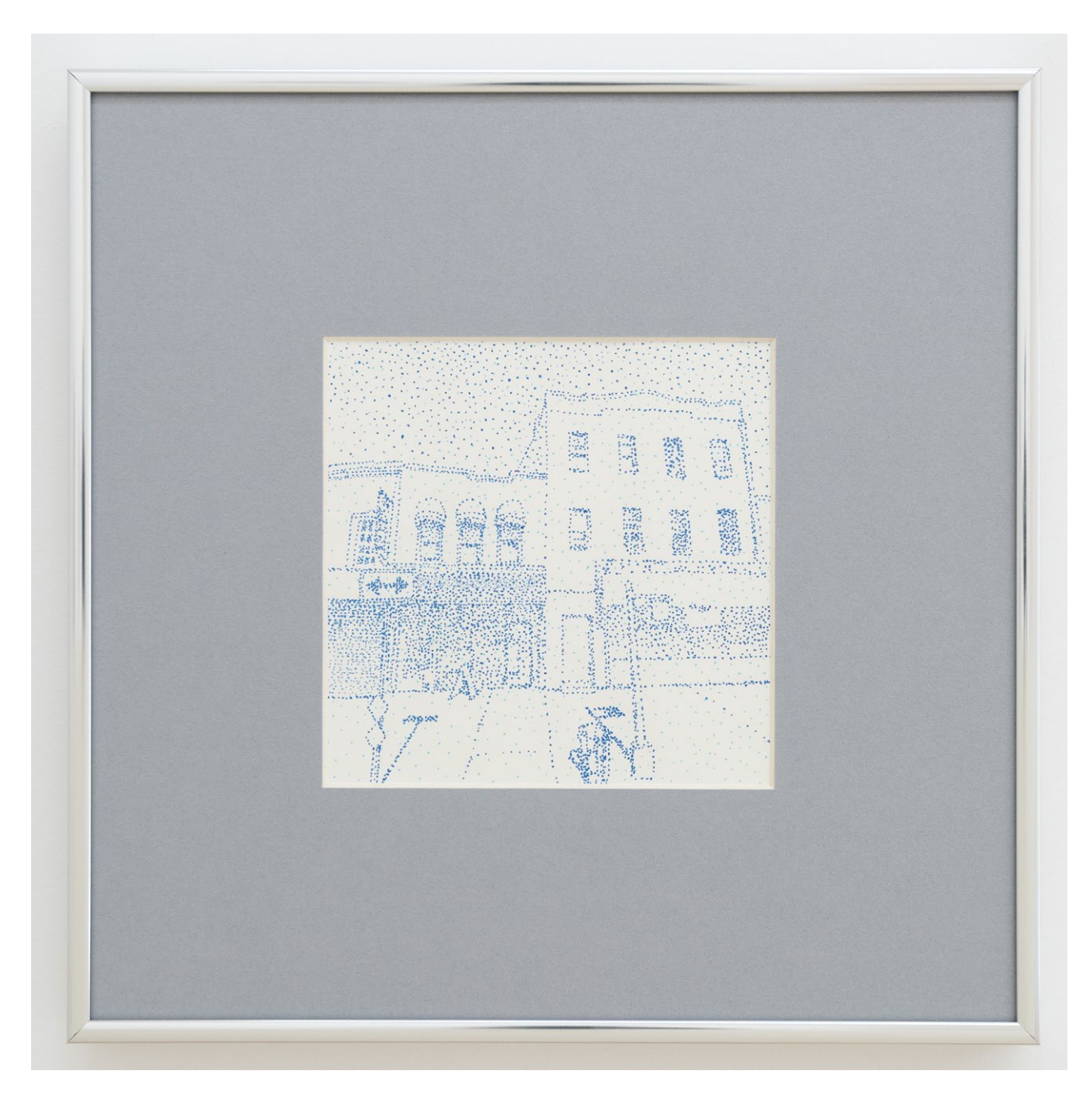
\textit{Untitled}, 2023 \mid Pen \ on \ paper \ in \ artist \ frame \mid 5.2 \ in \ x \ 5.2 \ in \ (11.5 \ in \ x \ 11.5 \ in \ w/frame)