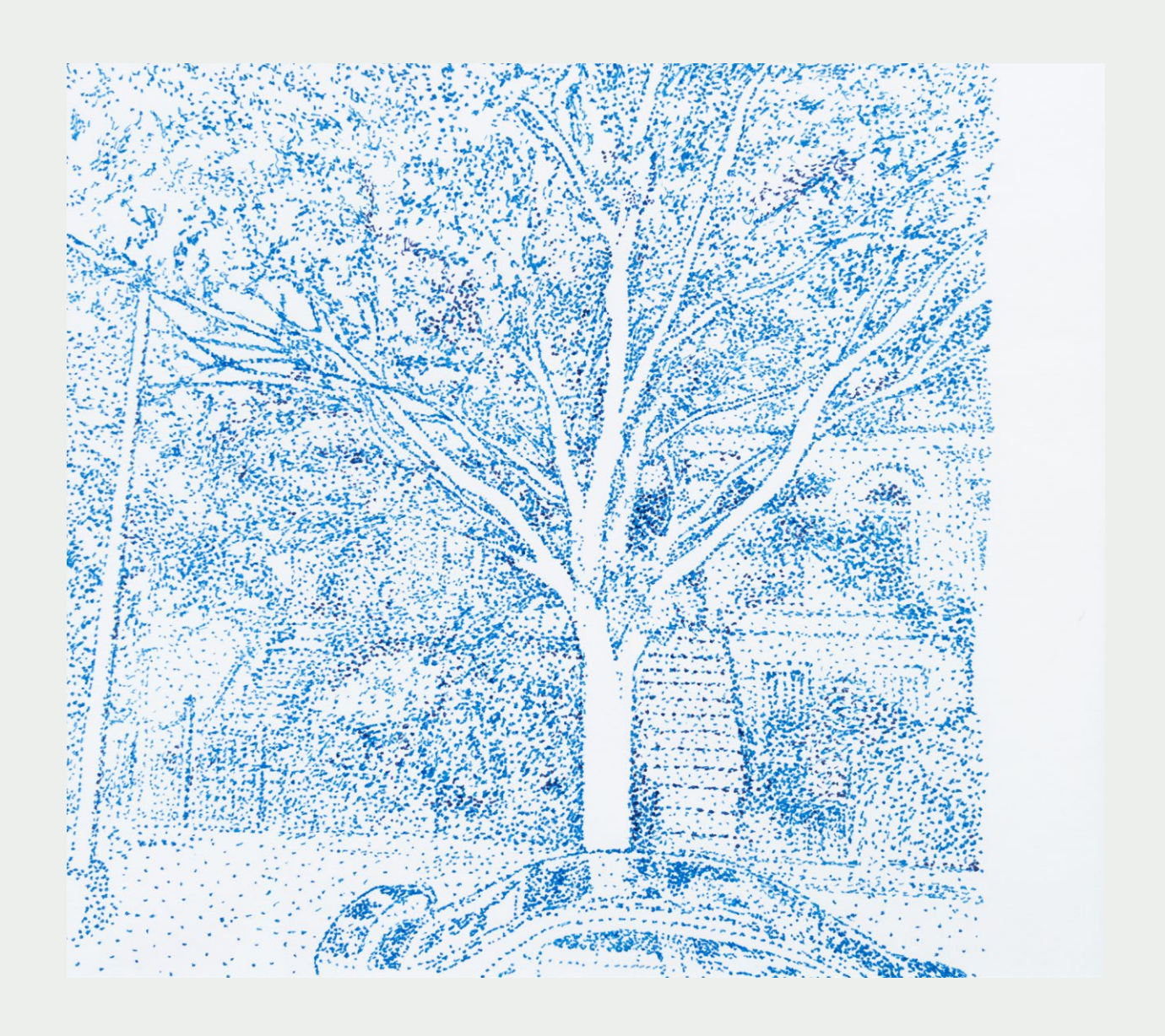
\textit{Untitled},\, 2023 \; (\text{detail}) \; | \; \text{Pen on paper in artist frame} \; | \; 5.75 \; \text{in x 6.5 in} \; (12 \; \text{in x 12.9 in w/frame})