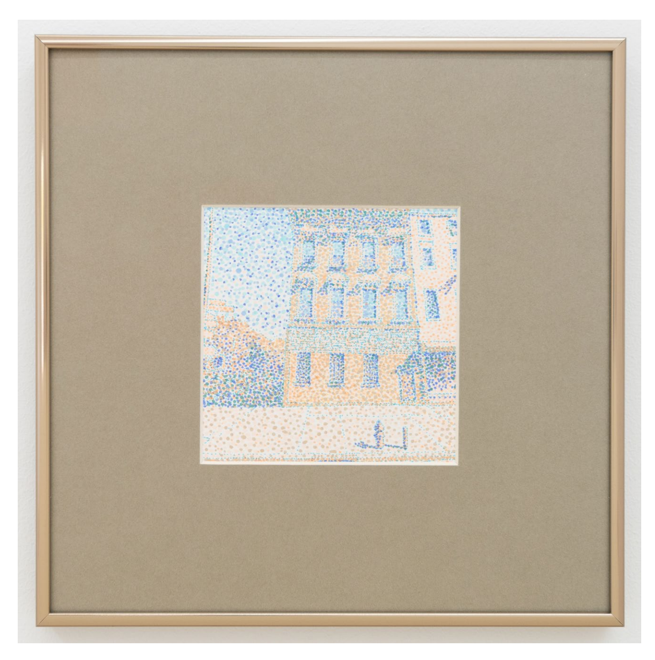
\textit{Untitled}, 2023 \mid Marker \ and \ pen \ on \ paper \ in \ artist \ frame \ | \ 4.6 \ in \ x \ 4.6 \ in \ (11 \ in \ x \ 11 \ in \ w/frame)