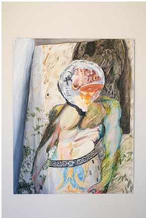
Flan Casero, 2015 Acrylic, color pencil on steel 17 x 22 inches

For more information and images, please contact galler@fullhaus.biz