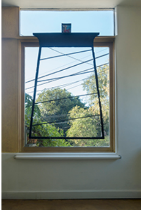
Trajan's Column, 2015 Anodized aluminum and laser jet print 36 x 59 x 4 inches