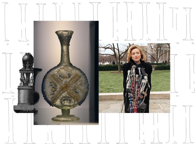
Roman Glass, 2015 UV cured print on steel 22 x 17 inches