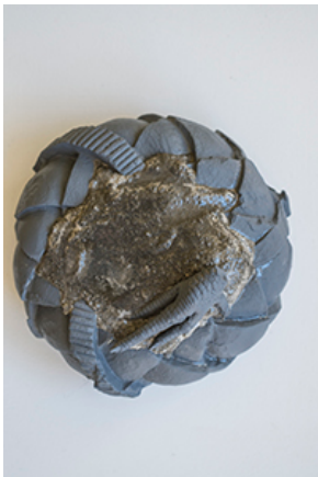
Untitled (I have an announcement) 2, 2015 Aluminum, primer, stucco cement 7 x 3.5 x 7 inches