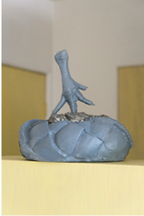
Untitled (I have an announcement) 1, 2015 Aluminum, primer, stucco cement, plaster 7 x 7 x 7 inches