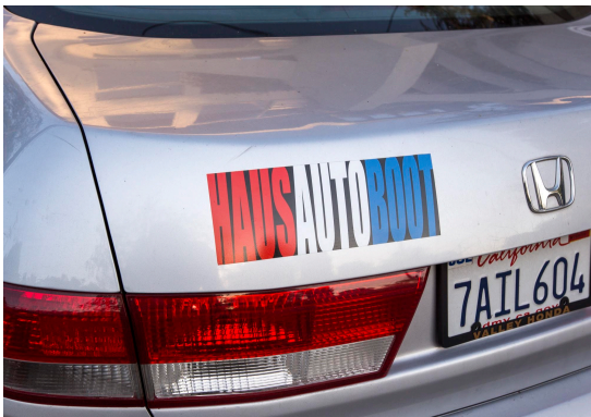
Haus Auto Boot , 2015 Digital print on vinyl 3 4/5 x 11 1/2 inches Edition of 100

For more information and images, please contact gallery@fullhaus.biz