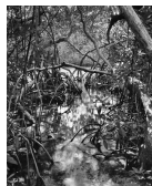
mangillo, 2023 digital silver gelatin print 20 × 16 in (50.80 × 40.64 cm) 20 \frac{3}{8} × 16 \frac{3}{8} × 1 \frac{1}{2} in (51.75 × 41.59 × 3.81 cm) (framed) Edition of 5 plus II AP