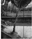
flood plantain , 2023 digital silver gelatin print 20 x 16 in (50.80 x 40.64 cm) 20 \frac{3}{8} x 16 \frac{3}{8} x 1 \frac{1}{2} in (51.75 x 41.59 x 3.81 cm) (framed) Edition of 5 plus II AP