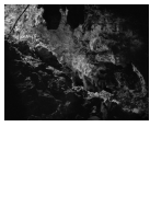
cueva, 2023 digital silver gelatin print 16 x 20 in (40.64 x 50.80 cm) 16 \frac{3}{8} x 20 \frac{3}{8} x 1 \frac{1}{2} in (41.59 x 51.75 x 3.81 cm) (framed) Edition of 5 plus II AP