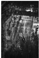
dining shed at night II, 2023 digital silver gelatin print 27 x 18 in (68.58 x 45.72 cm) 27 \frac{3}{8} x 18 \frac{3}{8} x 1 \frac{1}{2} in (69.53 x 46.67 x 3.81 cm) (framed) Edition of 5 plus II AP