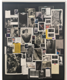
guabancex II , 2023 mixed media 87 \frac{5}{8} x 70 \frac{1}{8} x 3 in (222.57 x 178.12 x 7.62 cm) (framed)