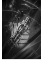
park trash bag, 2023 digital silver gelatin print 39 × 26 in (99.06 × 66.04 cm) 39 \frac{3}{8} × 26 \frac{3}{8} × 1 \frac{1}{2} in (100.01 × 66.99 × 3.81 cm) (framed) Edition of 5 plus II AP