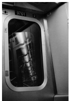
subway window , 2023 digital silver gelatin print 39 x 26 in (99.06 x 66.04 cm) 39 \frac{3}{8} x 26 \frac{3}{8} x 1 \frac{1}{2} in (100.01 x 66.99 x 3.81 cm) (framed) Edition of 5 plus II AP