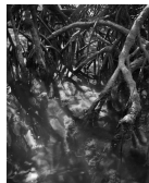
mangillo water, 2023 digital silver gelatin print 20 × 16 in (50.80 × 40.64 cm) 20 \frac{3}{8} × 16 \frac{3}{8} × 1 \frac{1}{2} in (51.75 × 41.59 × 3.81 cm) (framed) Edition of 5 plus II AP