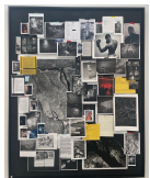
guabancex III , 2023 mixed media 87 \frac{5}{8} x 70 \frac{1}{8} x 3 in (222.57 x 178.12 x 7.62 cm) (framed)