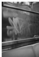
subway removal, 2023 digital silver gelatin print 27 × 18 in (68.58 × 45.72 cm) 27 \frac{3}{8} × 18 \frac{3}{8} × 1 \frac{1}{2} in (69.53 × 46.67 × 3.81 cm) (framed) Edition of 5 plus II AP