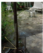
amalia's backyard, 2023 archival pigment print 20 x 16 in (50.80 x 40.64 cm) 20 \frac{3}{8} x 16 \frac{3}{8} x 1 \frac{1}{2} in (51.75 x 41.59 x 3.81 cm) (framed) Edition of 5 plus II AP