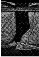
street night fence, 2023 digital silver gelatin print 27 x 18 in (68.58 x 45.72 cm) 27 \frac{3}{8} x 18 \frac{3}{8} x 1 \frac{1}{2} in (69.53 x 46.67 x 3.81 cm) (framed) Edition of 5 plus II AP