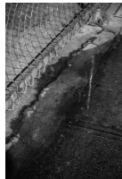
flood sidewalk shore, 2023 digital silver gelatin print 27 × 18 in (68.58 × 45.72 cm) 27 \frac{3}{8} × 18 \frac{3}{8} × 1 \frac{1}{2} in (69.53 × 46.67 × 3.81 cm) (framed) Edition of 5 plus II AP