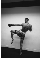
john shadowboxing II, 2023 digital silver gelatin print 27 x 18 in (68.58 x 45.72 cm) 27 \frac{3}{8} x 18 \frac{3}{8} x 1 \frac{1}{2} in (69.53 x 46.67 x 3.81 cm) (framed) Edition of 5 plus II AP