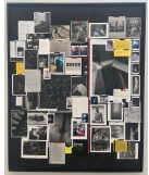
guabancex I , 2023 mixed media 87 \frac{5}{8} x 70 \frac{1}{8} x 3 in (222.57 x 178.12 x 7.62 cm) (framed)