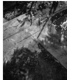
flood ground, 2023 digital silver gelatin print 20 × 16 in (50.80 × 40.64 cm) 20 \frac{3}{8} × 16 \frac{3}{8} × 1 \frac{1}{2} in (51.75 × 41.59 × 3.81 cm) (framed) Edition of 5 plus II AP