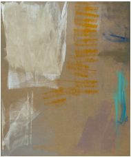
Maude , 2023, acrylic on linen, 280 x 230 cm