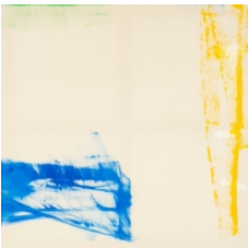
Maude , 2023, acrylic on cotton, 150 x 150 cm