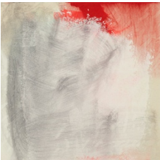
Maude , 2023, acrylic on cotton, 60 x 60 cm