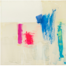
Maude , 2023, acrylic on cotton, 280 x 280 cm