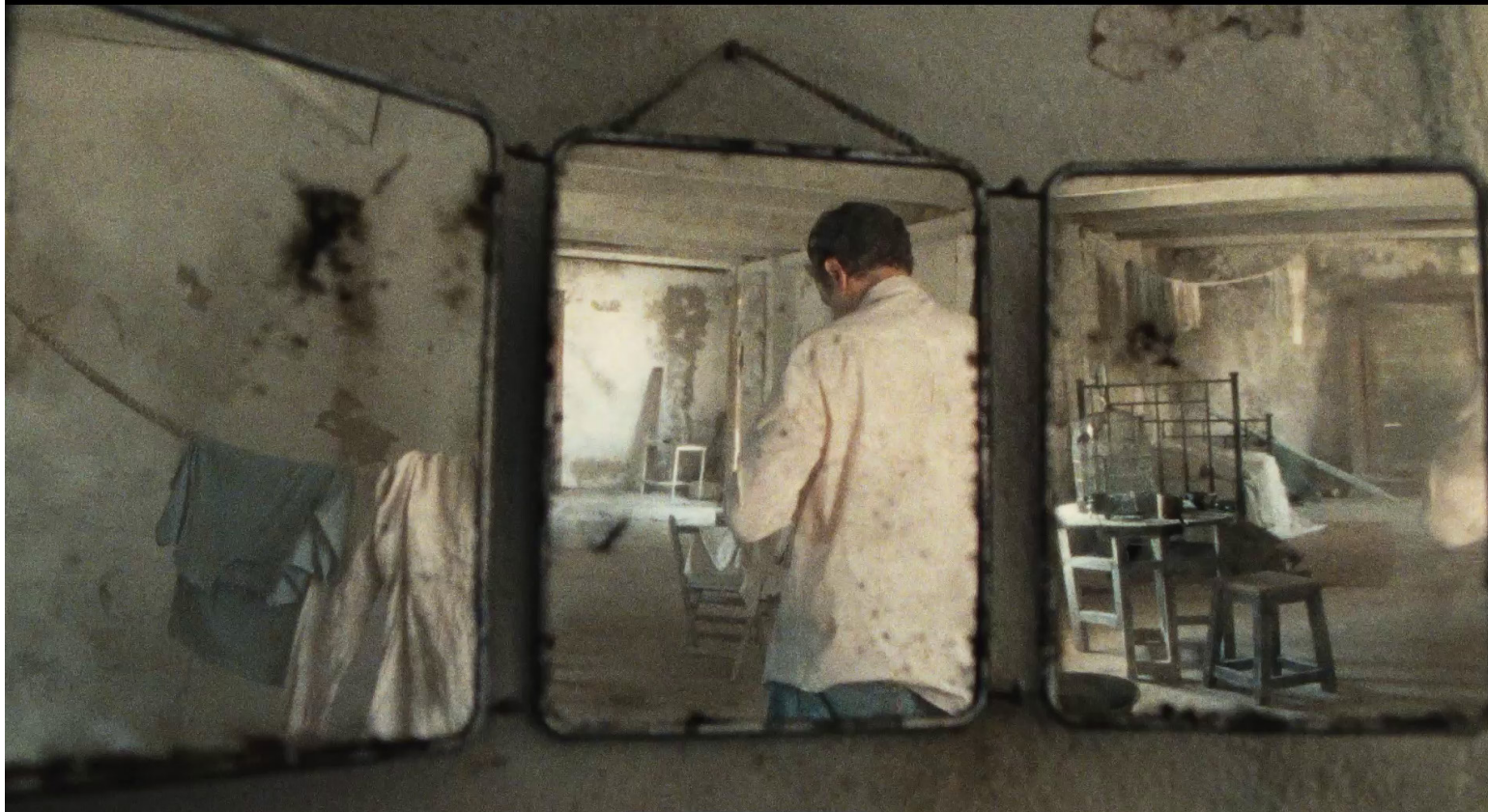
Pharmakon, 2022, Still film