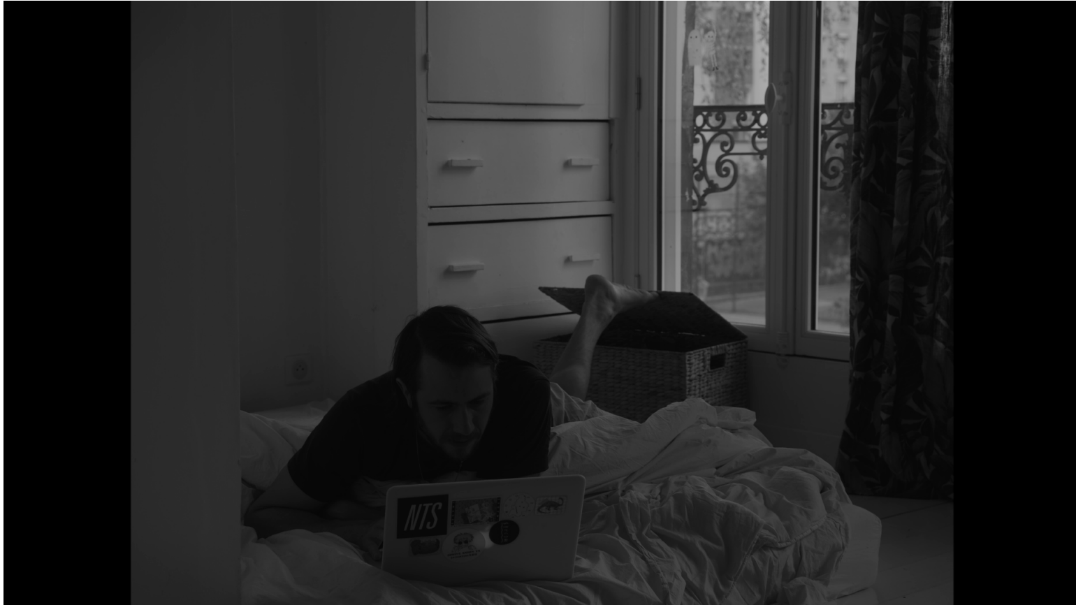
People, 2020, Still film