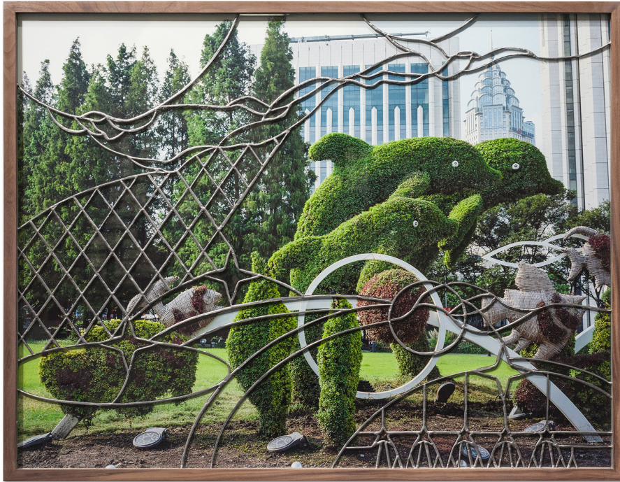
Peng Ke, Dolphins (disappeared) , 2019–2021 Archival inkjet print, tin, glass, walnut frame 73 x 91 cm