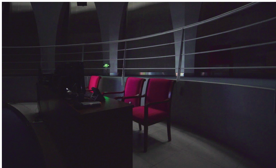
Geocinema, Umbra , 2021, documentary film HD, 39 min screenshot

basis e.V. Gutleutstrasse 8–12 60 329 Frankfurt