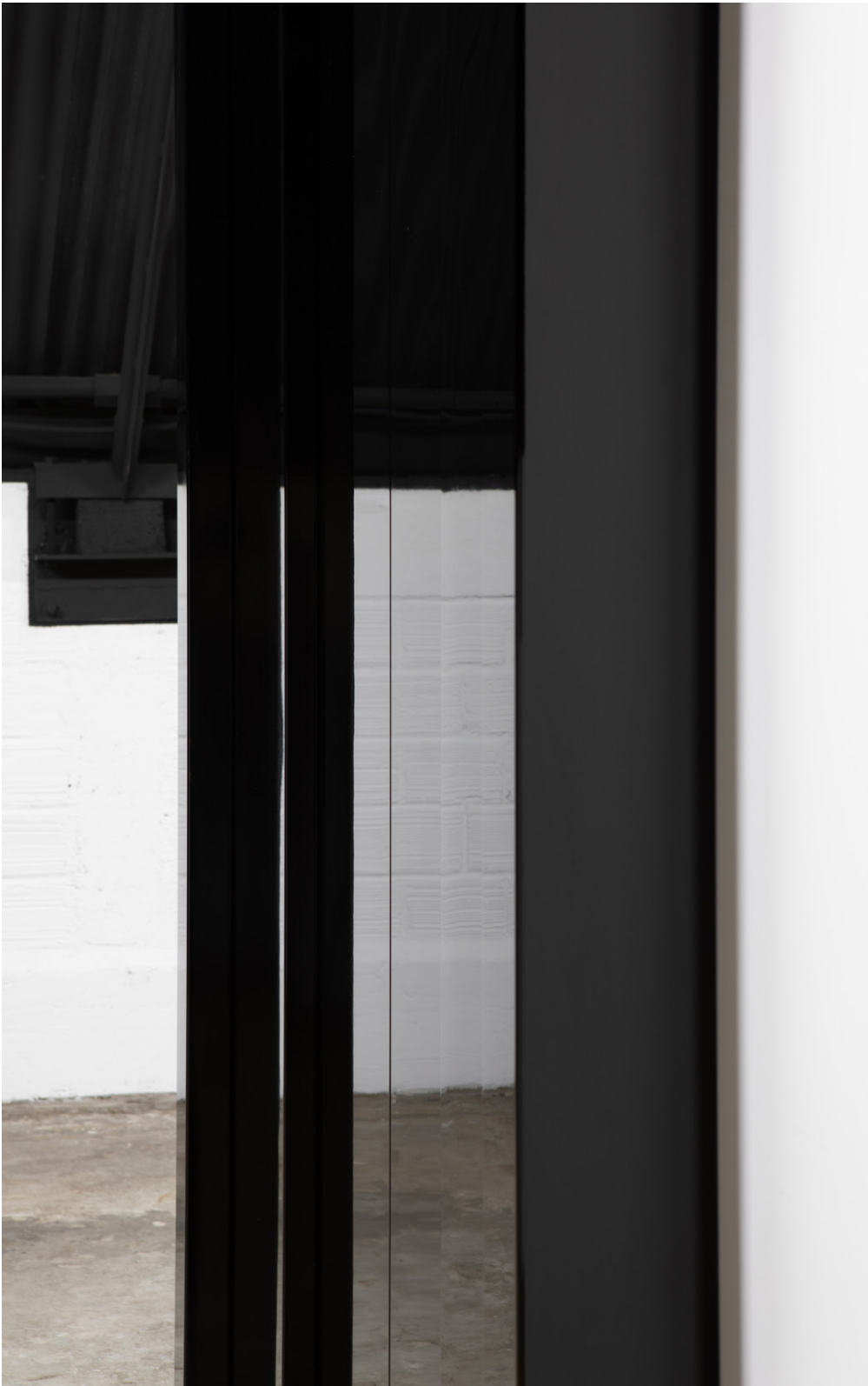
Gabriele Garavaglia Hell Door , 2023 (detail) Wood, steel, 2K lacquer 250 x 180 x 20 cm