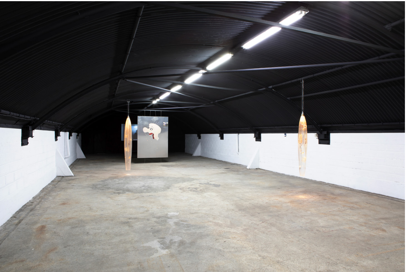
Watch Me Fall Exhibition view