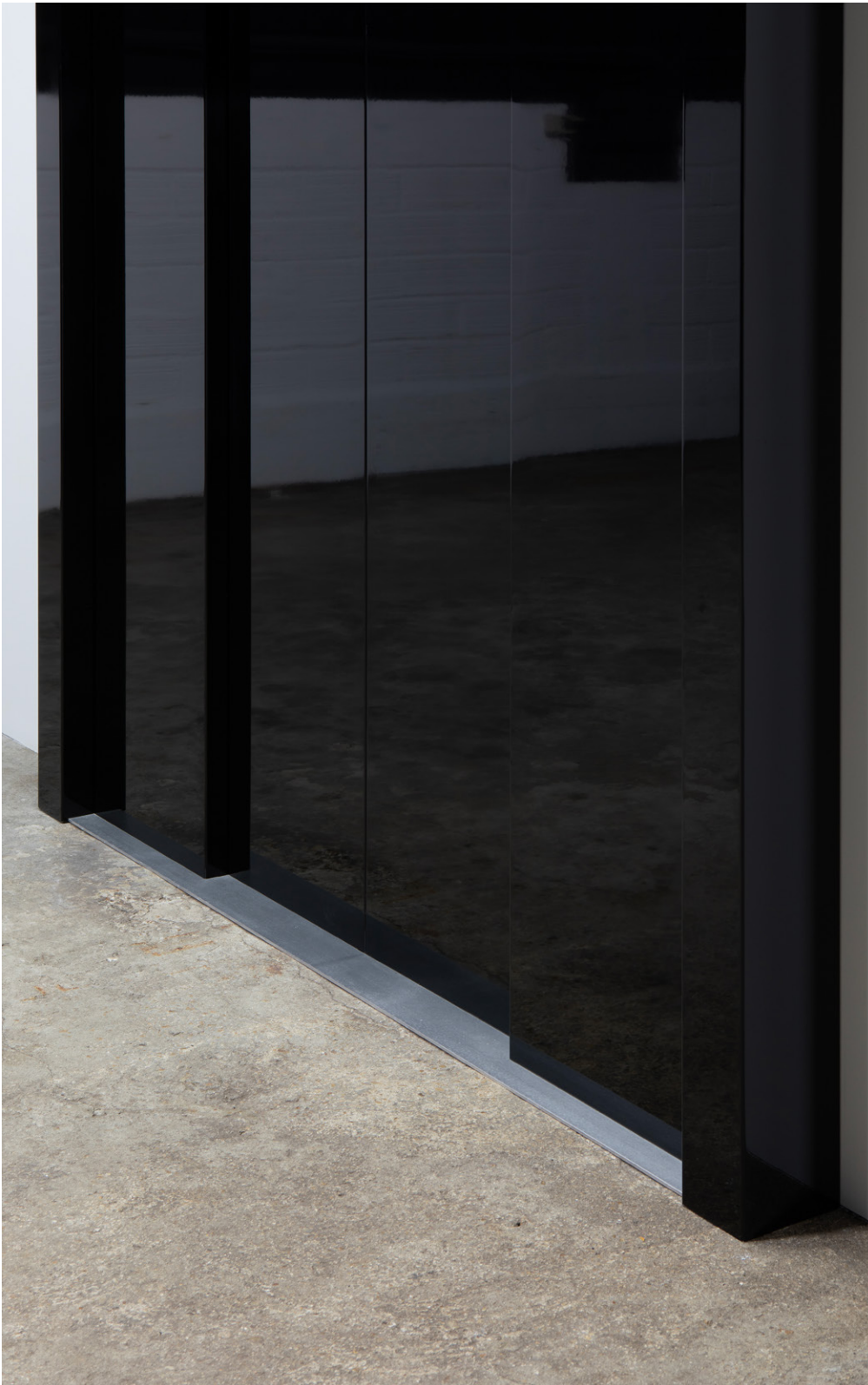
Gabriele Garavaglia Hell Door , 2023 (detail) Wood, steel, 2K lacquer 250 x 180 x 20 cm