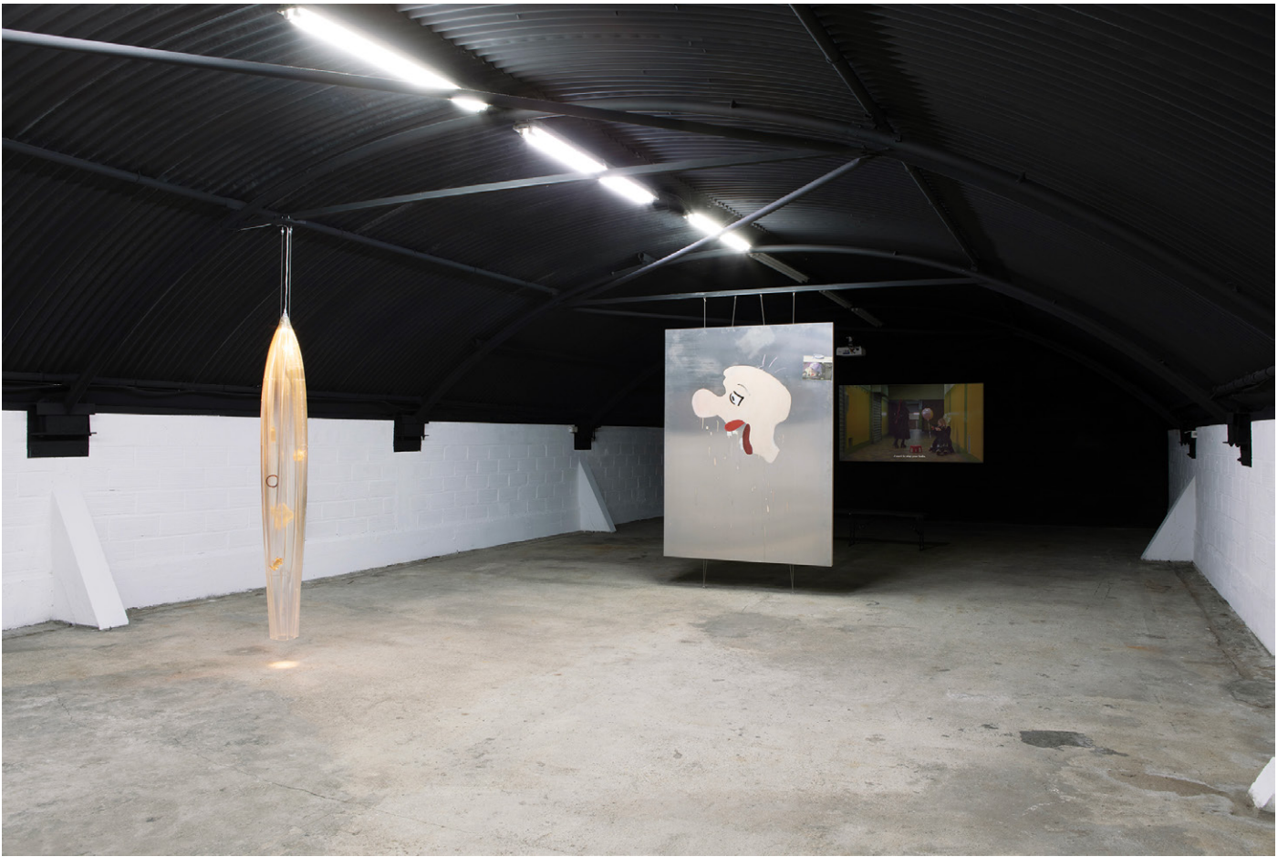
How Unreal We Are Exhibition view