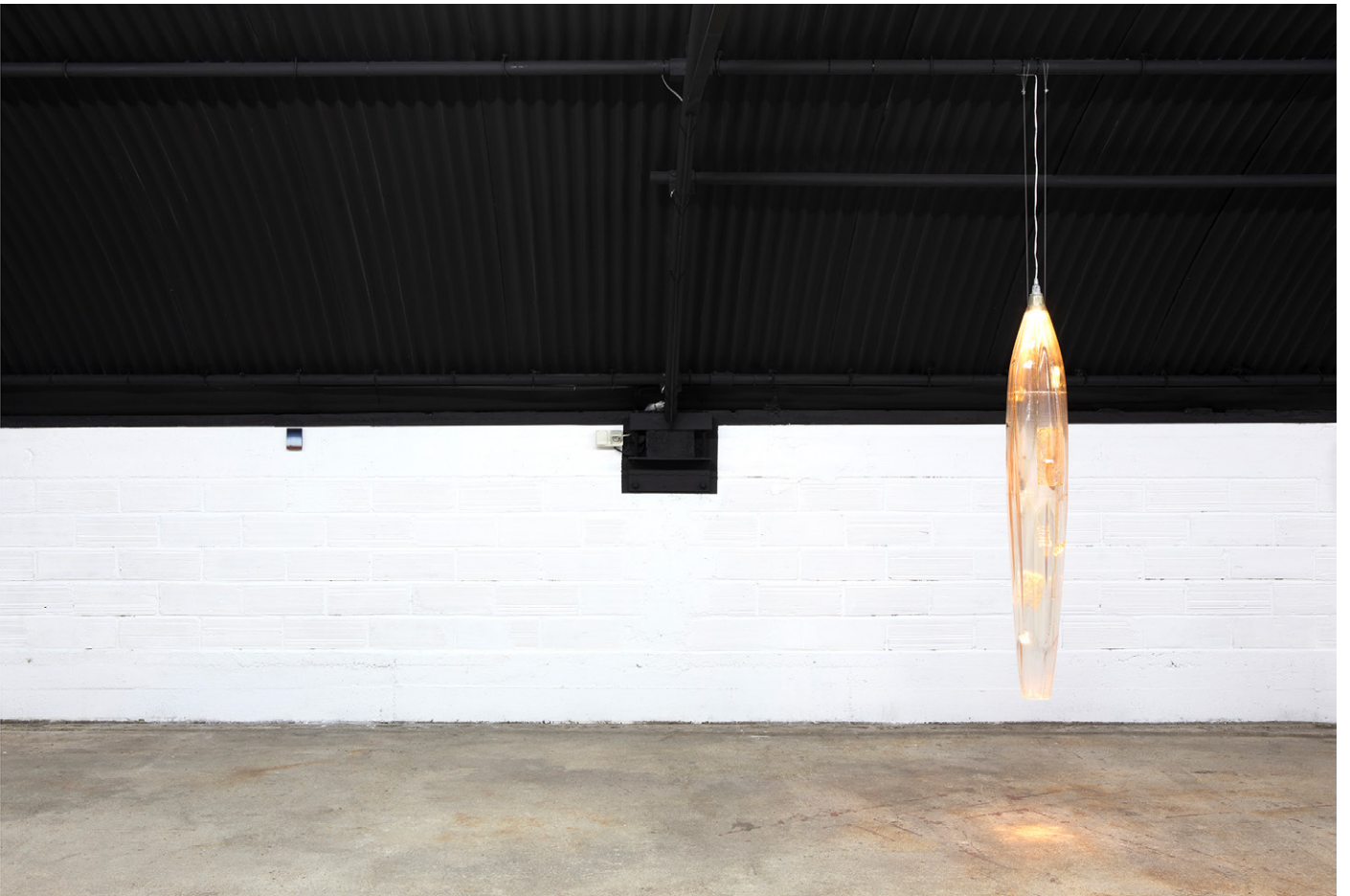
How Unreal We Are Exhibition view