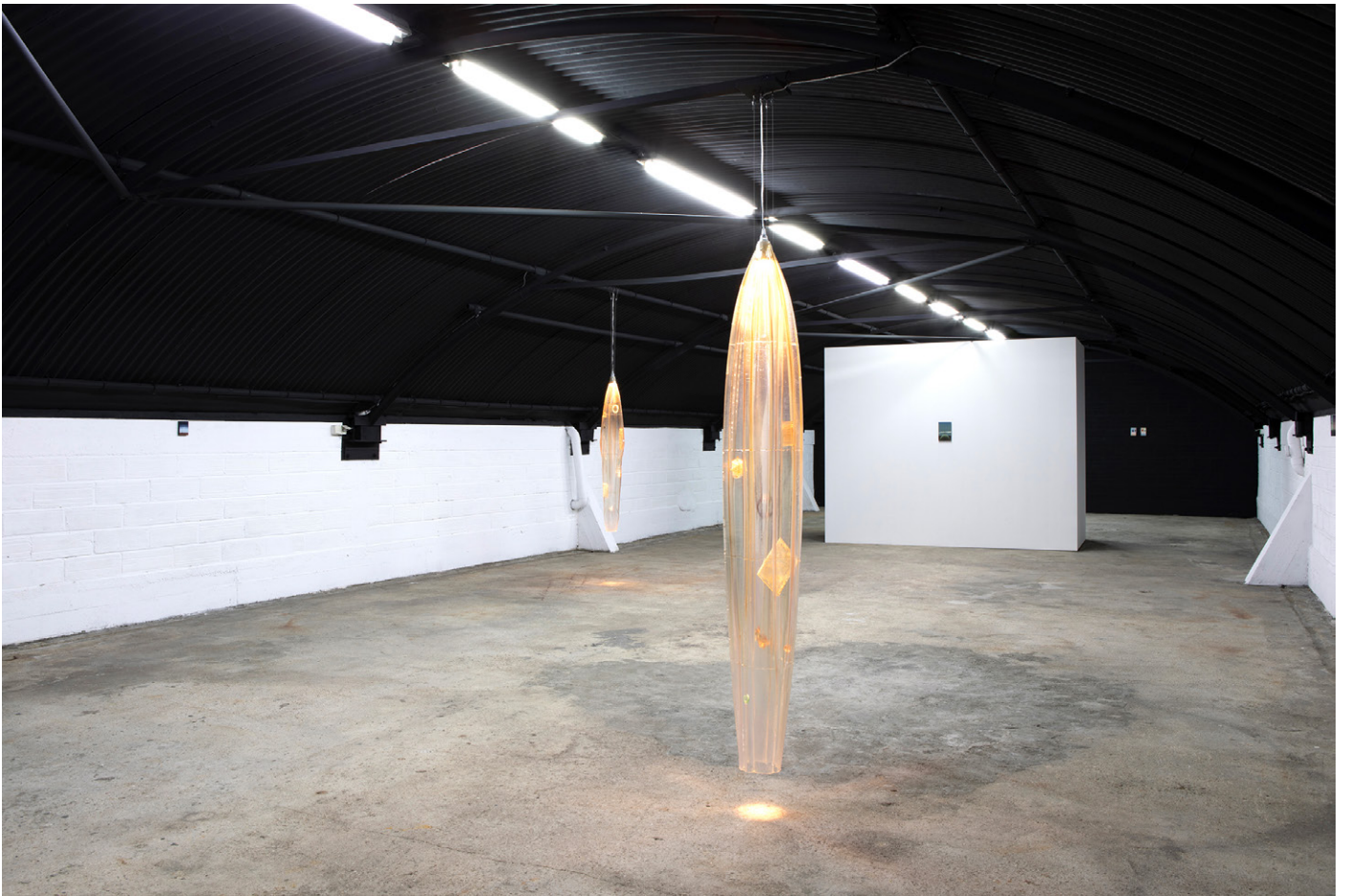
How Unreal We Are Exhibition view