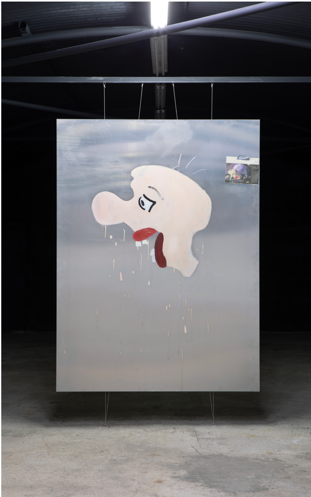
Benjamin Lallier Through Puberty To Success , 2023 Oil and newspaper on aluminum mounted on stretched canvas 200 x 150 cm courtesy the artist and Heidi, Berlin