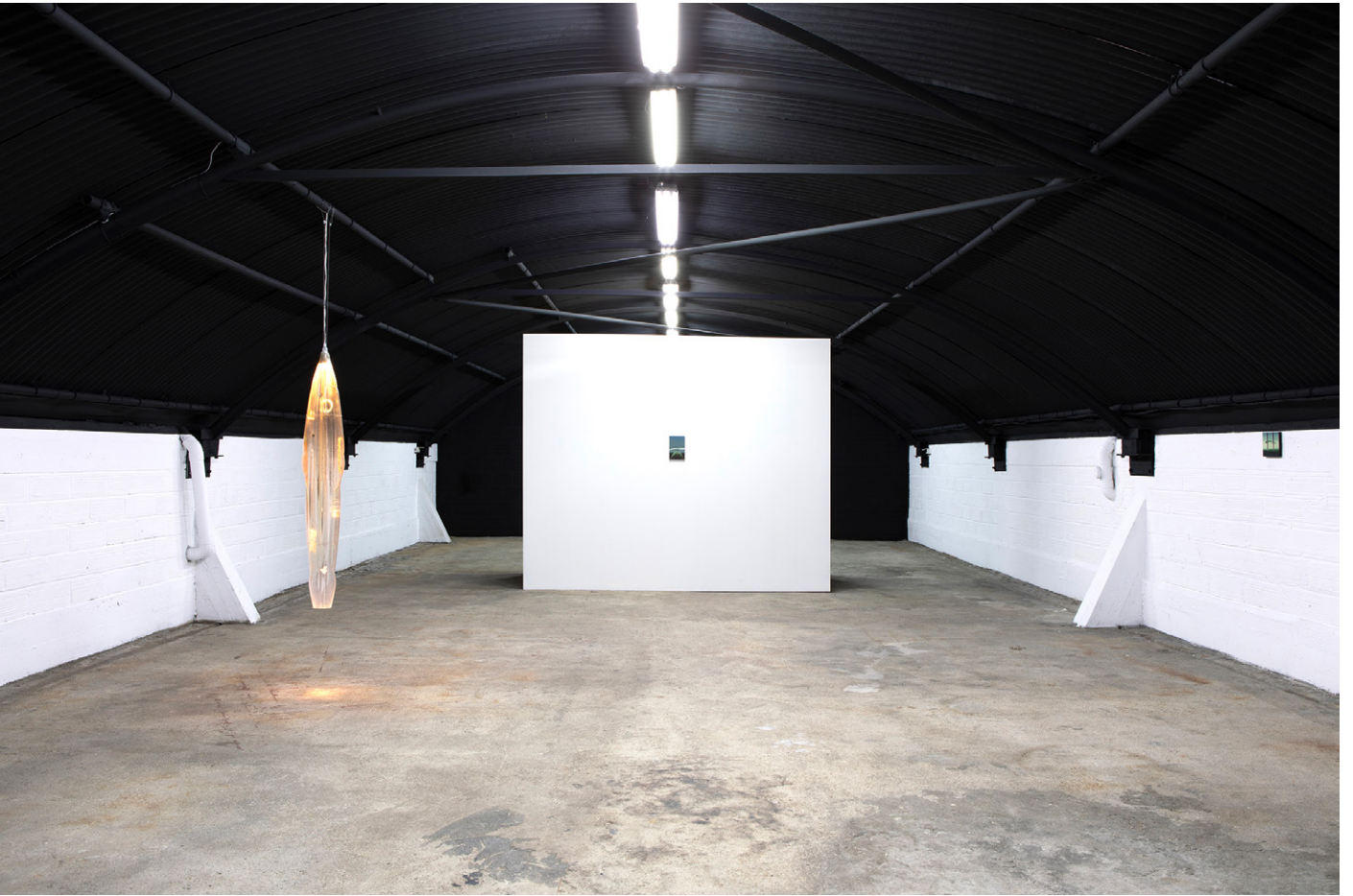
How Unreal We Are Exhibition view