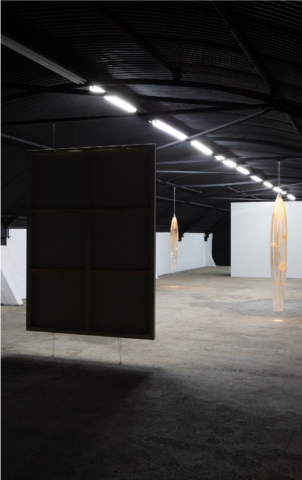
How Unreal We Are Exhibition view