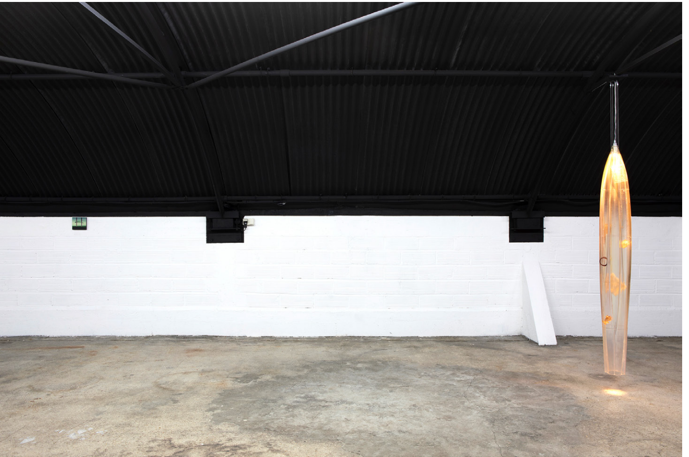
How Unreal We Are Exhibition view