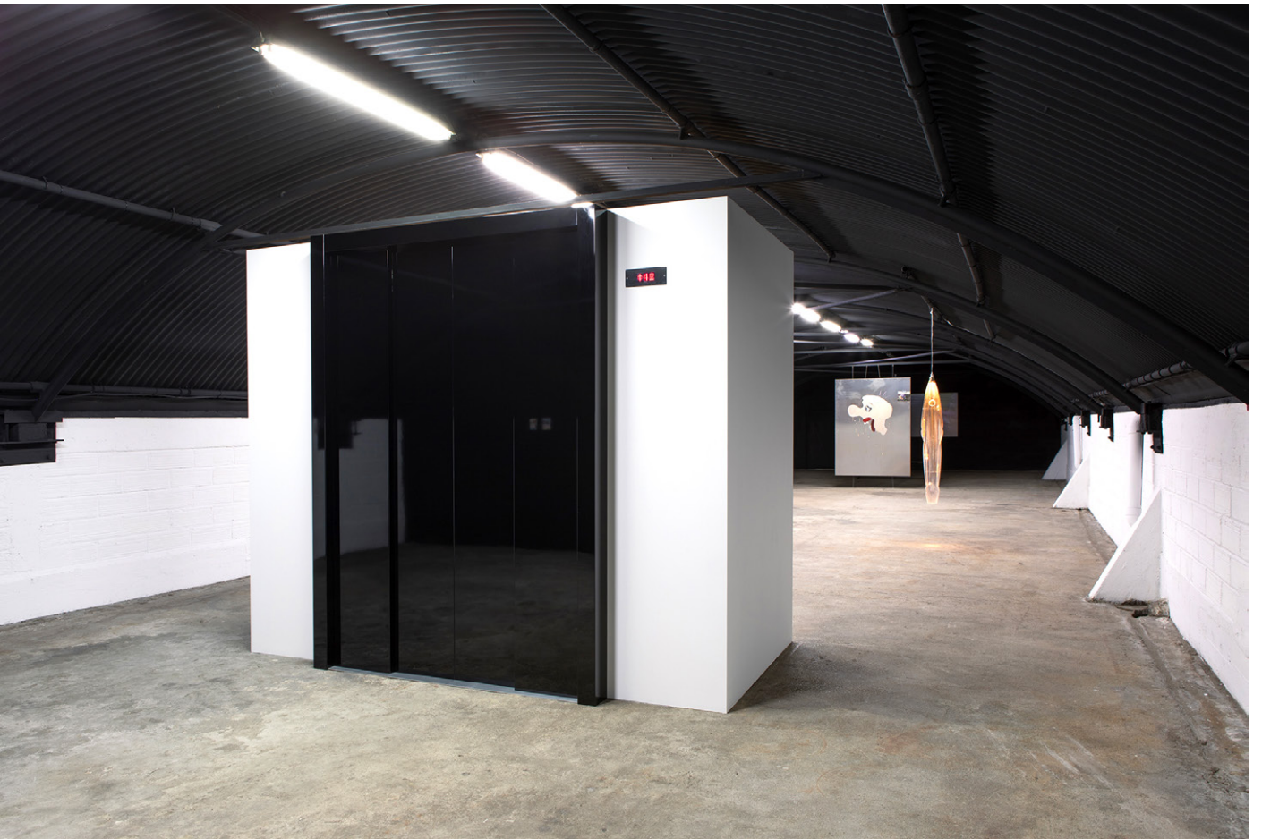
How Unreal We Are Exhibition view