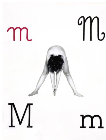
3. Alfabetiere murale (Mural alphabet), 1976 (detail of the work) Photo collage on cardboard, 21 elements, 35,5 x 25,5 cm each

Press relations: Alyson Onana Zobo alyson.onana-zobo@noisylesec.fr