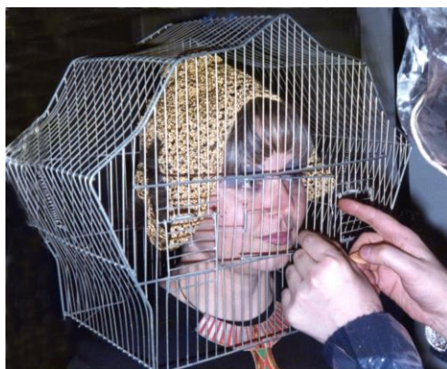
2. Donna in gabbia (Woman in a cage), 1974 Performance's elements: cage, photograph, variable dimensions